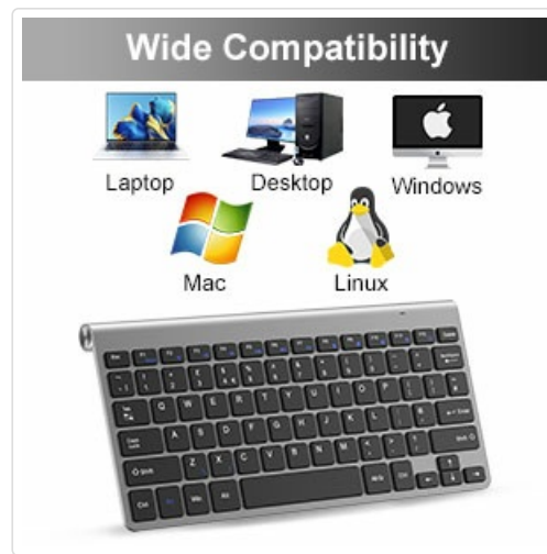
Image 5.1: Visual representation of the wide compatibility with various devices and operating systems.