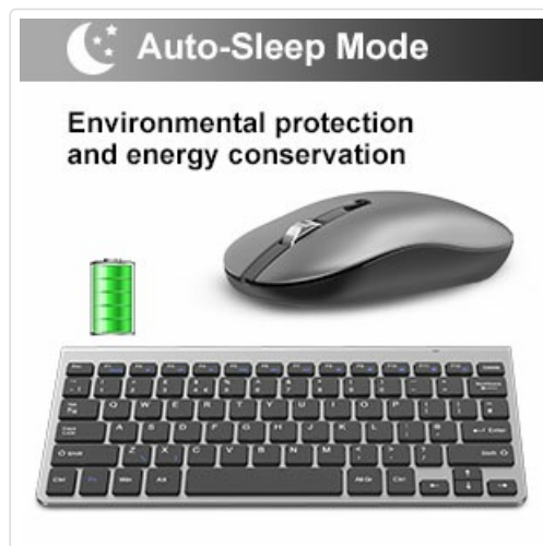
Image 4.5: Illustration of the auto-sleep mode for power conservation.

To wake the devices, simply press any key on the keyboard or move the mouse. This feature allows for continuous operation for up to 6 months on a single set of batteries.