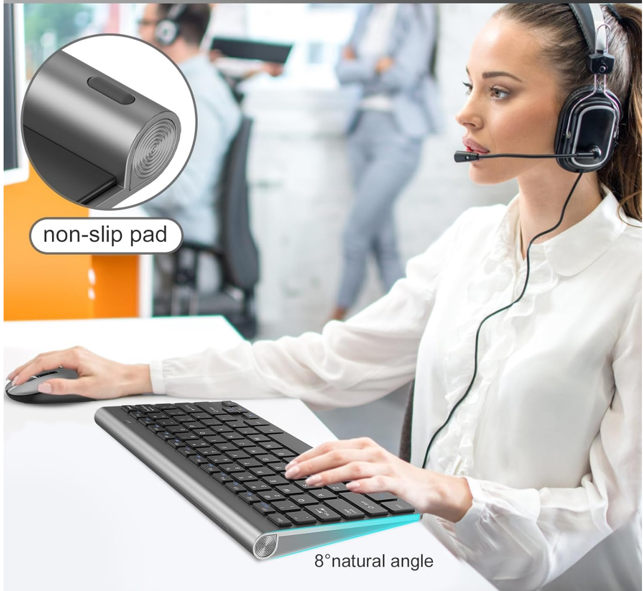
Image 4.1: The ergonomic design of the keyboard, featuring an 8-degree natural angle for comfortable typing.