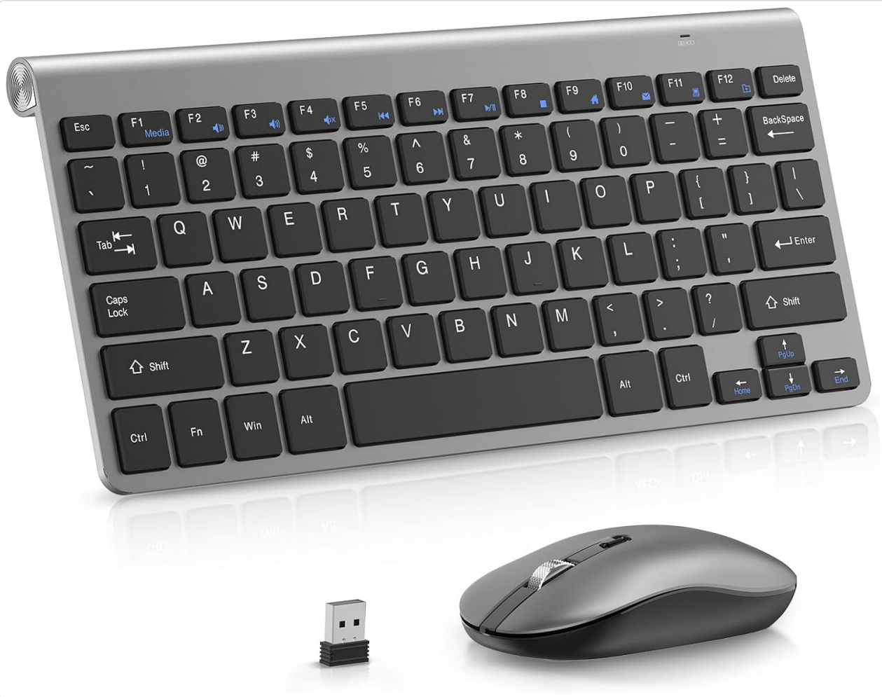
Image 2.1: The PINKCAT Mini Wireless Keyboard and Mouse Combo, including the USB receiver.