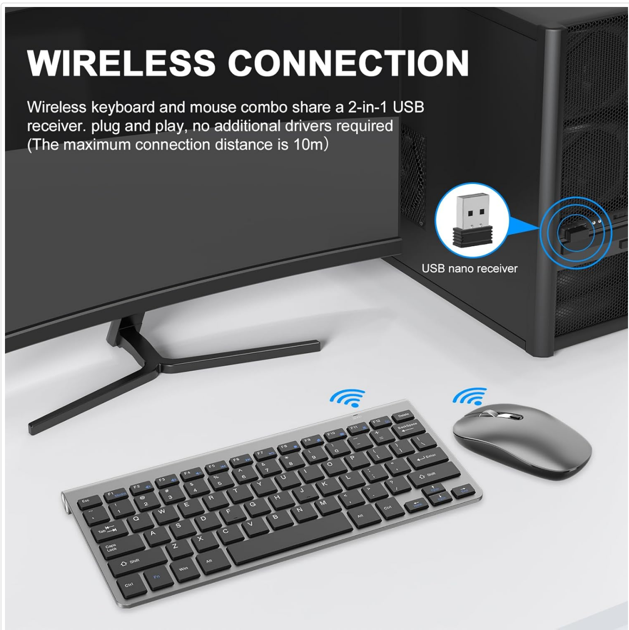
Image 3.2: Illustration of plugging the USB receiver into a computer's USB port.