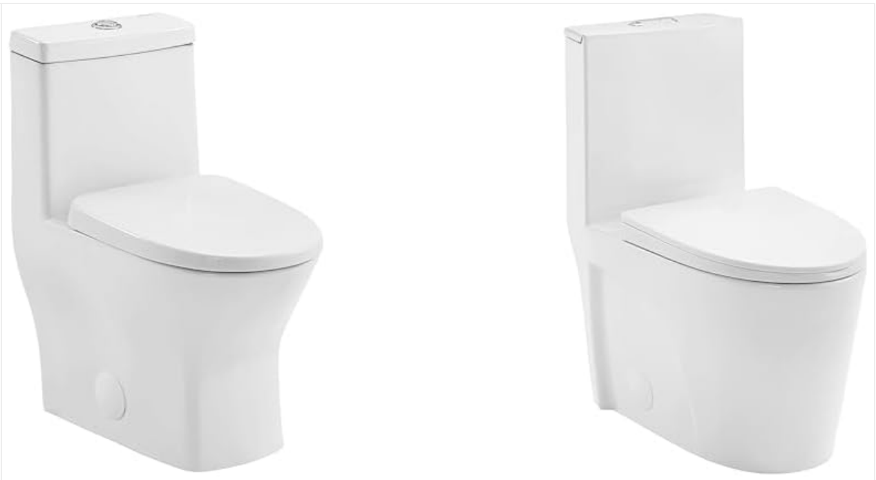
Image: The Swiss Madison Sublime II (left) and St. Tropez (right) one-piece toilets, showcasing their distinct designs.

This manual provides detailed instructions for the installation, operation, maintenance, and troubleshooting of your Swiss Madison SM-1T277 Sublime II One-Piece Round Toilet and SM-1T254 St. Tropez One Piece Toilet. Please read this manual thoroughly before installation and use to ensure proper function and longevity of your product.