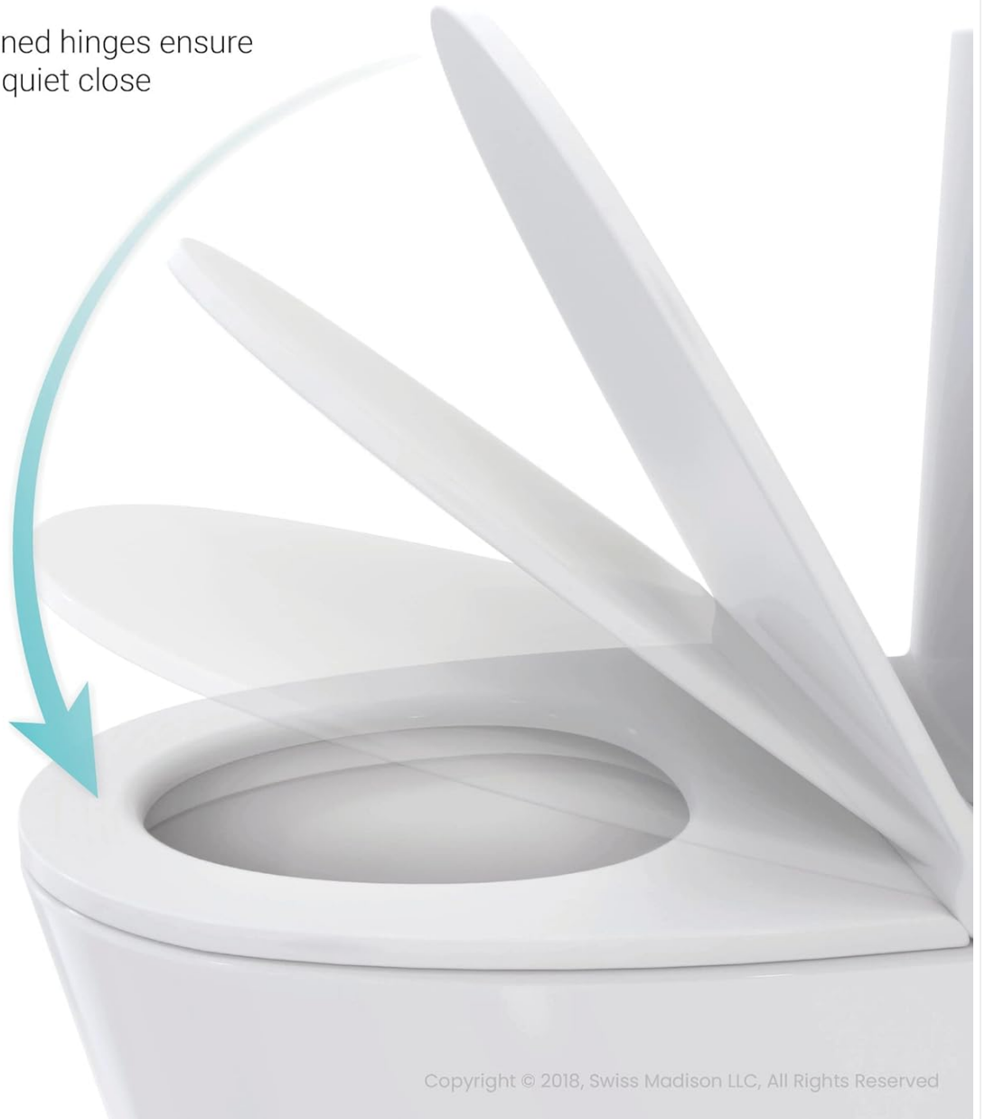
Image: Demonstration of the soft-close toilet seat mechanism, ensuring quiet and gentle closing.

Tensioned hinges ensure a soft, quiet close