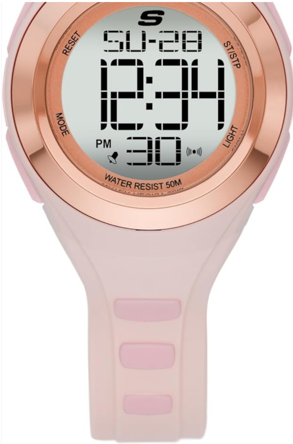
Image 1: Front view of the Skechers Tennyson Digital Watch, displaying the time, date, and various icons.