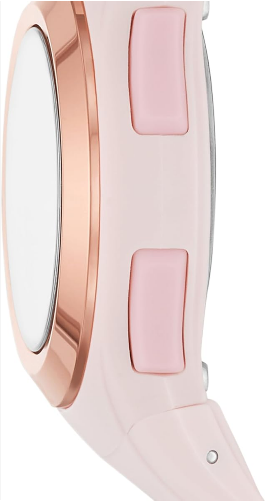
Image 2: Side view of the watch, highlighting the control buttons on the right side of the case.