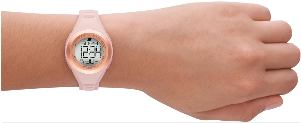
Image 3: The Skechers Tennyson Digital Watch as it appears when worn on a wrist.