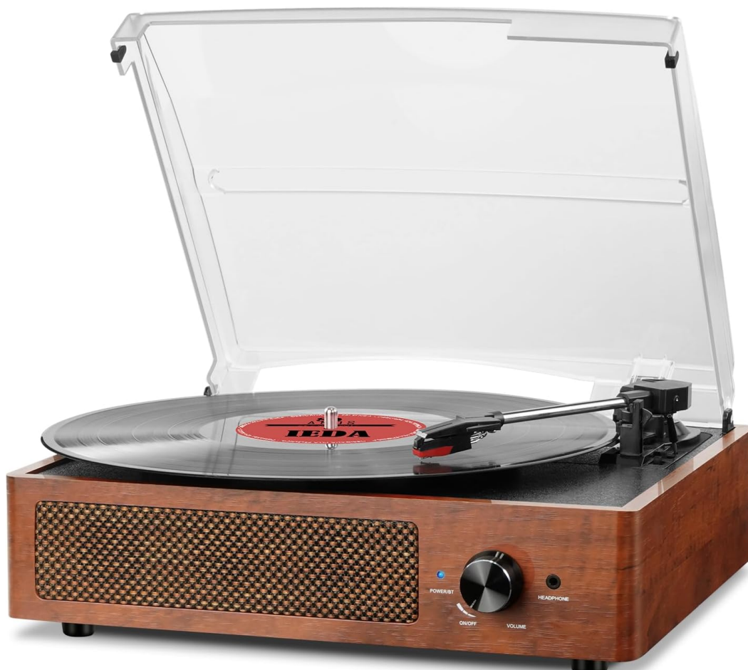
Image: The cotsoco M49OR Record Player in its operational state.

The cotsoco M49OR is a versatile belt-driven record player featuring built-in stereo speakers, Bluetooth connectivity for wireless audio streaming, AUX-in for external audio sources, RCA line output for connecting to external amplifiers, and a headphone jack for private listening. It supports three playback speeds (33, 45, and 78 RPM) and three record sizes (7", 10", and 12").