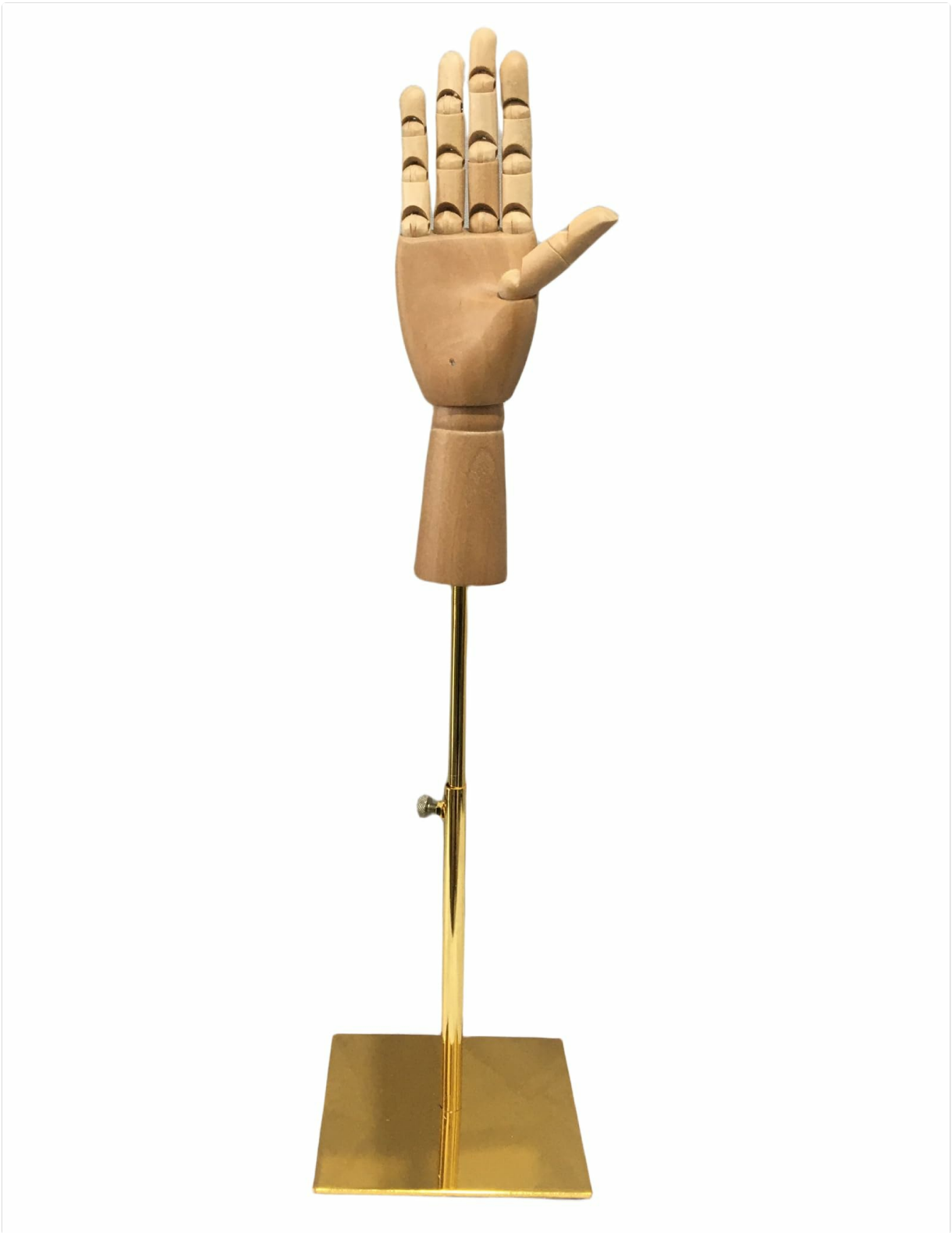
Figure 1: Fully assembled Generic WDH01 wooden mannequin display hand with a golden square base, posed in an 'OK' gesture.