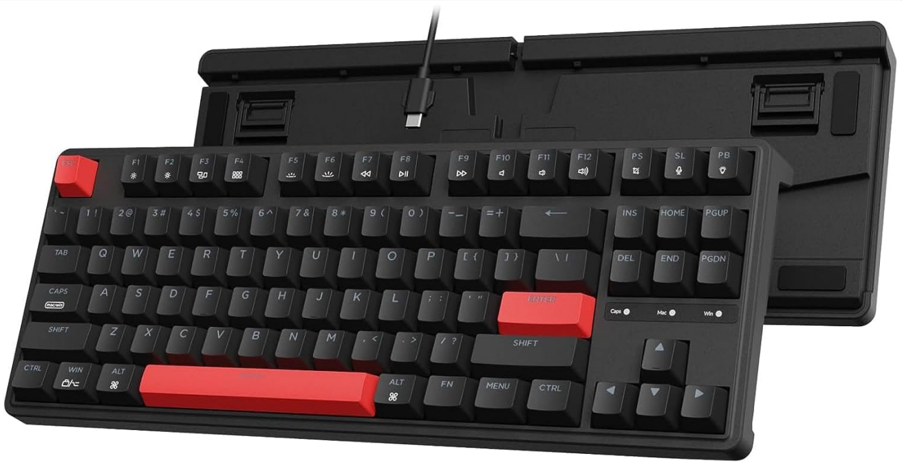
Figure 1: Keychron C3 Pro keyboard with its USB-C cable connected, ready for use.