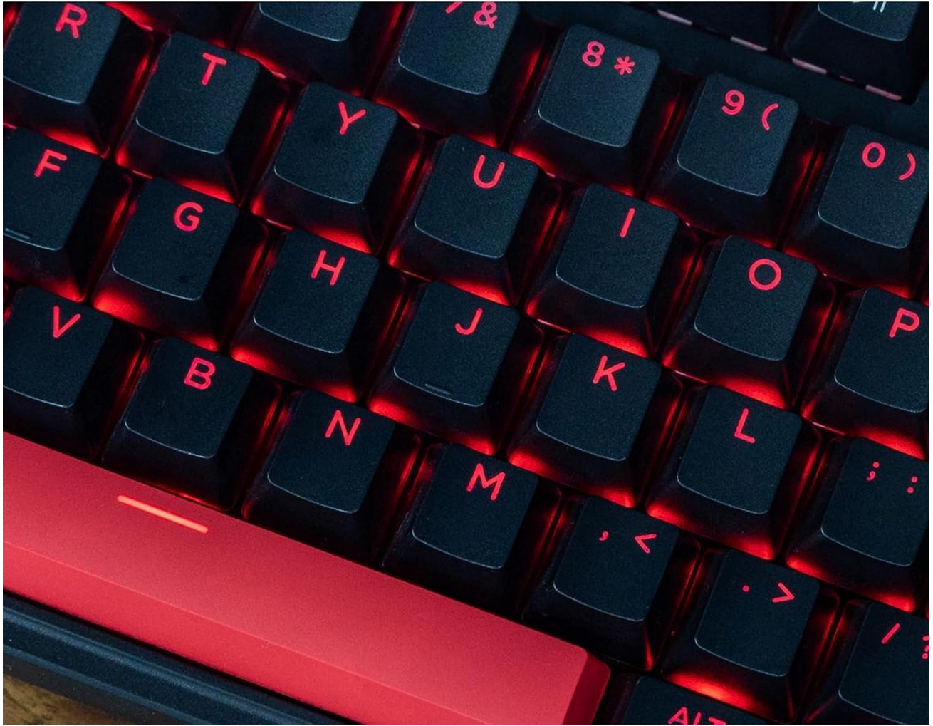
Figure 3: The red LED backlighting illuminates the shine-through key legends, offering various dynamic effects.