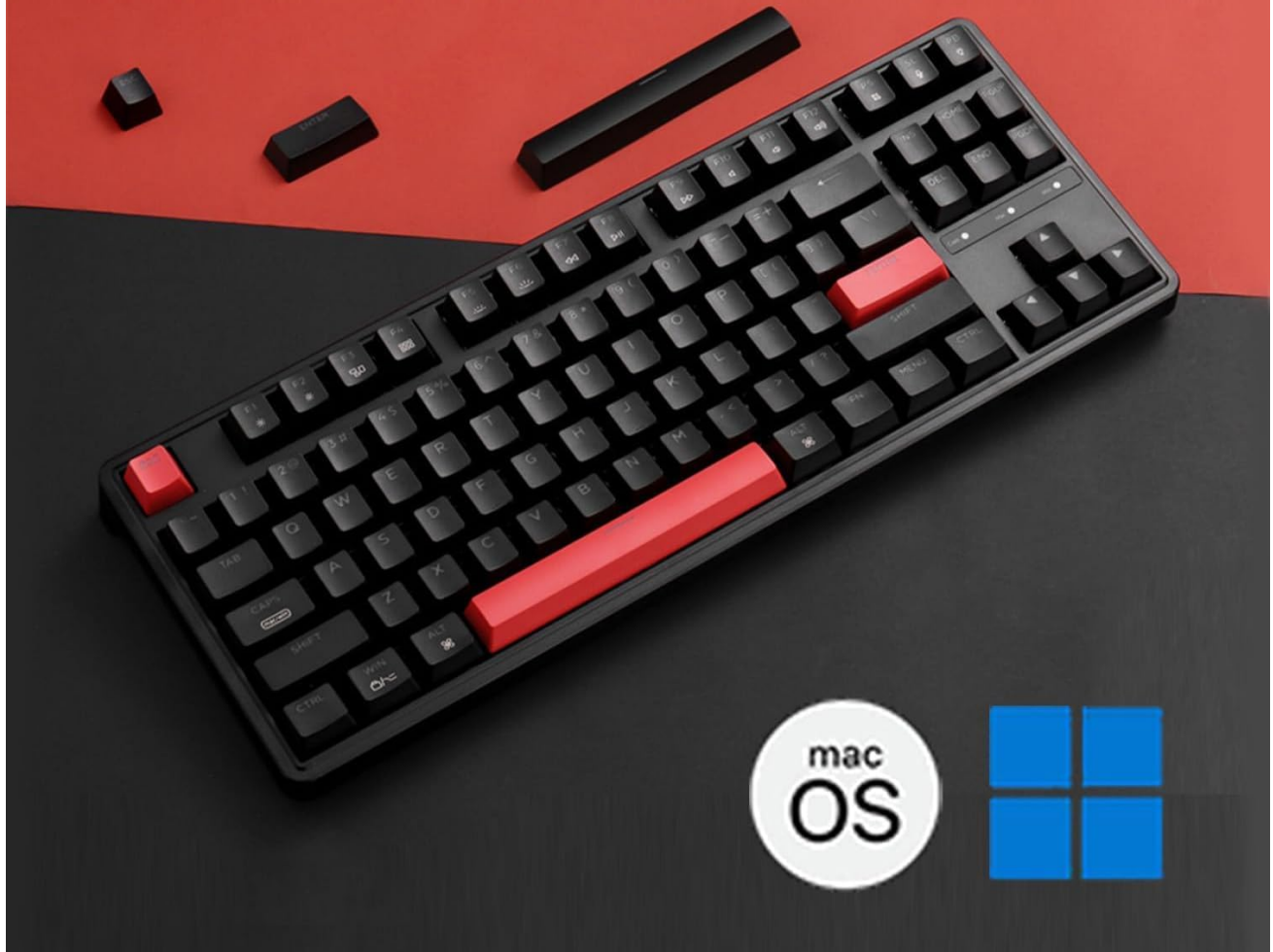
Figure 2: The keyboard features dedicated indicator lights for Mac and Windows modes, easily toggled with Fn + Caps Lock.