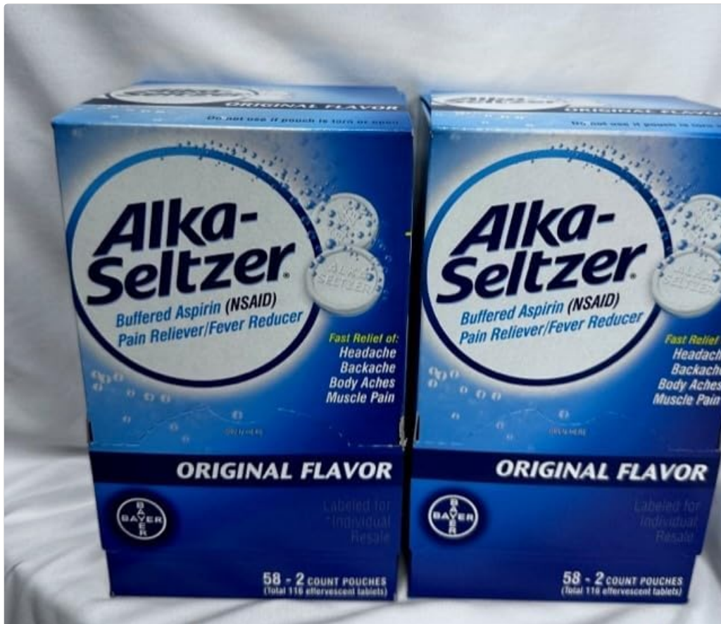
Figure 1: Front view of Alka-Seltzer Original Effervescent Tablets packaging. This image displays the product branding and primary claims.

Alka-Seltzer Original Effervescent Tablets are designed to dissolve quickly in water, providing a buffered solution that helps neutralize stomach acid and relieve pain. Each tablet contains Buffered Aspirin (NSAID) as a pain reliever and fever reducer.