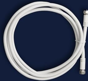
6' Coaxial Cable