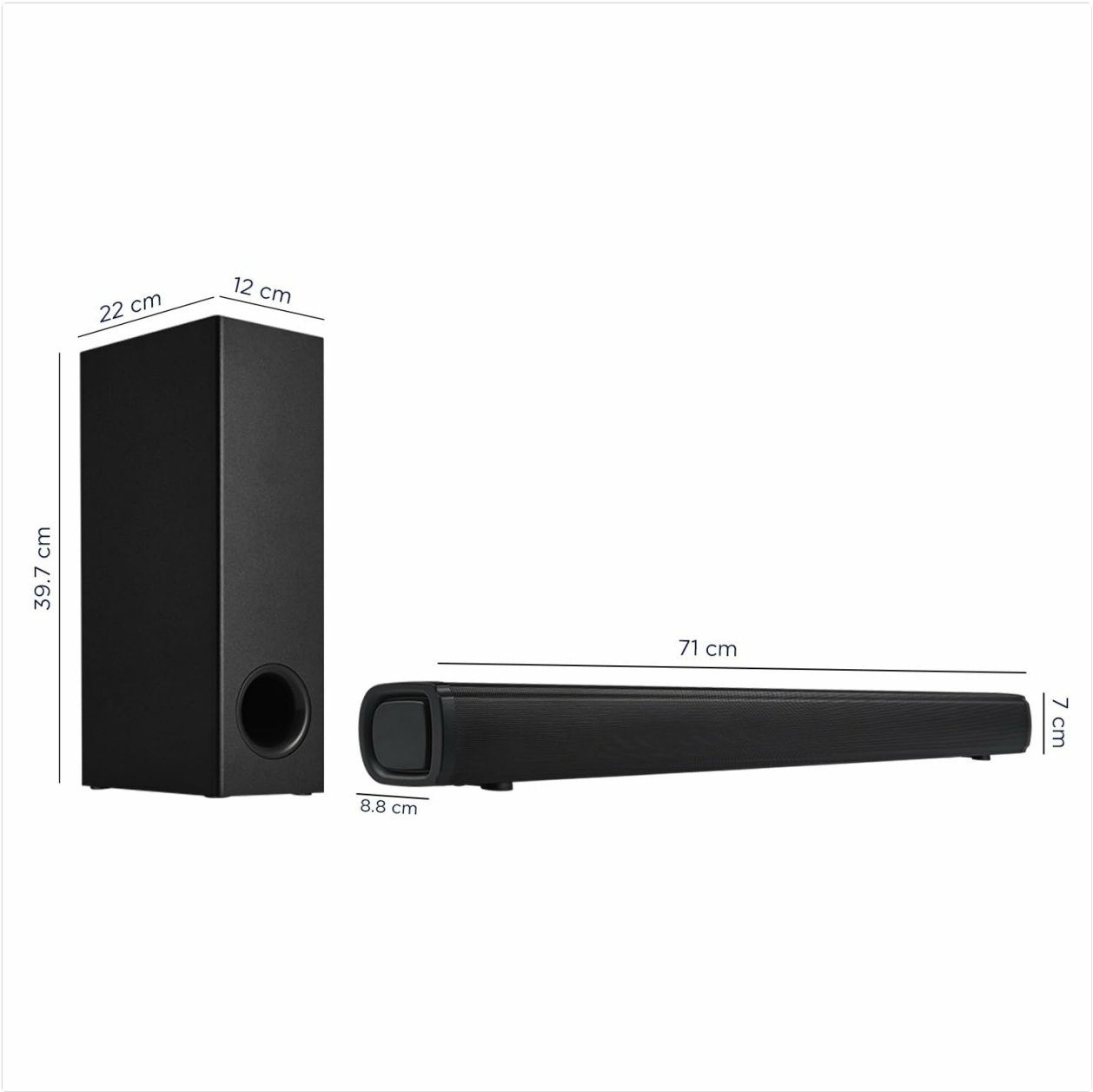
A diagram illustrating the physical dimensions of the TCL S332W soundbar and its wired subwoofer. The soundbar measures