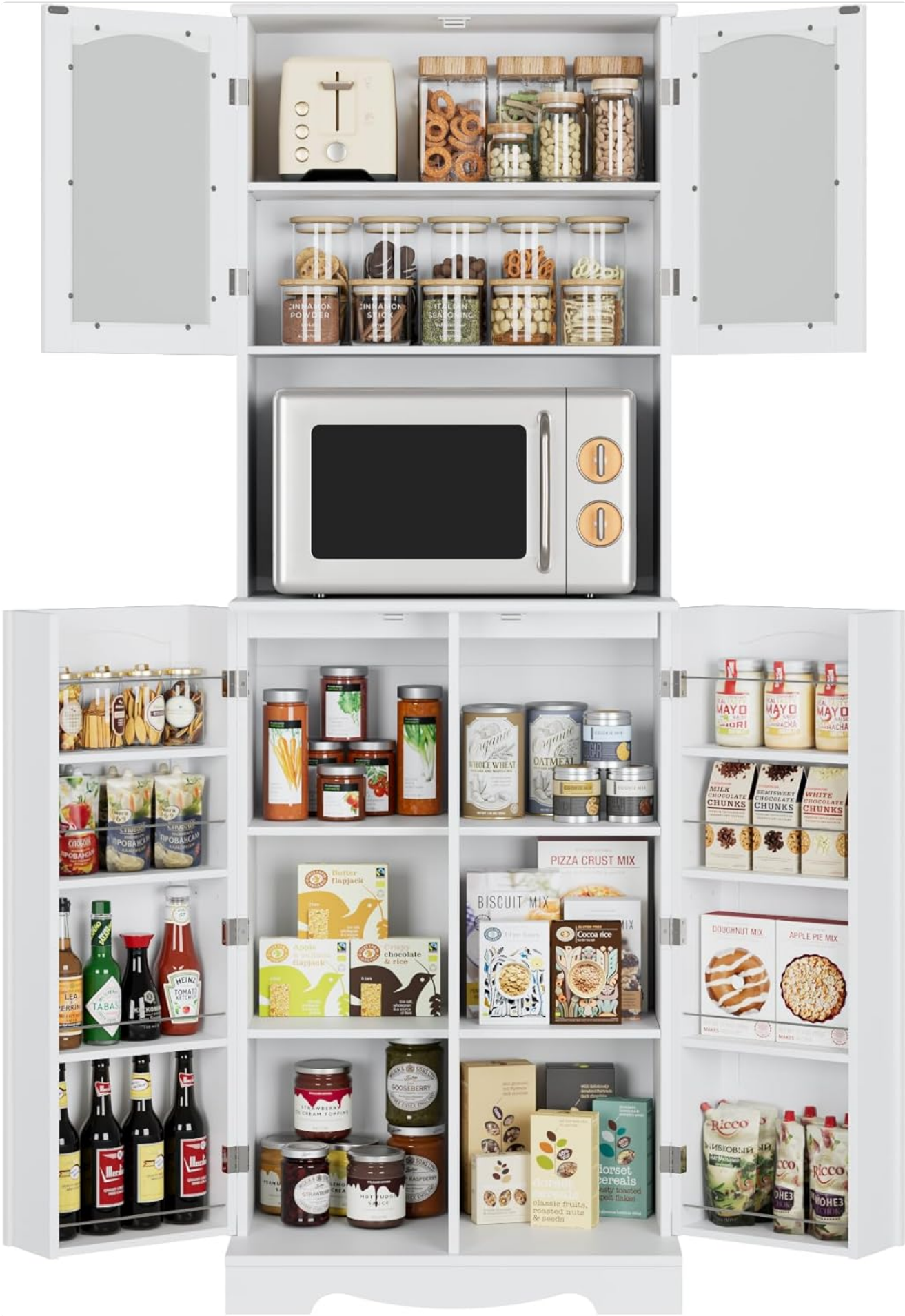
Figure 6.1: Fully Stocked Pantry Cabinet. This image illustrates the cabinet's capacity, showing it filled with groceries, kitchen appliances, and other essentials, demonstrating its organizational potential.

them to the desired height, and place the shelf back.