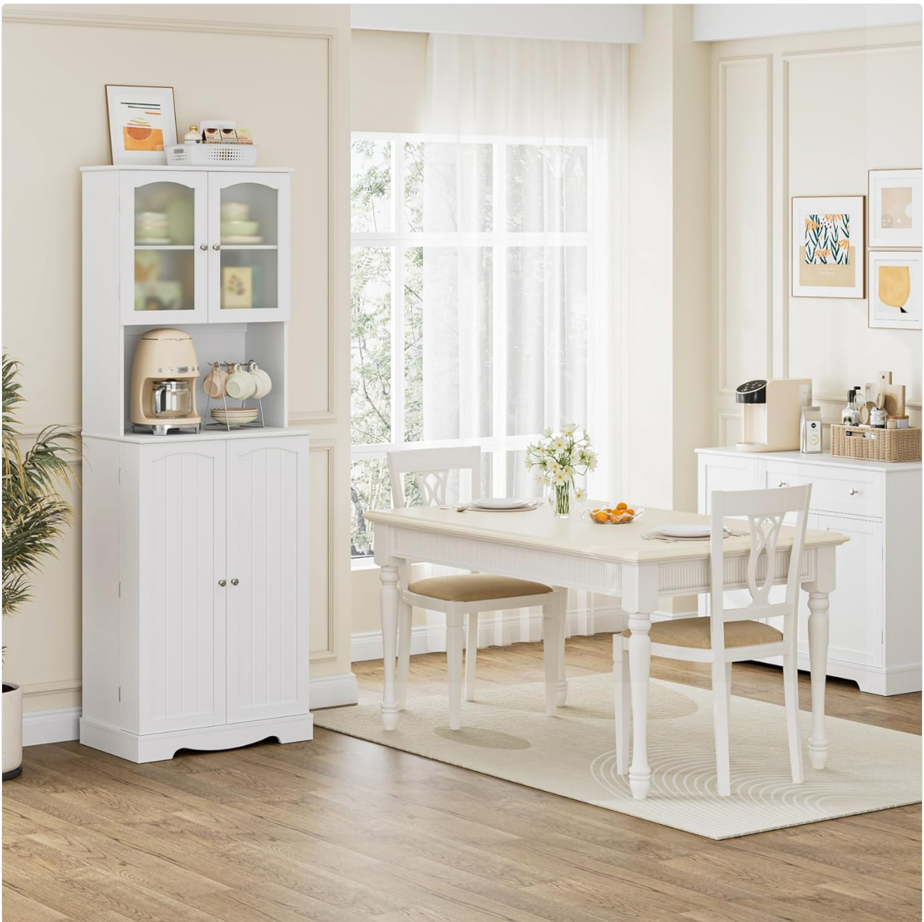
Figure 5.1: Cabinet in a Dining Room Setting. This image shows the fully assembled cabinet positioned in a dining room, demonstrating its integration into a home environment.