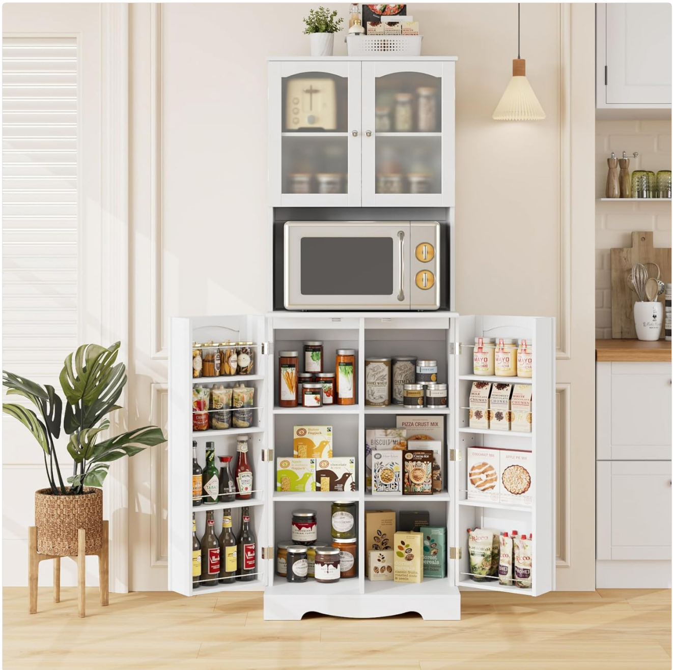
Figure 6.2: Organized Interior Storage. A detailed view of the cabinet's interior, showcasing how different types of items can be neatly arranged on the main shelves and the slim door racks.