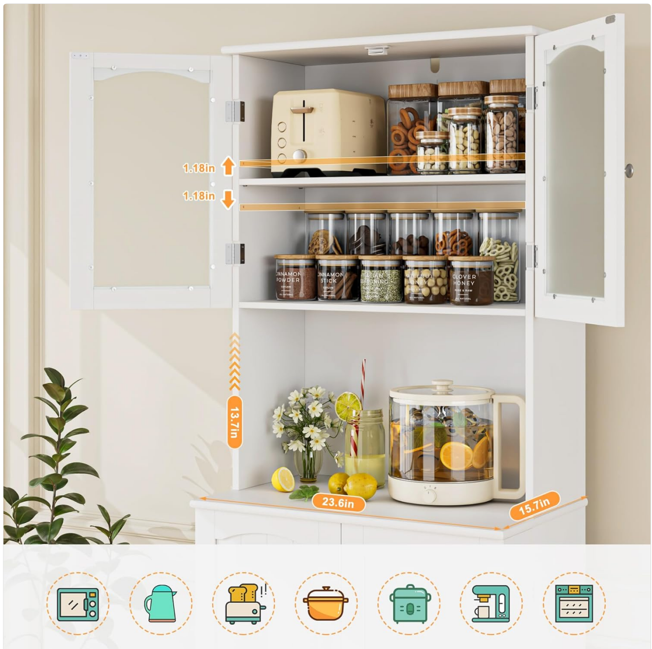
Figure 4.3: Upper Cabinet and Microwave Compartment. This image focuses on the upper part of the cabinet, showcasing the adjustable shelves behind the frosted glass doors and the open compartment designed to fit a microwave or other small appliances.