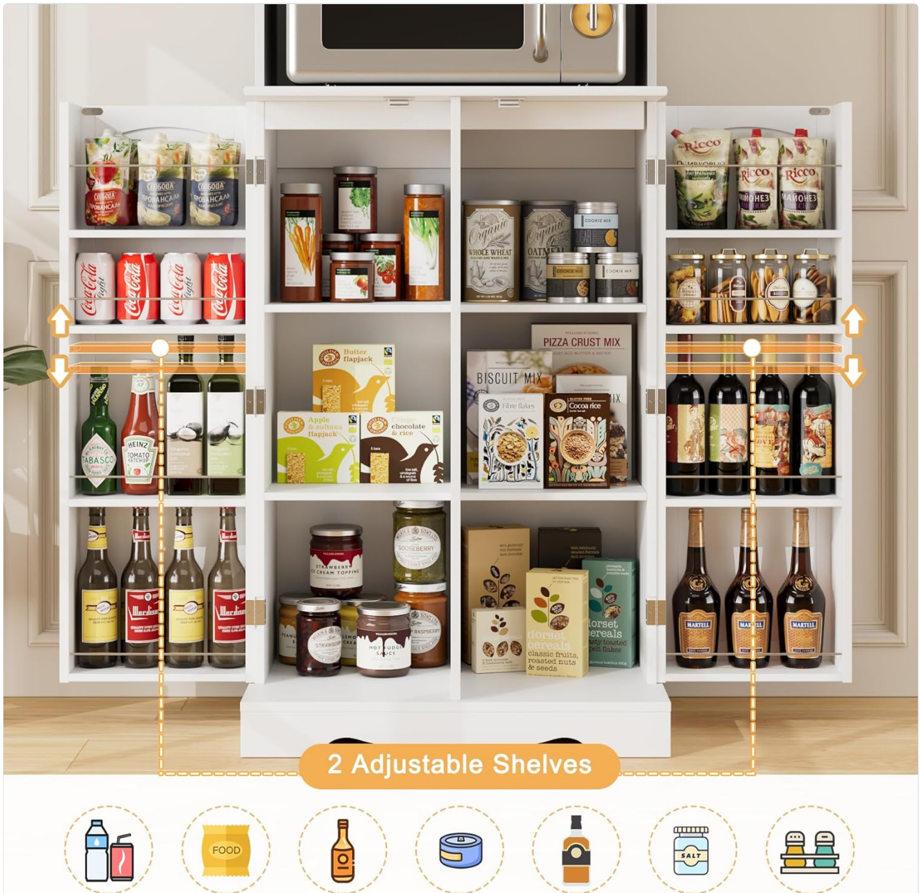
Figure 4.2: Adjustable Shelves in Lower Section. This image demonstrates the adjustable shelves in the lower cabinet, showing how they can be repositioned to accommodate items of various heights, along with items stored on the convenient door racks.