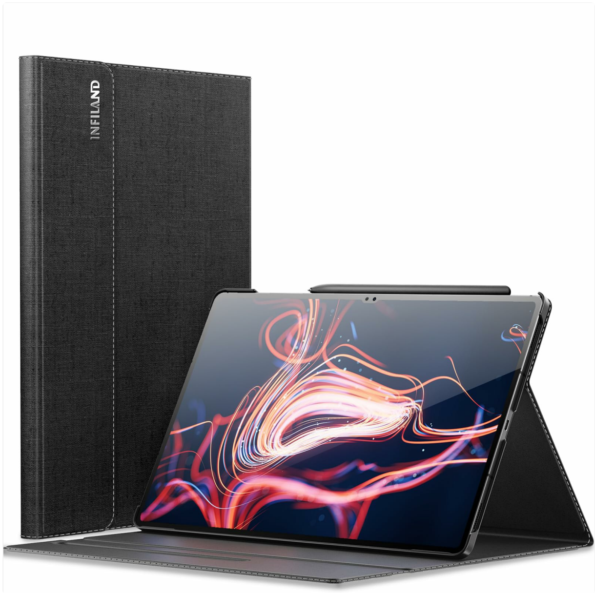
Image: Samsung Galaxy Tab securely installed in the INFILAND case.