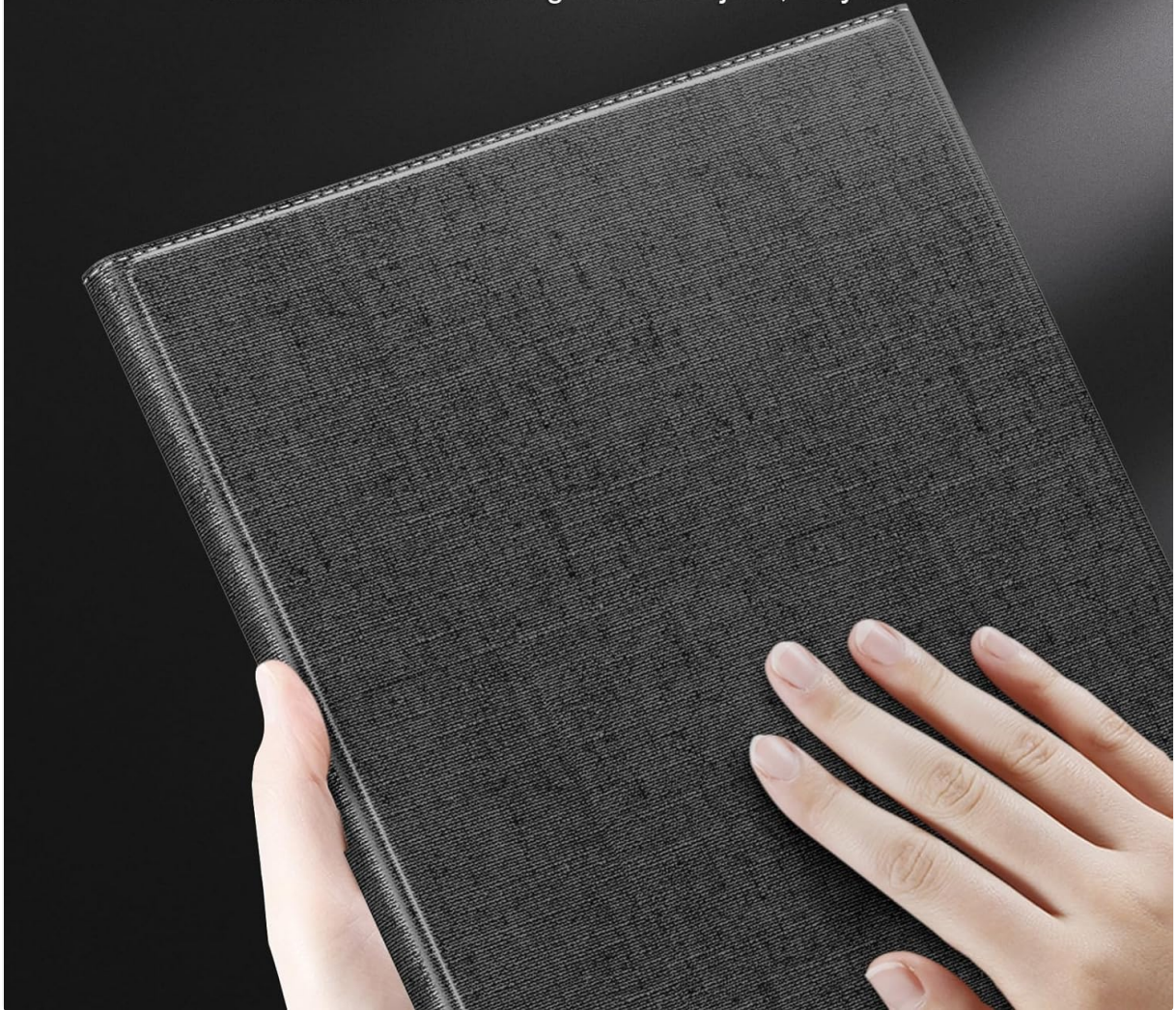
Image: The PU leather exterior offers a comfortable texture and is easy to clean.

Comfortable hands feeling like denim jean, very durable.