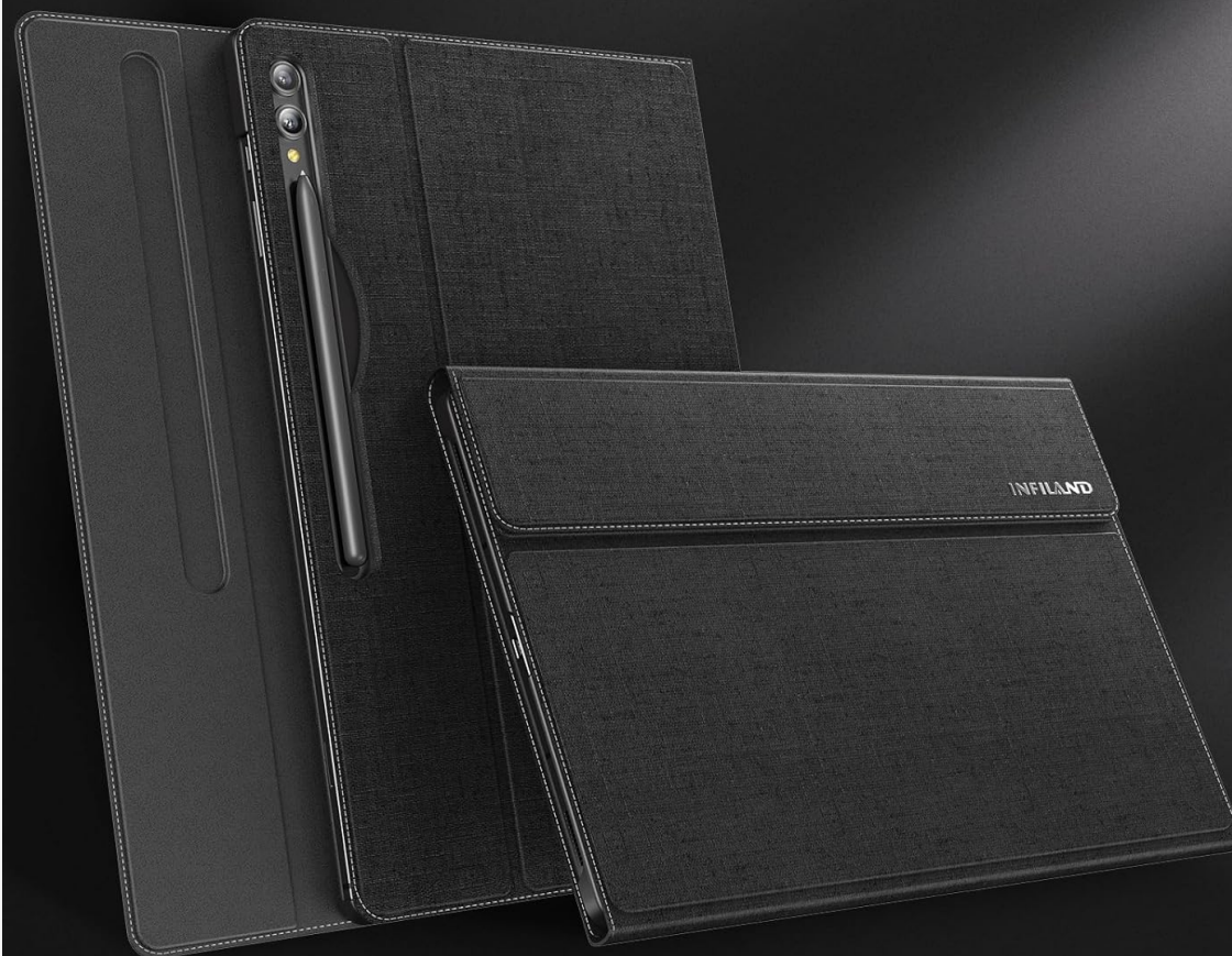
Image: The magnetic closure buckle ensures the case remains securely closed.

The protective case is designed with a magnetic snap closure, which will automatically close magnetically when shutting cover.