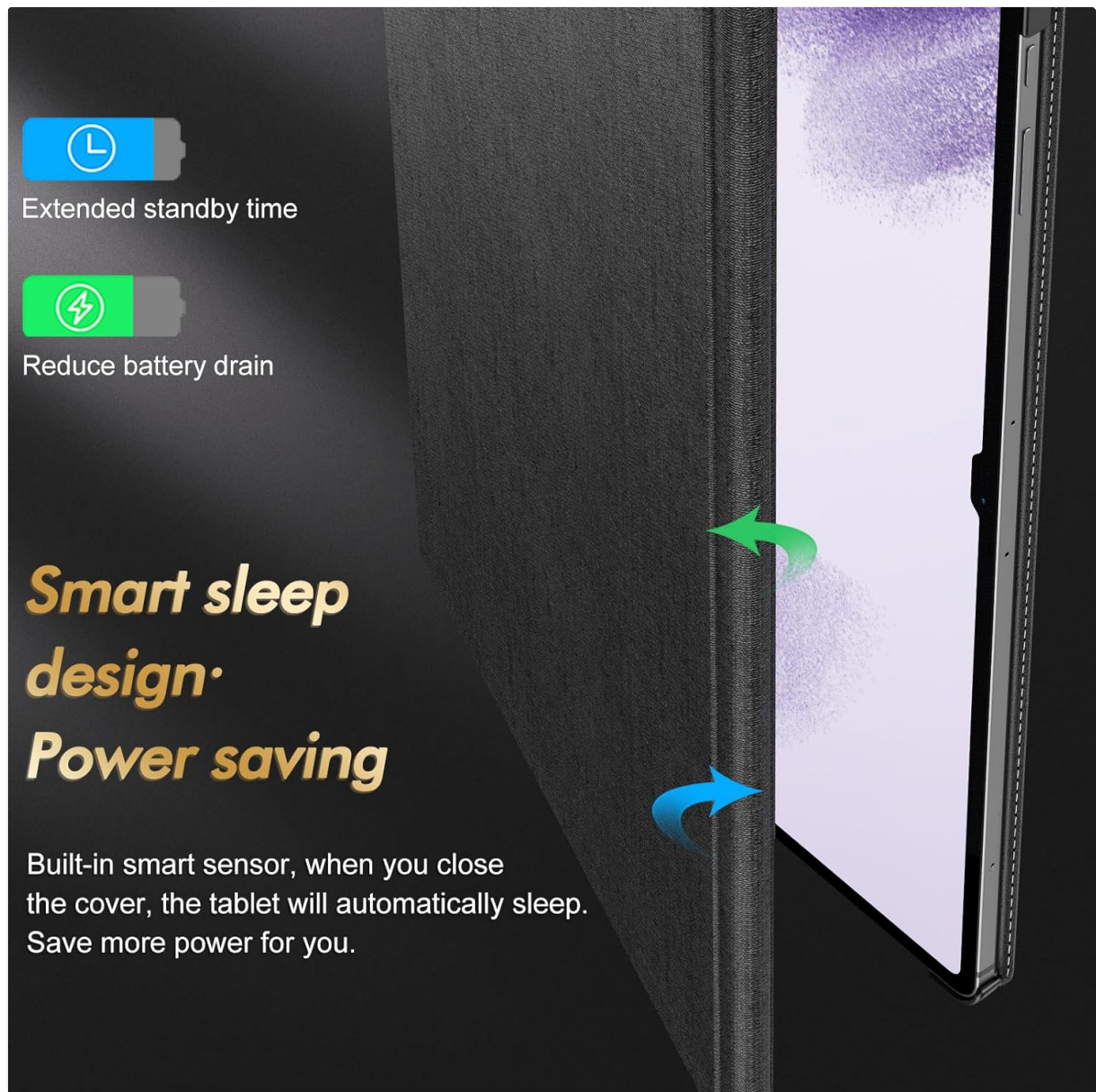
Image: Smart sleep design for power saving.