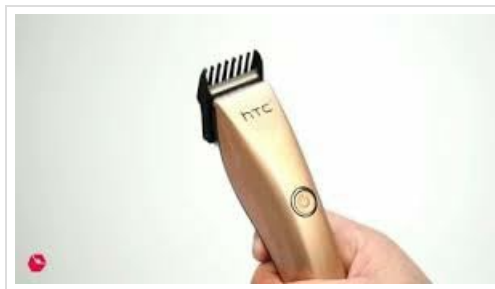
Image 4.1: The HTC AT-206A trimmer held in hand, demonstrating its ergonomic design for ease of use.