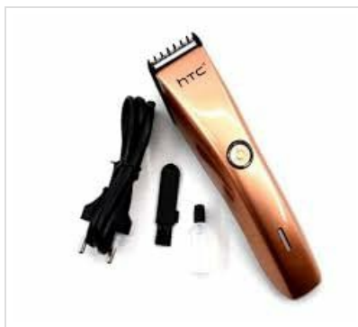
Image 2.2: The HTC AT-206A trimmer displayed with its charging cable, cleaning brush, oil bottle, and comb attachment.