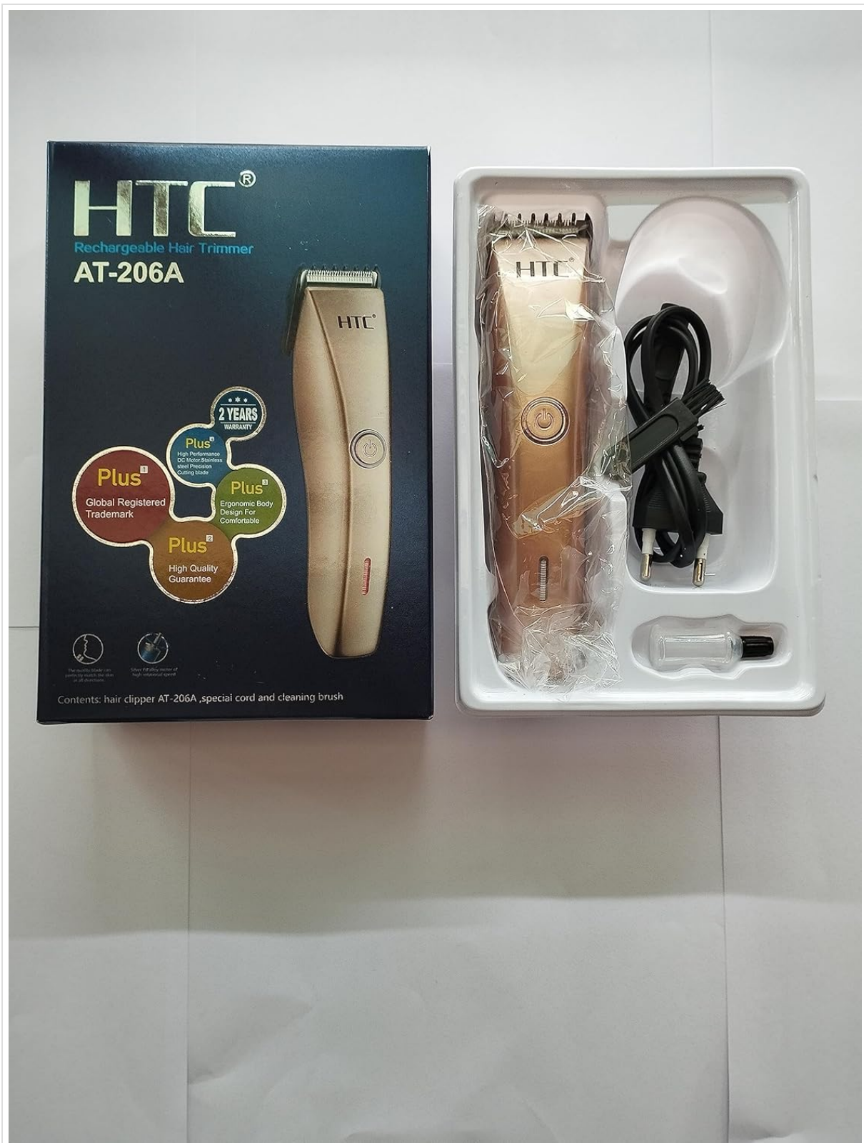
Image 2.1: HTC AT-206A Trimmer and its retail packaging, showing the device and included accessories.