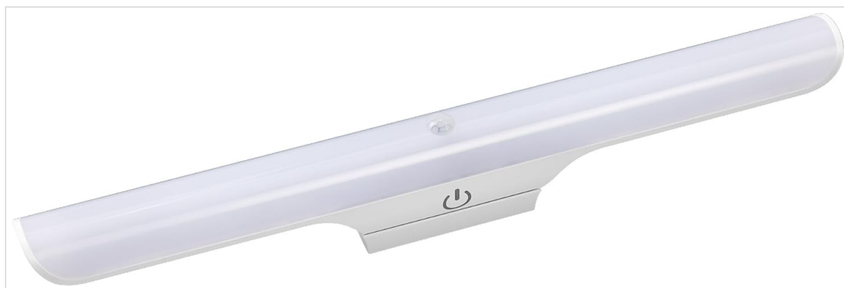
Figure 4: Close-up view of the light fixture, highlighting the integrated motion and daylight sensor. The power button is also visible.