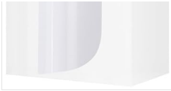
Figure 2: Product packaging. The packaging indicates the product's features and specifications.