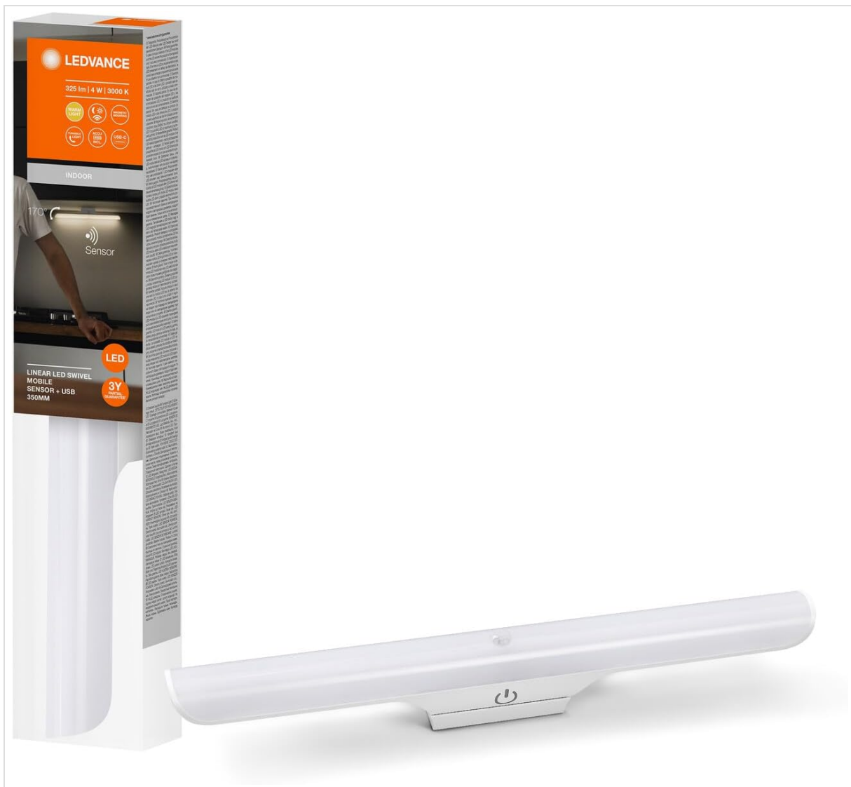
Figure 1: The LEDVANCE LINEAR LED SWIVEL Under Cabinet Light. This image shows the overall design of the light fixture.