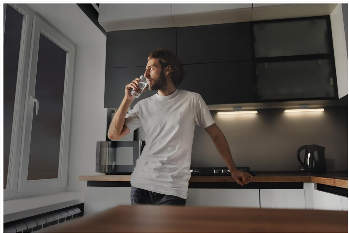
Figure 3: Example of the under cabinet light installed in a kitchen environment. The image demonstrates typical placement and illumination.