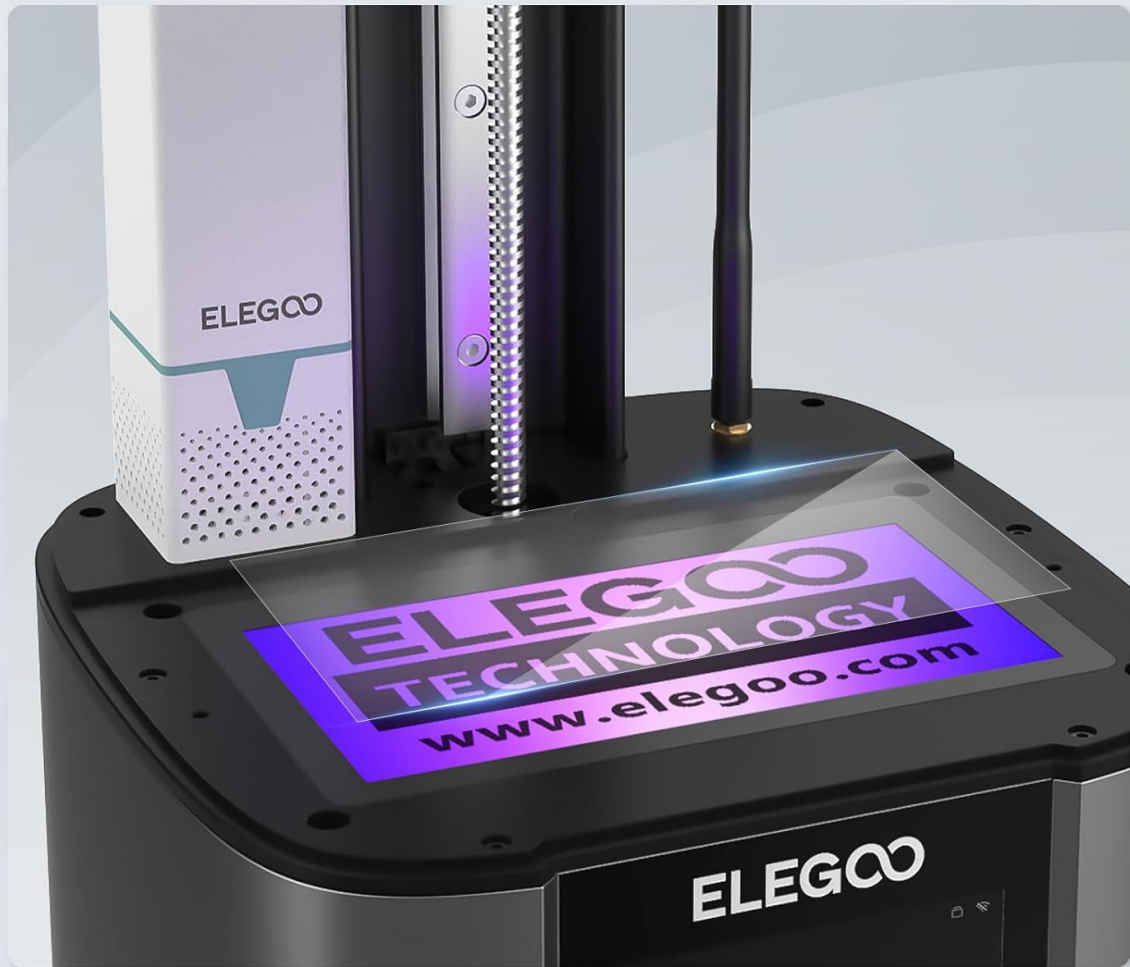
Image: The 7-inch mono LCD screen, protected by a 9H tempered glass film, crucial for high-resolution printing.