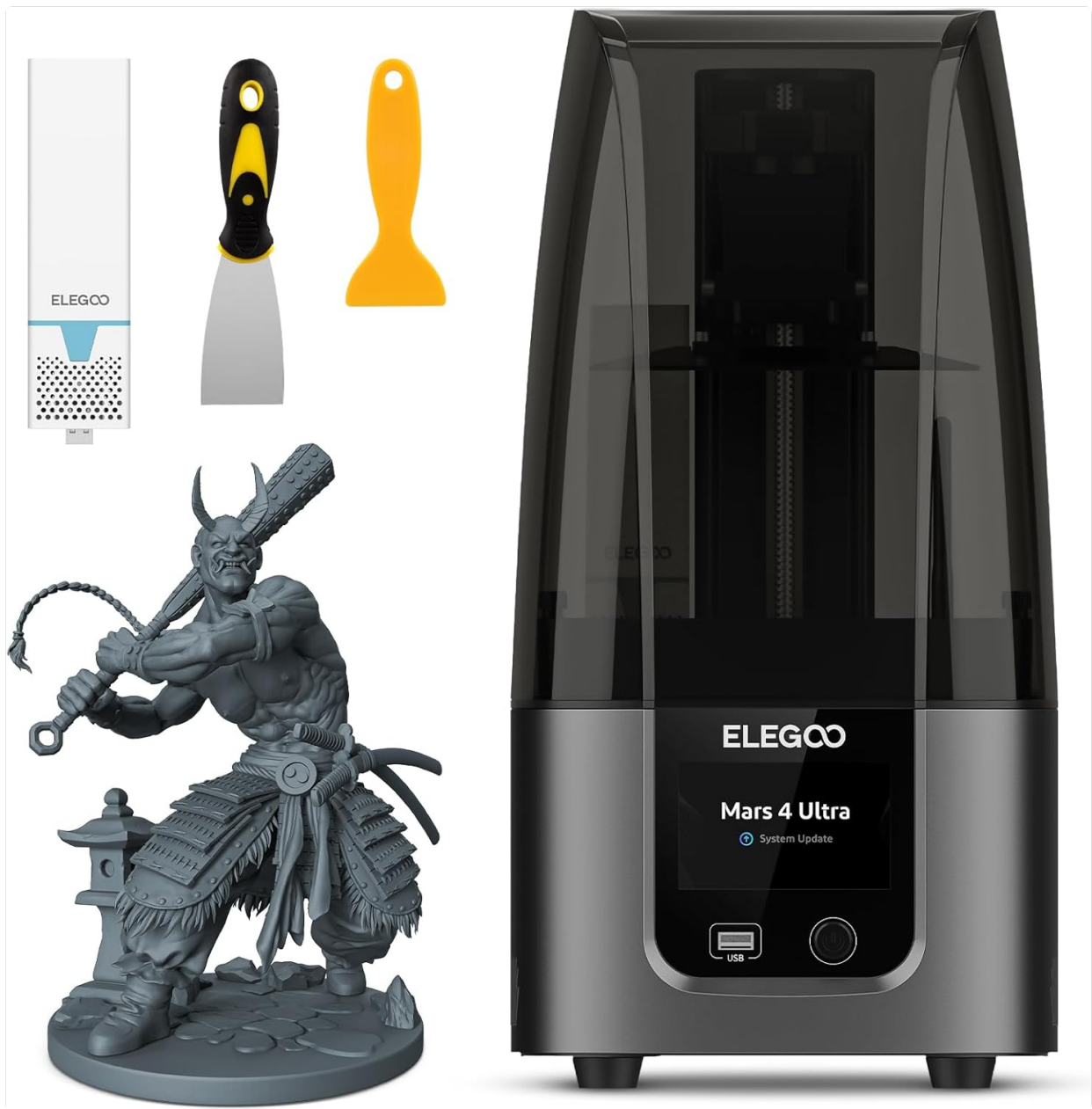
Image: ELEGOO Mars 4 Ultra 3D Printer with its accessories, including scrapers, USB air purifier, and a detailed printed model.