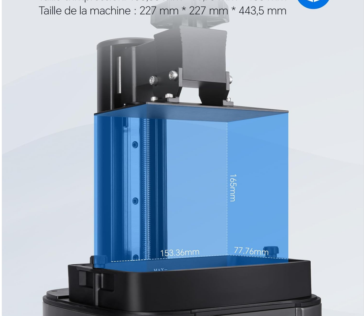
Image: Representation of the large build volume (153.36 x 77.76 x 165 mm 3 ) of the Mars 4 Ultra, allowing for printing multiple models simultaneously.