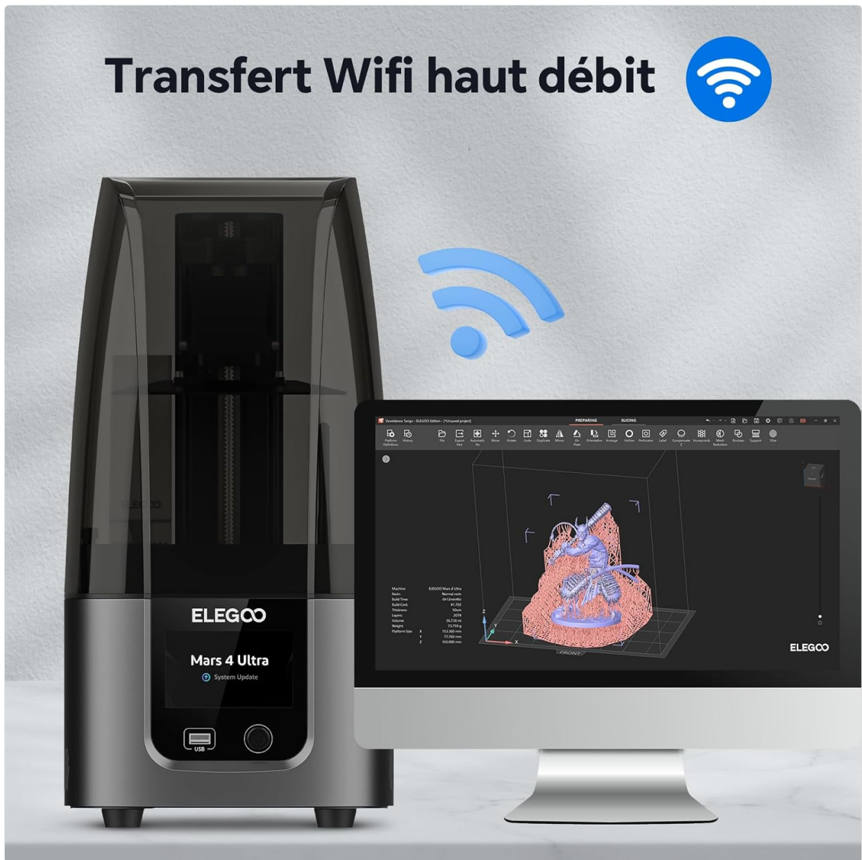
Image: The ELEGOO Mars 4 Ultra demonstrating high-speed WiFi transfer capabilities, allowing seamless file uploads from a computer.