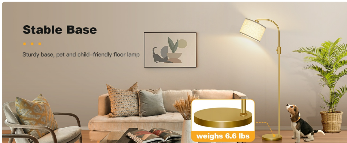
Figure 5: Stable base design.