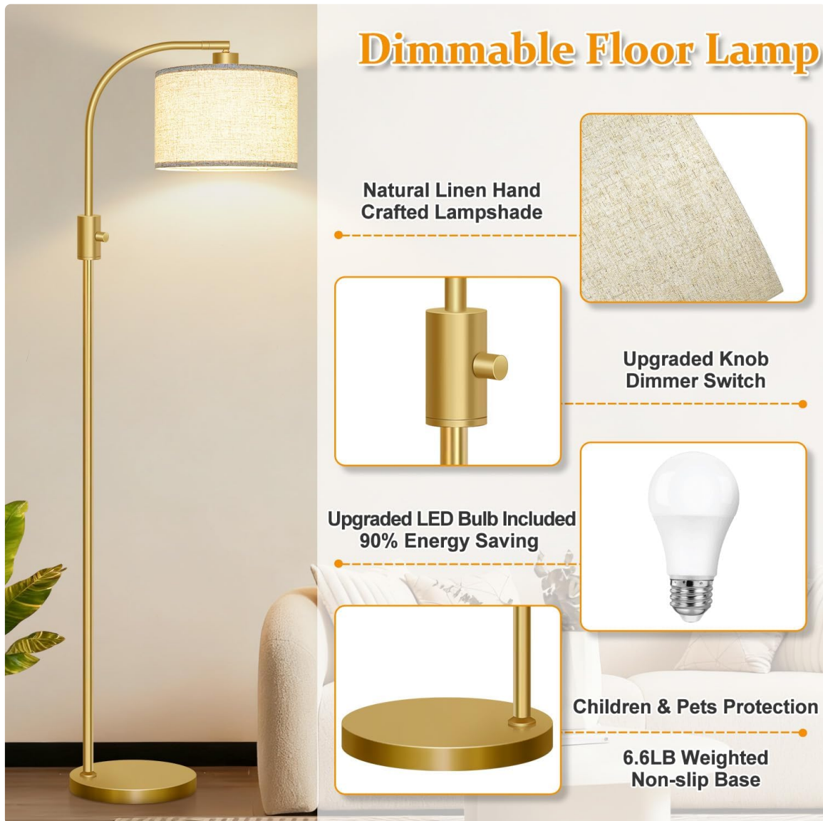
Figure 1: Lamp components before assembly.