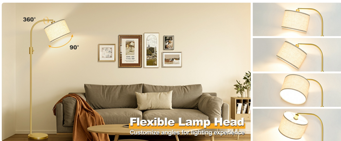
Figure 4: Lampshade rotation capabilities.

The lamp head is designed for flexibility, allowing for 360° horizontal rotation and 90° vertical rotation. Gently adjust the lampshade to direct light as needed for reading, working, or ambient lighting.