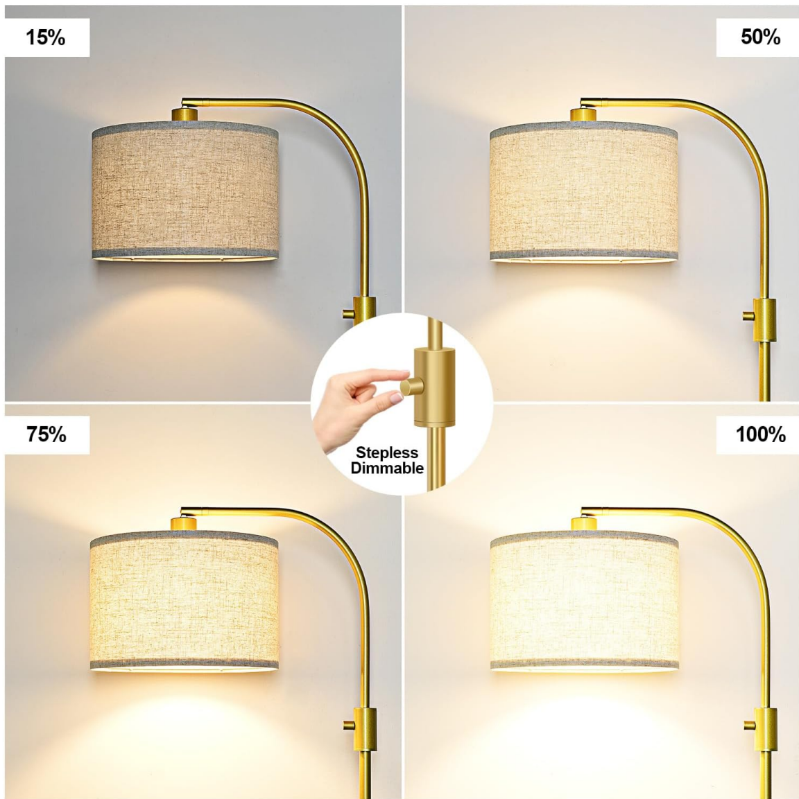
Figure 3: Rotary dimming switch operation.