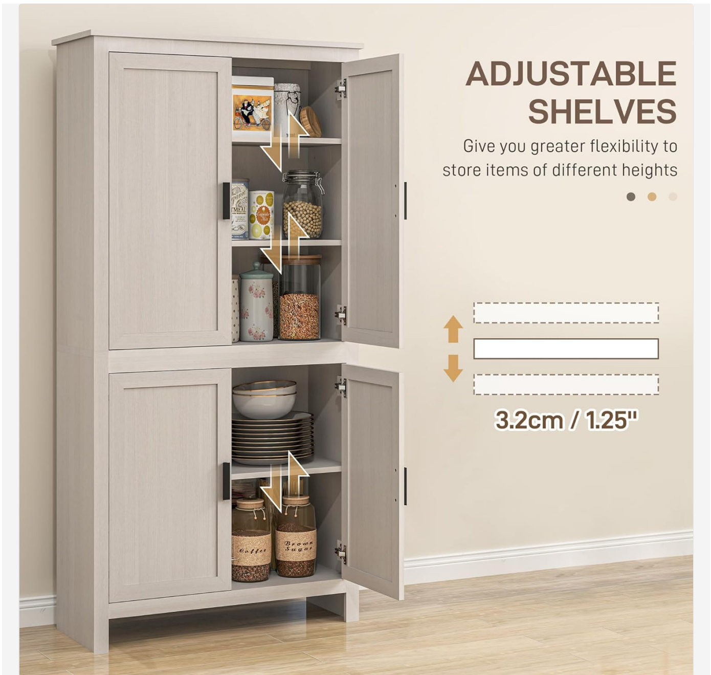
Figure 3.2: Illustration of the adjustable shelves, allowing for flexible storage configurations to fit items of varying heights.