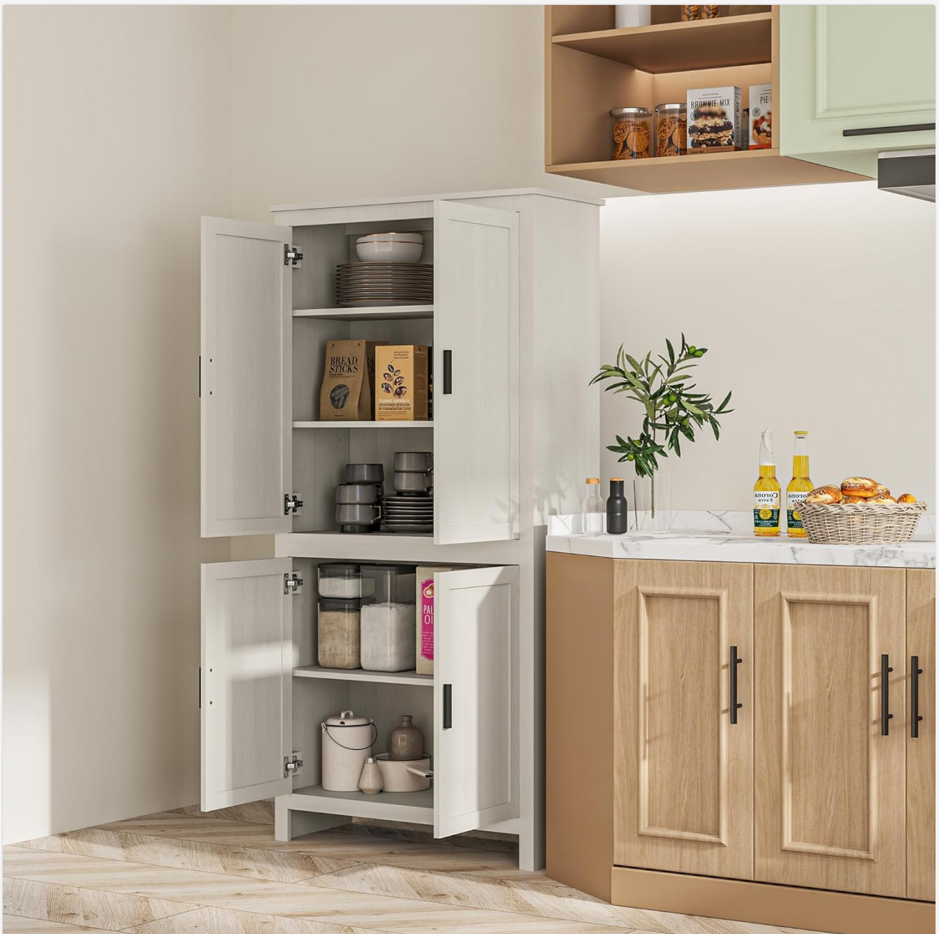
Figure 8.1: Guide to adjusting cabinet door hinges for optimal alignment.