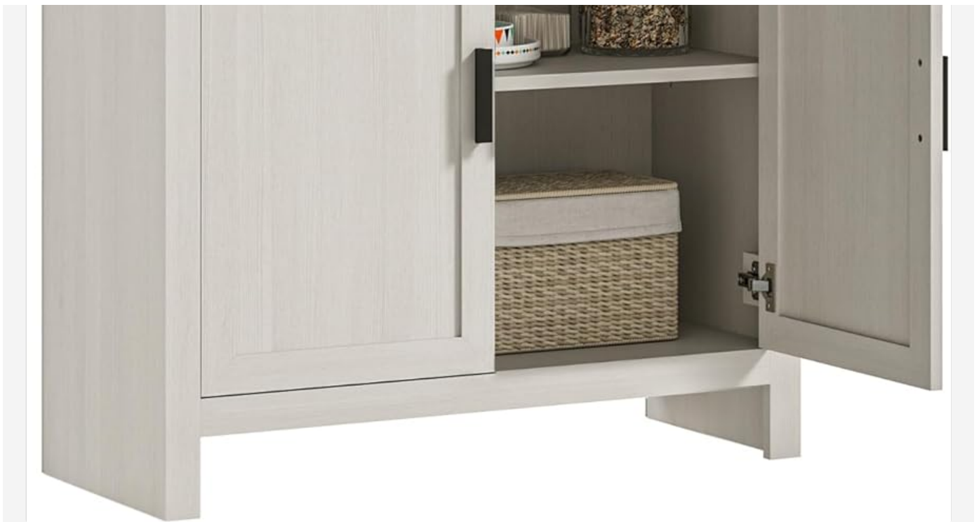
Figure 5.1: Fully assembled HOMCOM kitchen pantry cabinet.