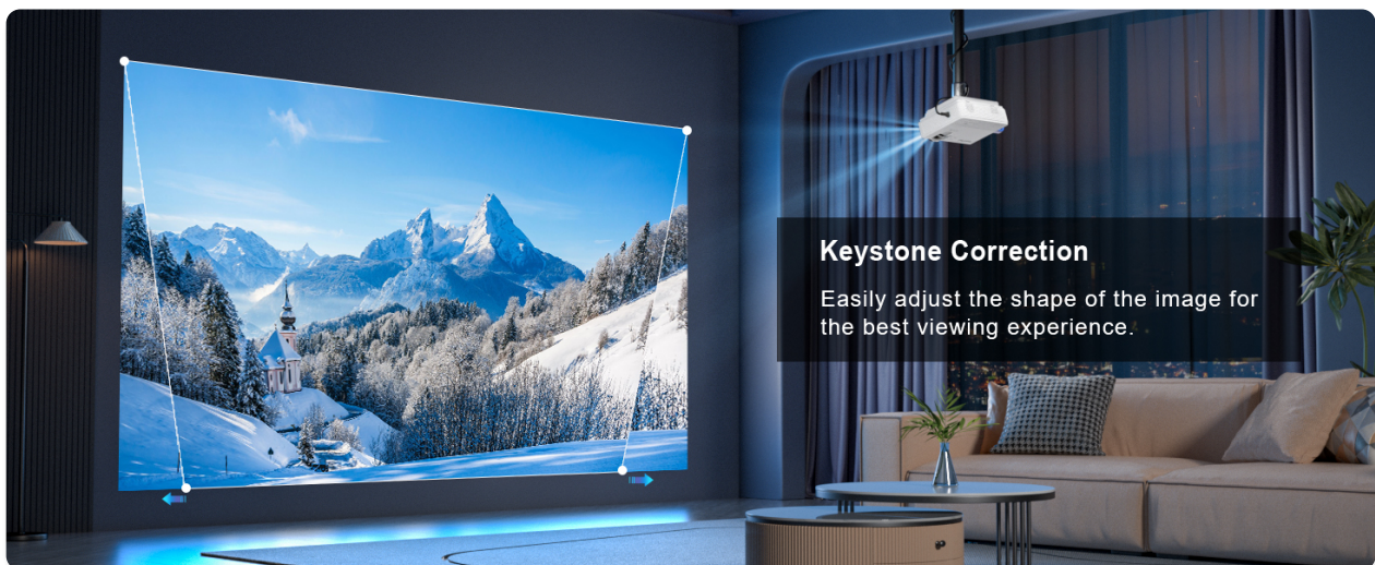
Image: A visual representation of the 6D/4P Digital Keystone Correction, illustrating 4-Point, Horizontal, Vertical, and Rotational adjustments.