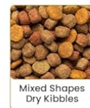
Mixed Shapes Dry Kibbles