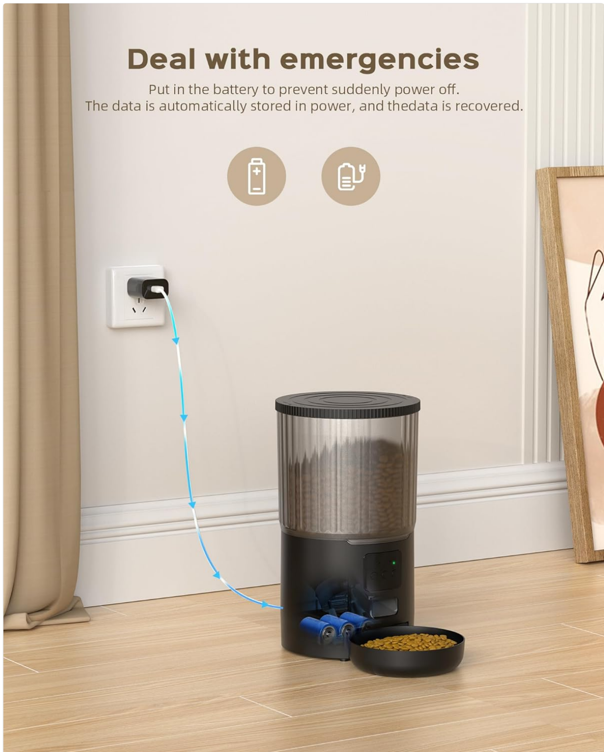
Figure 3.1: Power connection and battery backup. This image illustrates how to connect the AC adapter and install batteries for emergency power.