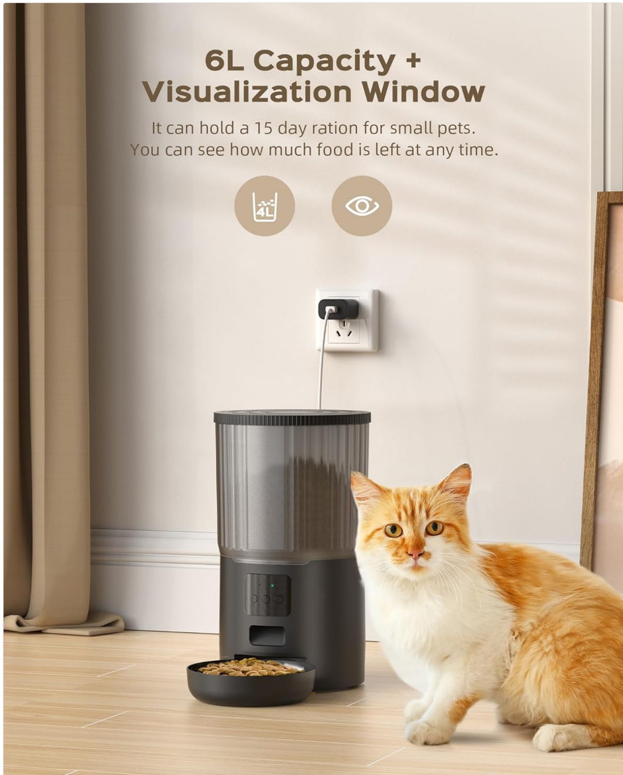
Figure 4.1: 6L capacity and visualization window. This image highlights the feeder's large capacity and the transparent window for monitoring food levels.