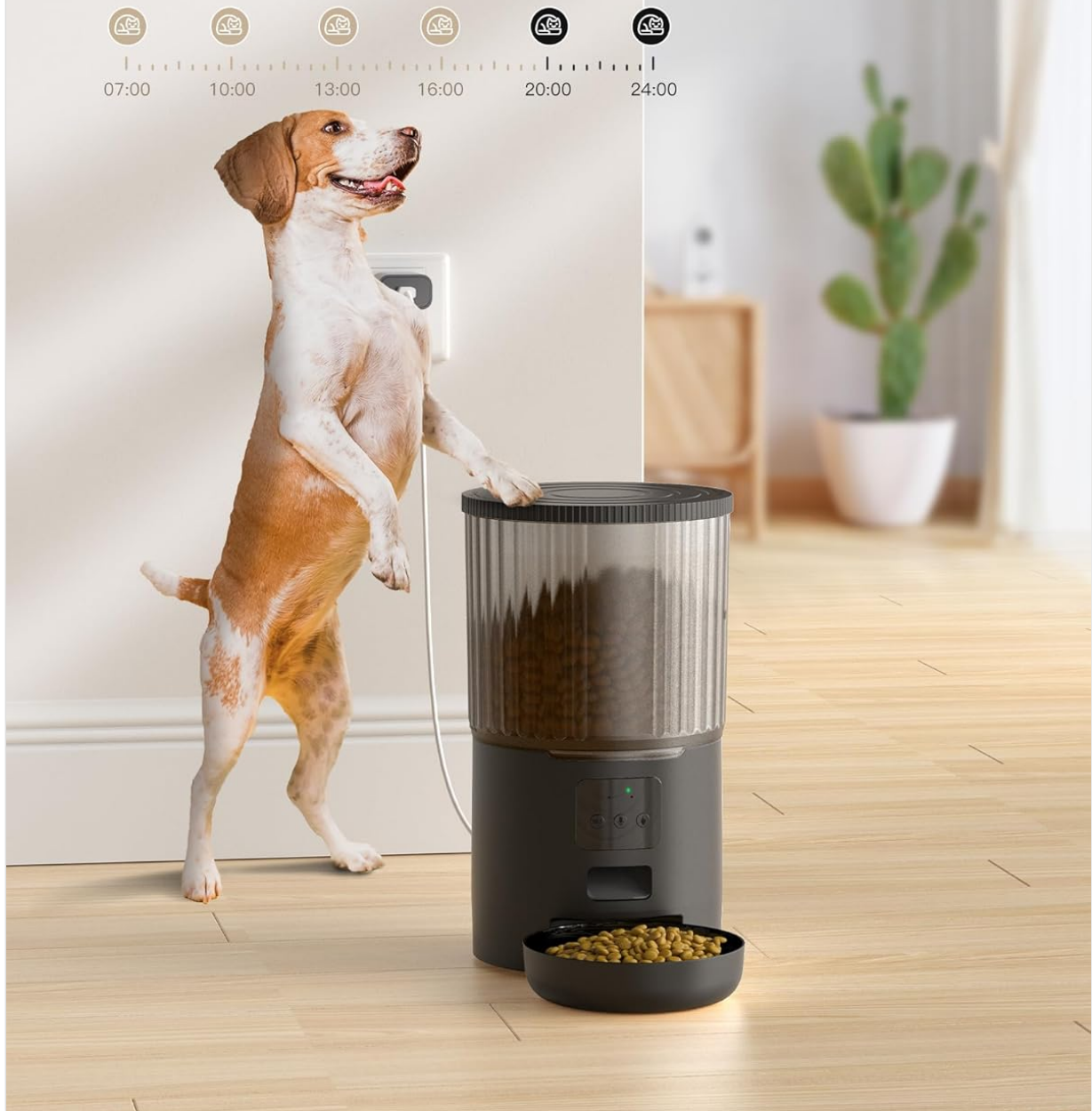
Figure 2.1: UIOOQ P1-6L Automatic Pet Feeder. This image shows the feeder's overall design and highlights the concept of regular feeding schedules.

Making your pet diet more regular and healthier.