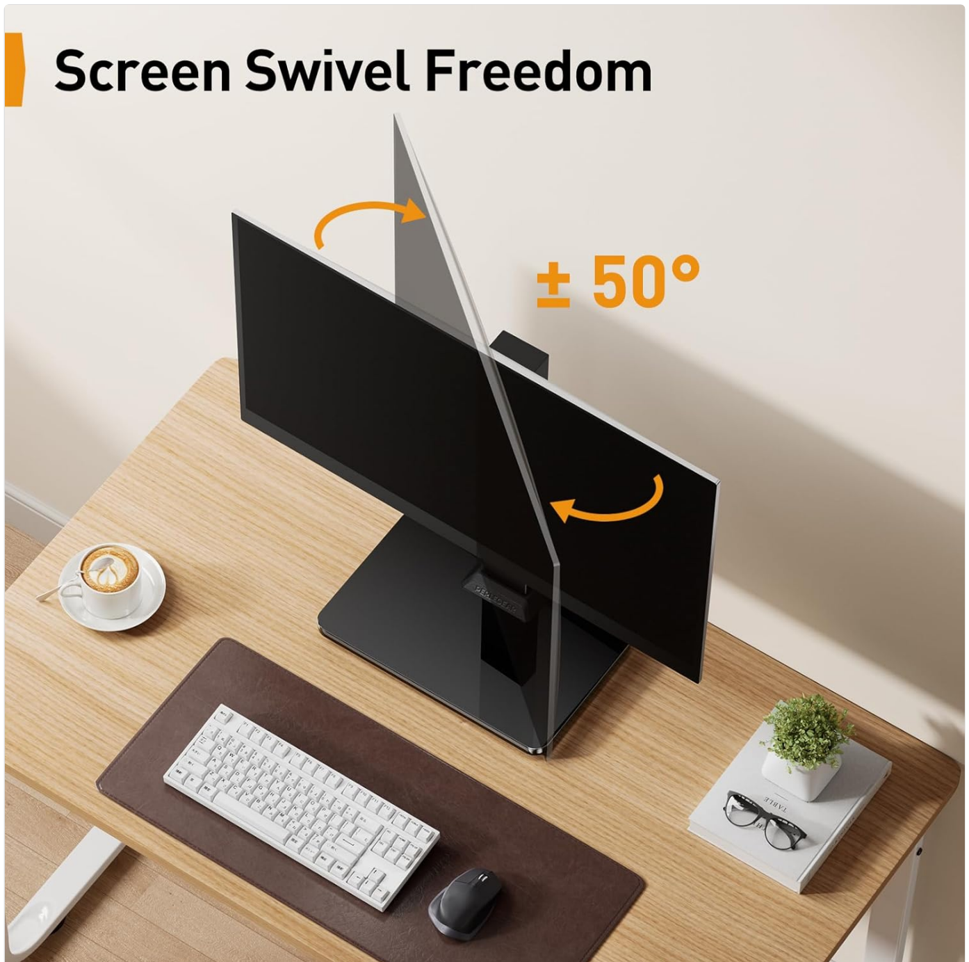
Image: Illustrates the screen swivel freedom of \pm 50 degrees for the monitor stand.

The screen can be swiveled manually \pm 50^\circ for ultimate viewing flexibility. Only swivel the screen by the screen edges; do not press on the screen itself.