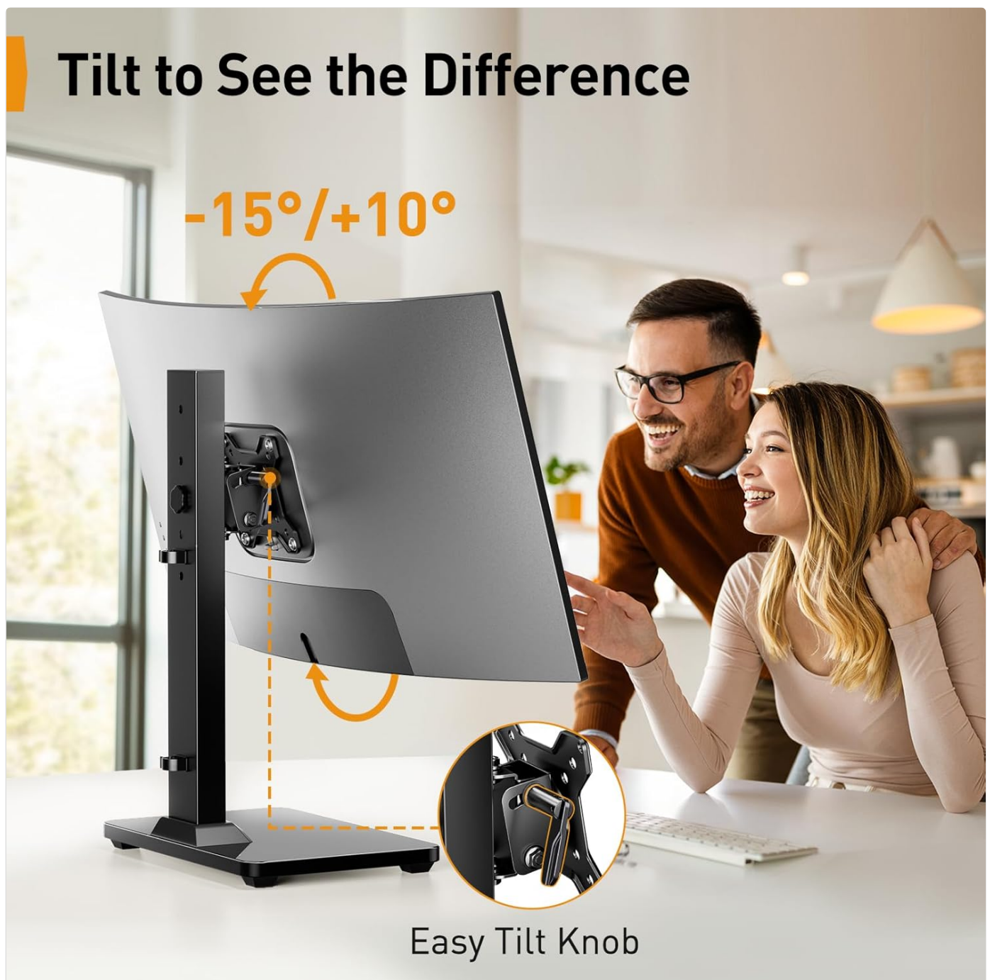
Image: Demonstrates the tilt adjustment feature of the monitor stand, allowing movement from -15 degrees to +10 degrees using a tilt

Adjust the screen tilt from -15^{\circ} to +10^{\circ} using the convenient tilt knob located on the VESA plate. Loosen the knob, adjust the screen to your preferred angle, and then tighten the knob to lock it in place.