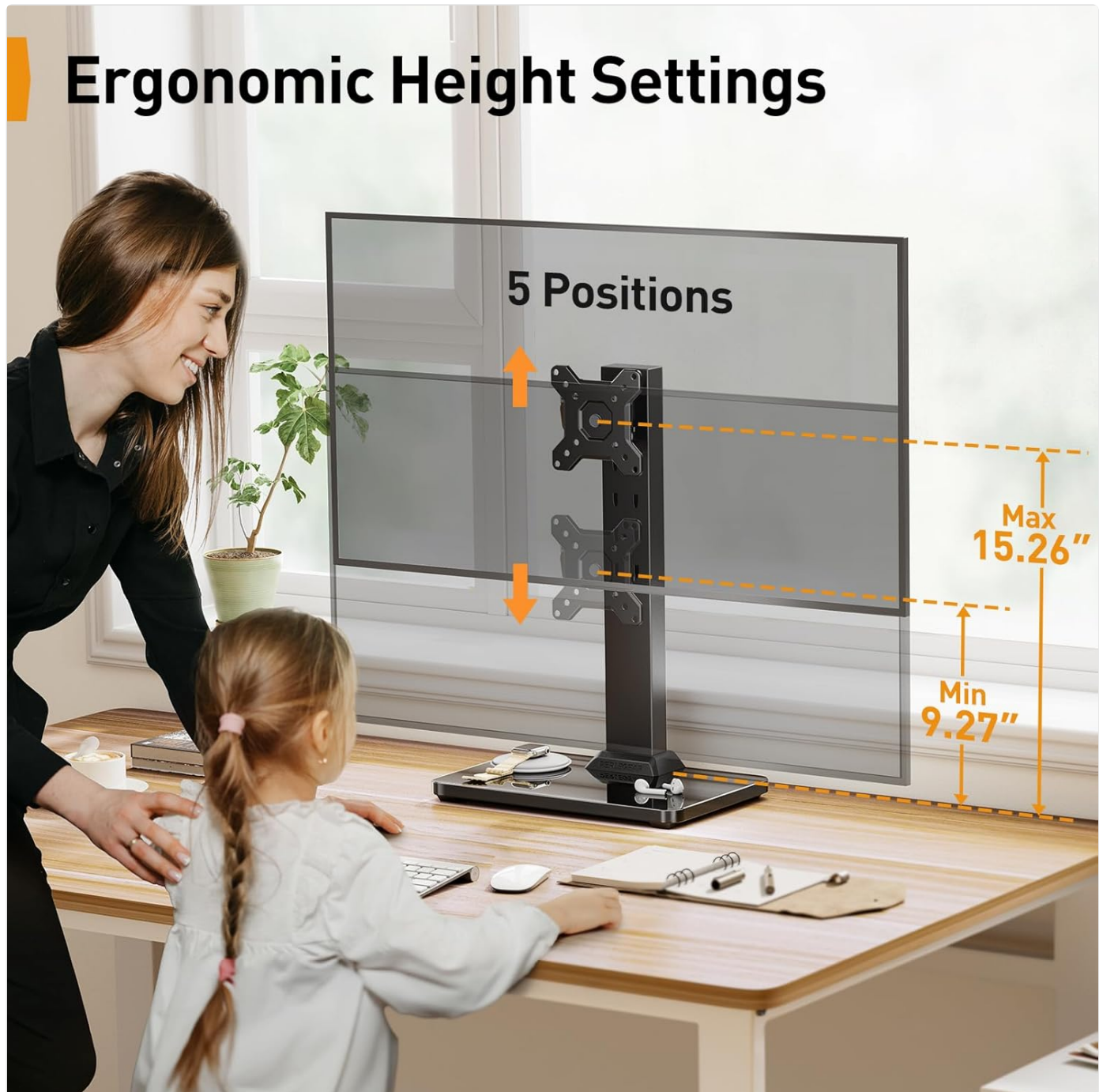
Image: Illustration of the 5 ergonomic height settings for the monitor stand, ranging from a minimum of 9.27 inches to a maximum of 15.26 inches.

Carefully lift your monitor (with the VESA plate attached) and slide it onto the support pillar. Secure the monitor to the support pillar using the knob on the VESA plate. Ensure it clicks into place securely.