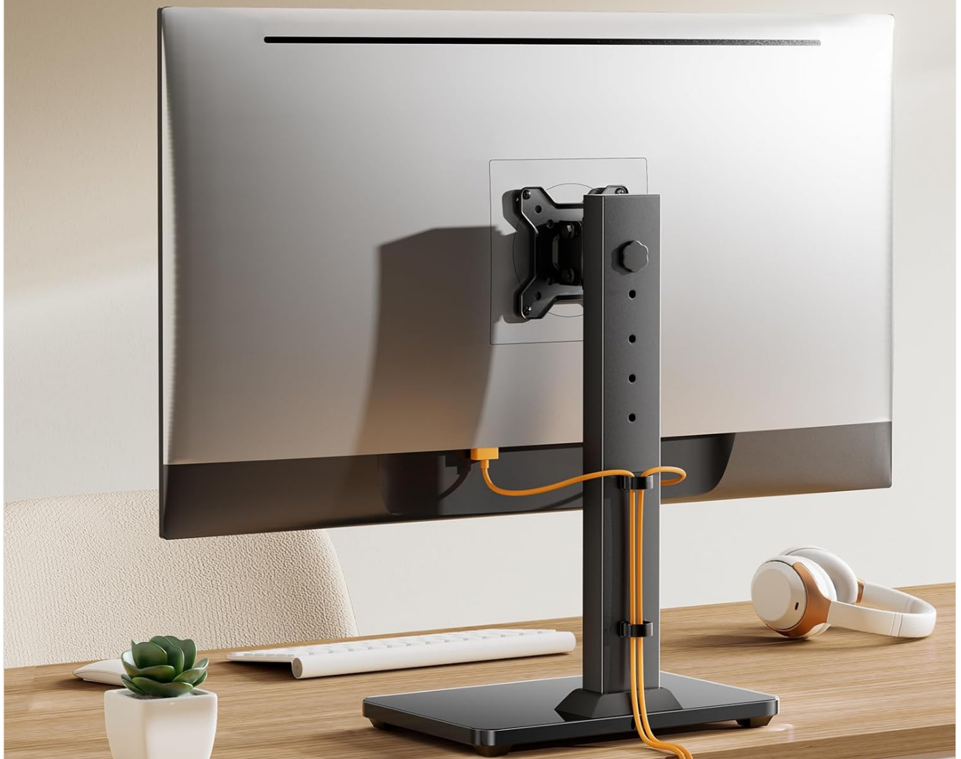
Image: Displays the cable management feature of the monitor stand, showing two cable clips used to route cables along the back of the pillar.