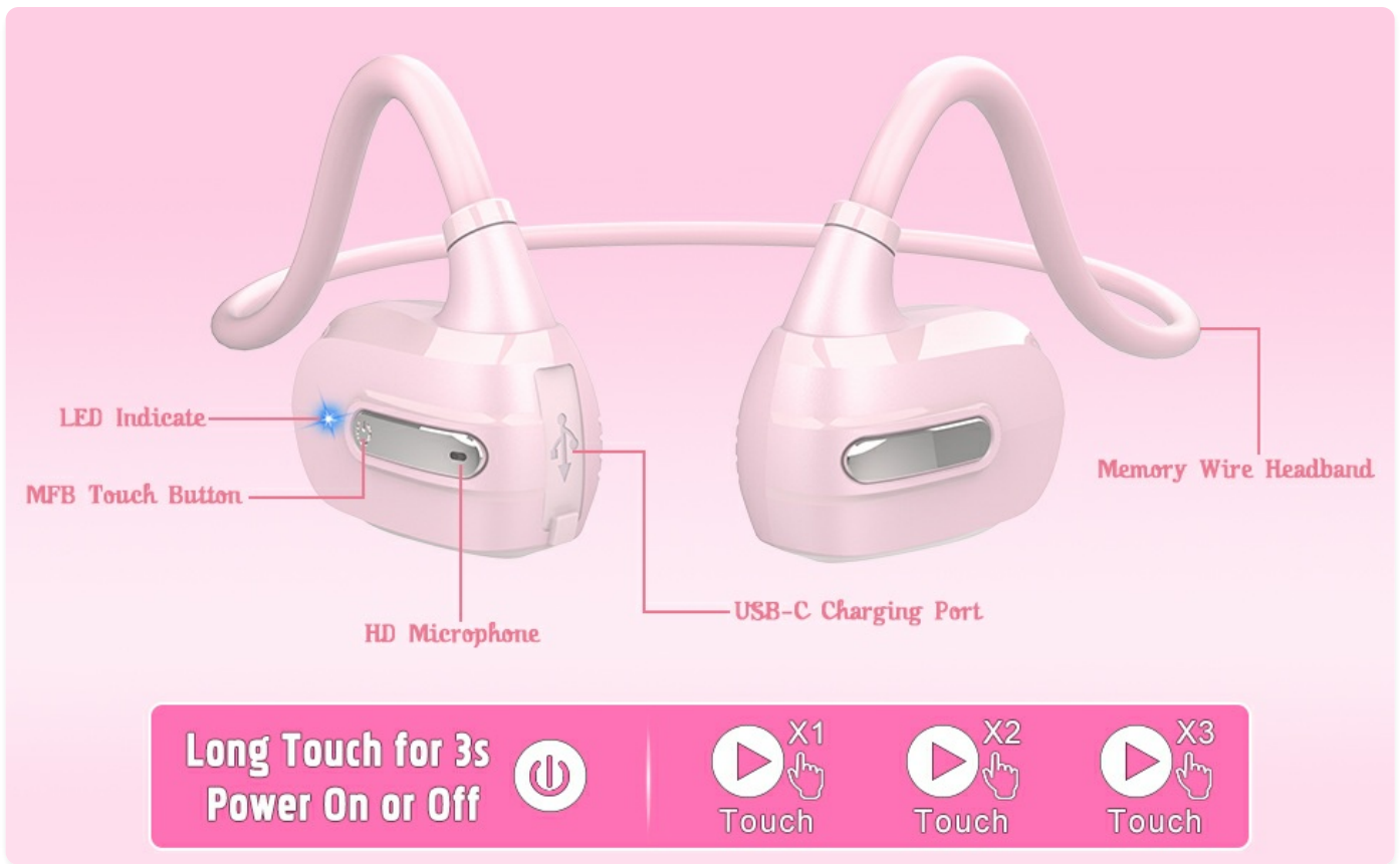
Figure 3: Headphone Components and Controls