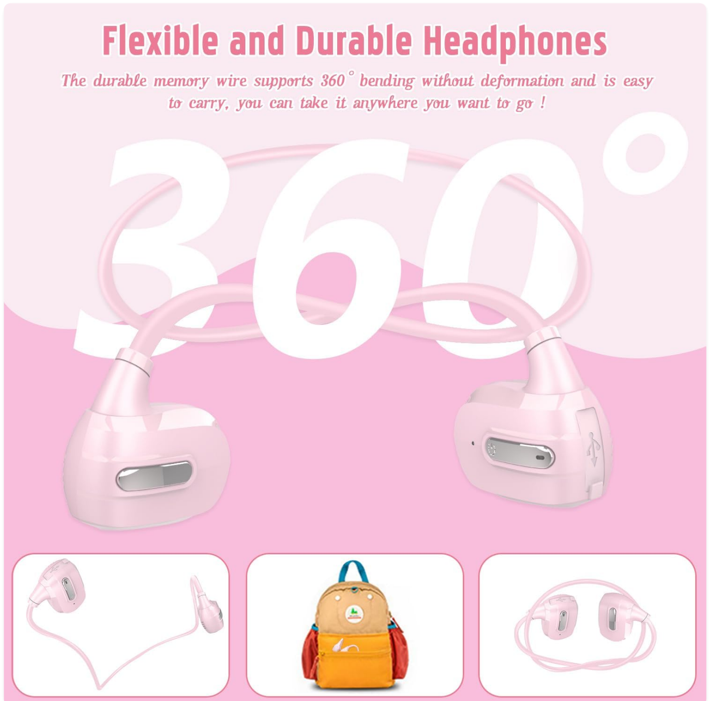
Figure 8: Flexible and Durable Design for Storage

When not in use, store the headphones in a cool, dry place away from direct sunlight and extreme temperatures. The flexible design allows for easy folding for compact storage.