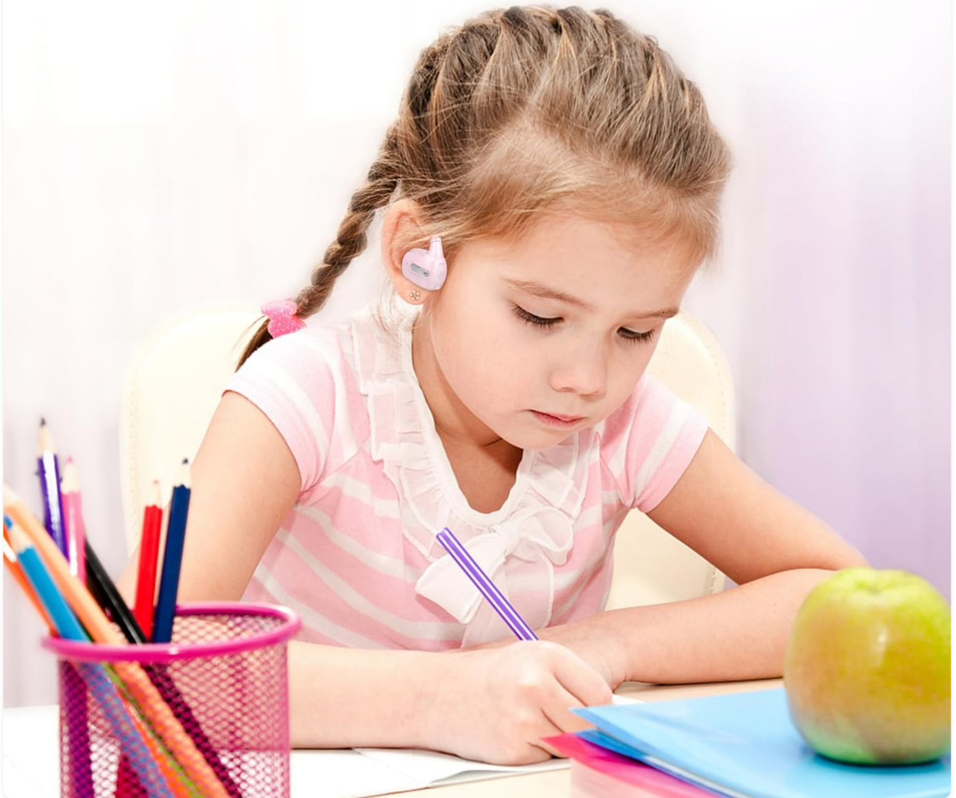
Figure 6: Comfortable Wearing

Only 13g weight , it will not compress child's ears and is lightweight and comfortable to wear all day.