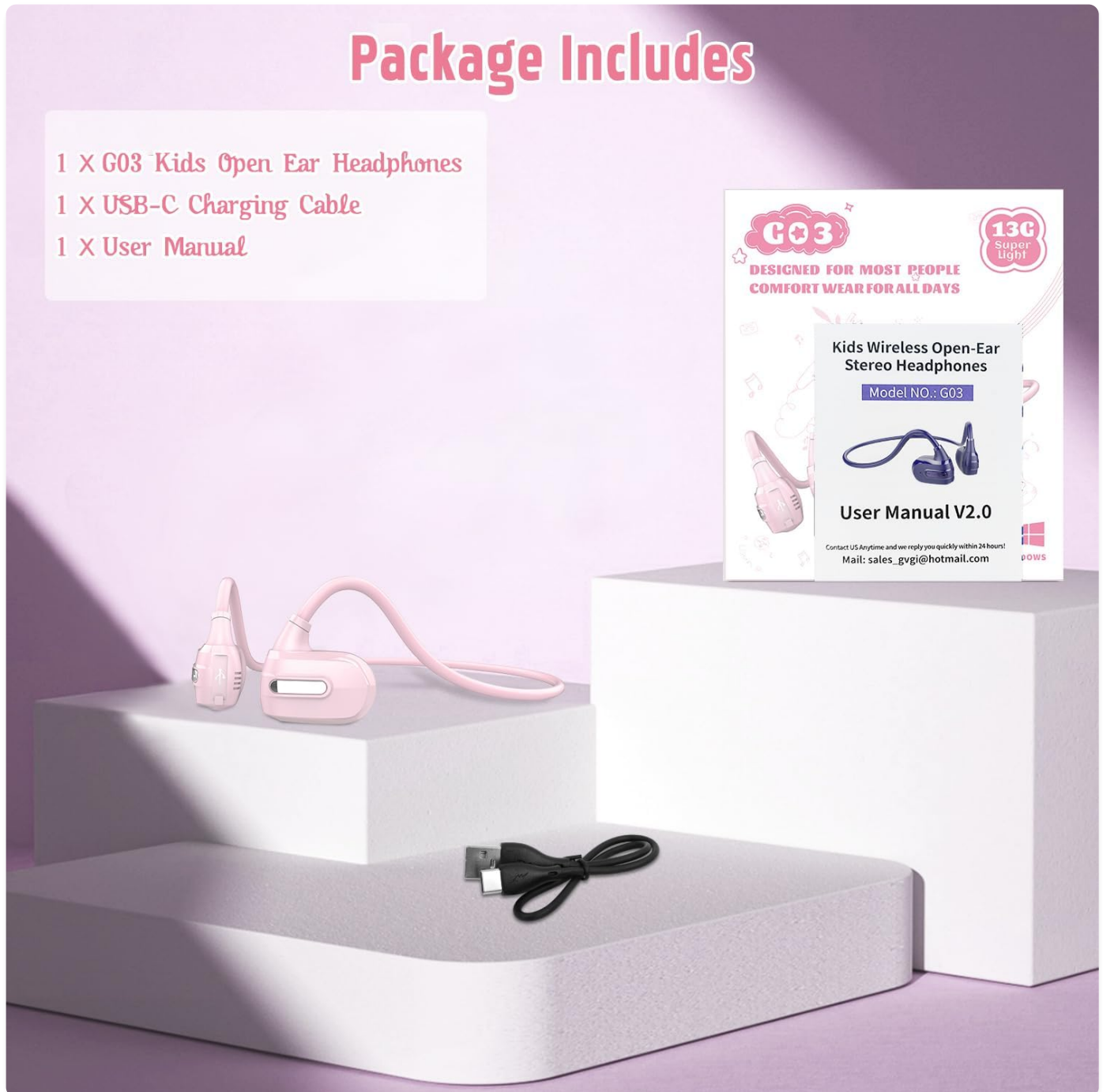
Figure 2: Package Contents