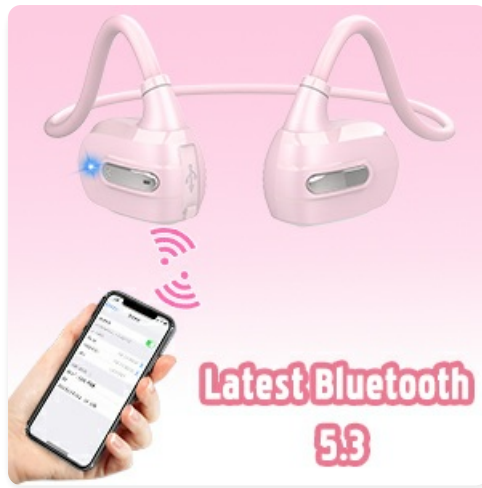
Figure 5: Bluetooth 5.3 Connection