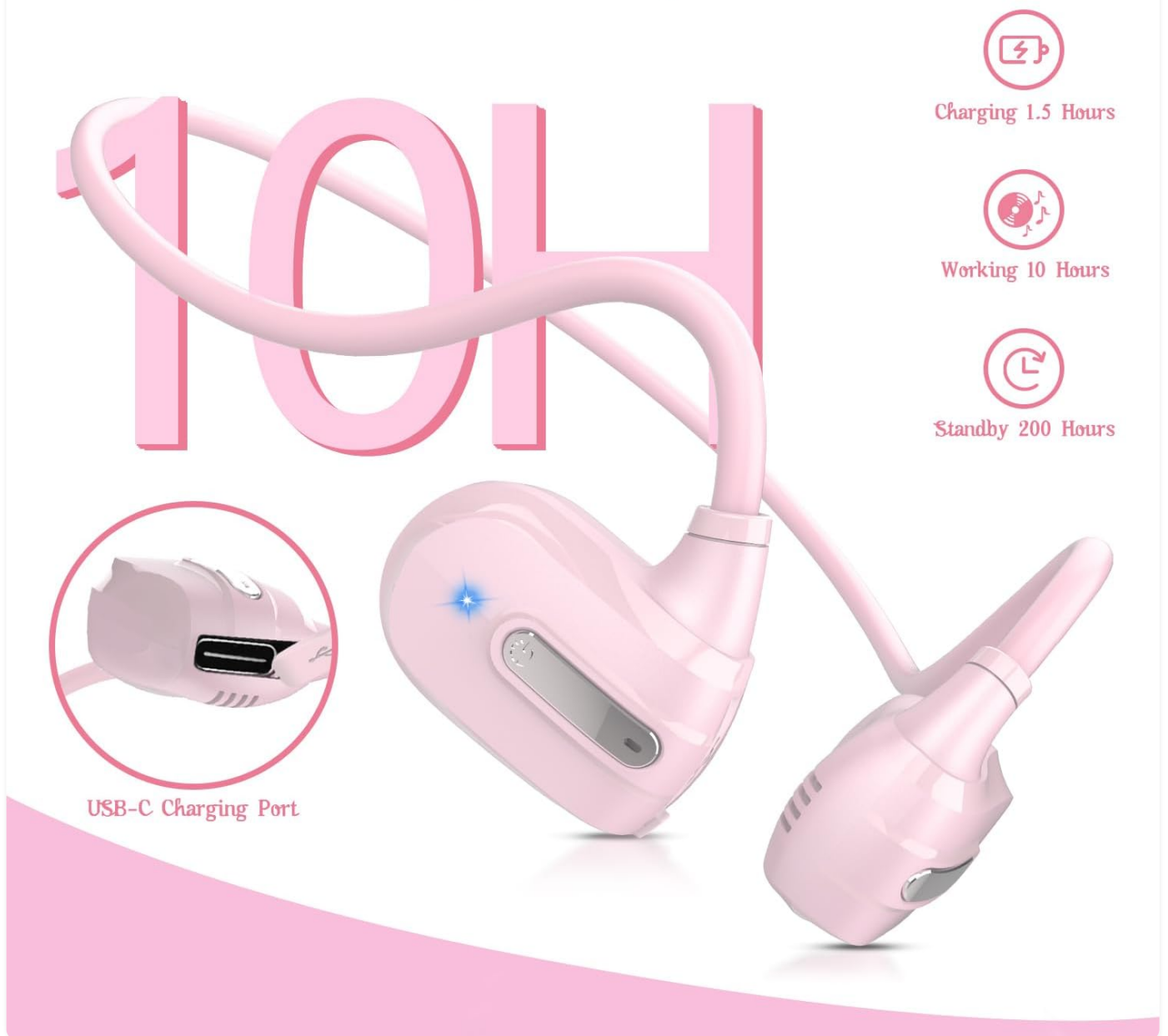
Figure 4: Charging and Battery Life