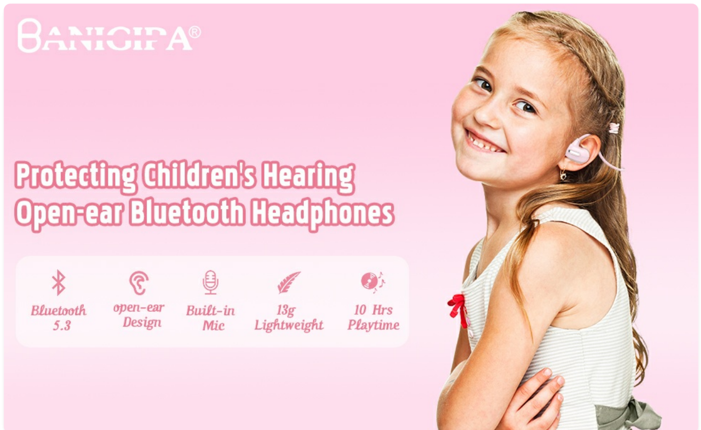
Figure 1: Key Features Overview

Thank you for choosing the BANIGIPA Kids Open Ear Headphones. These headphones are designed with an open-ear concept and air conduction technology to provide a safe and comfortable listening experience for children and teens. They prioritize hearing protection and situational awareness, making them ideal for various activities from studying to outdoor play.