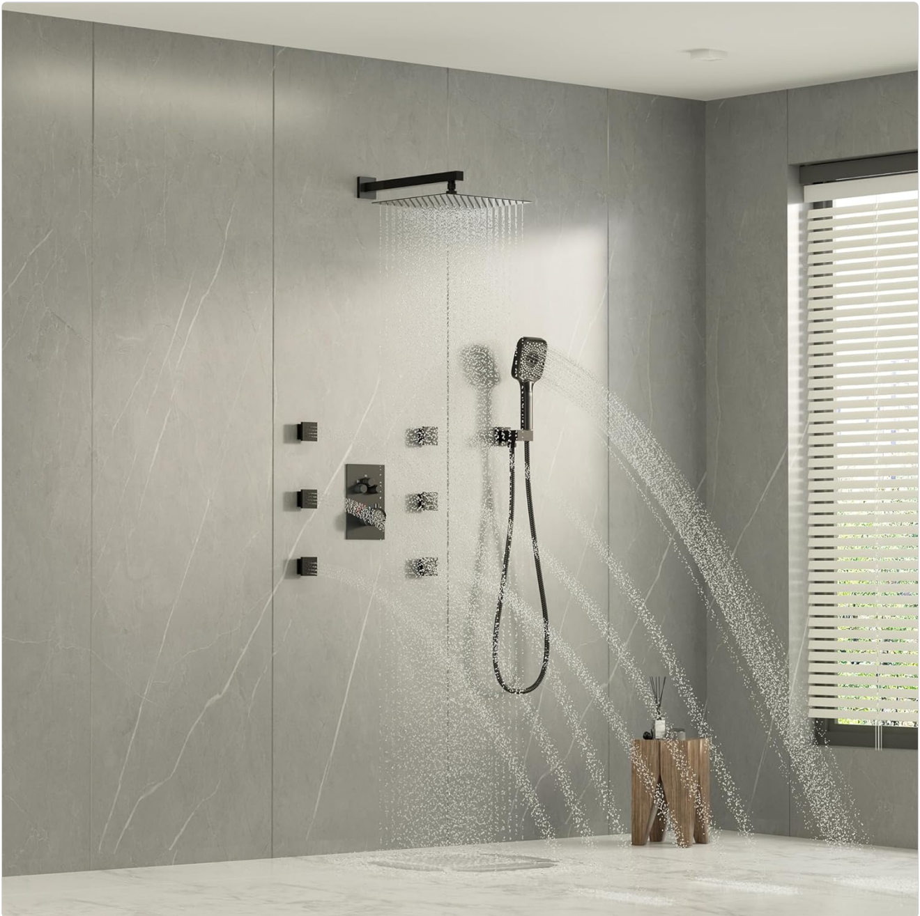
Image: A full view of the CASAINC Thermostatic Shower System with the rain shower, handheld spray, and body jets actively dispensing water in a modern bathroom setting.

Your CASAINC Thermostatic Shower System is designed for intuitive control and a personalized showering experience.