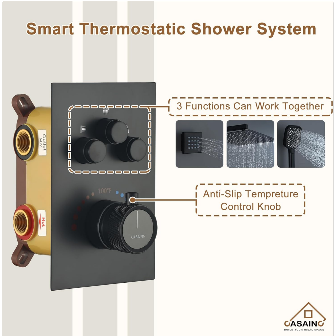
Image: Diagram illustrating the thermostatic valve body with hot and cold water inlets, outlet mix, and the anti-slip temperature control knob set at 100°F.