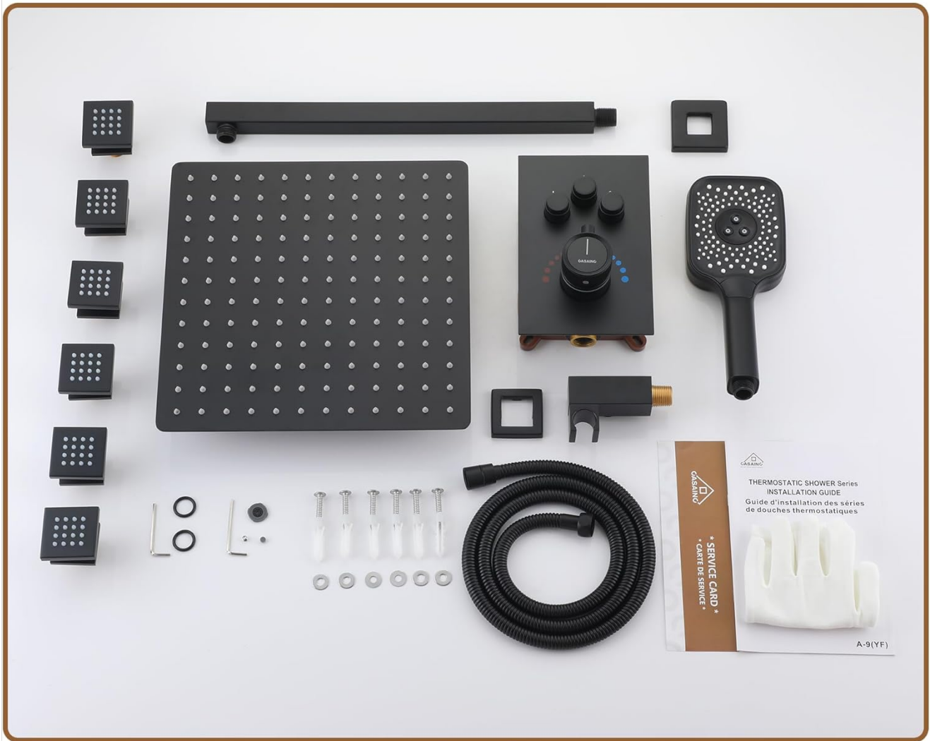
Image: All components included in the CASAINC Thermostatic Shower System package.