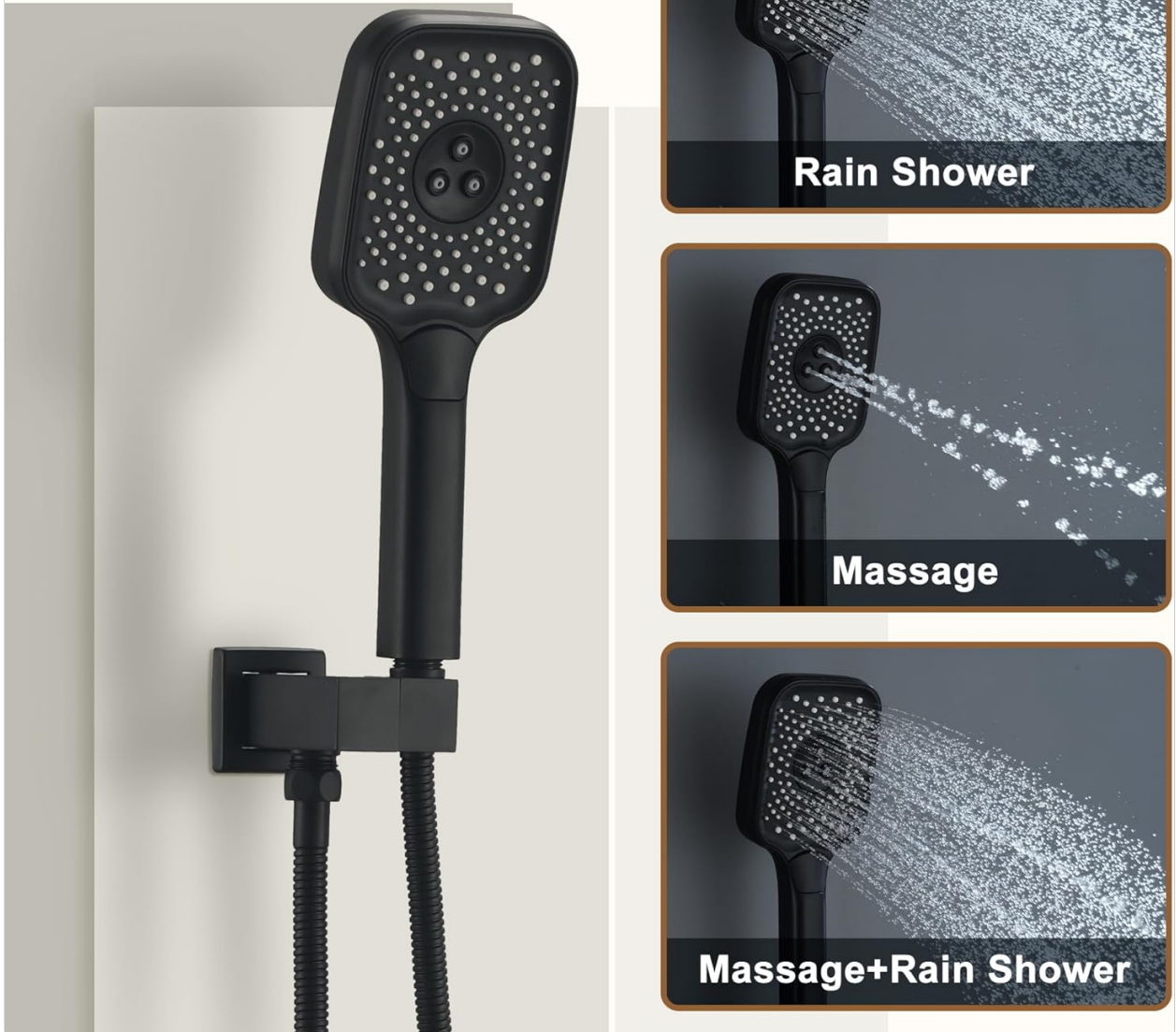
Image: Close-up of the handheld showerhead demonstrating its three spray functions: Rain Shower, Massage, and a combination of Massage and Rain Shower.