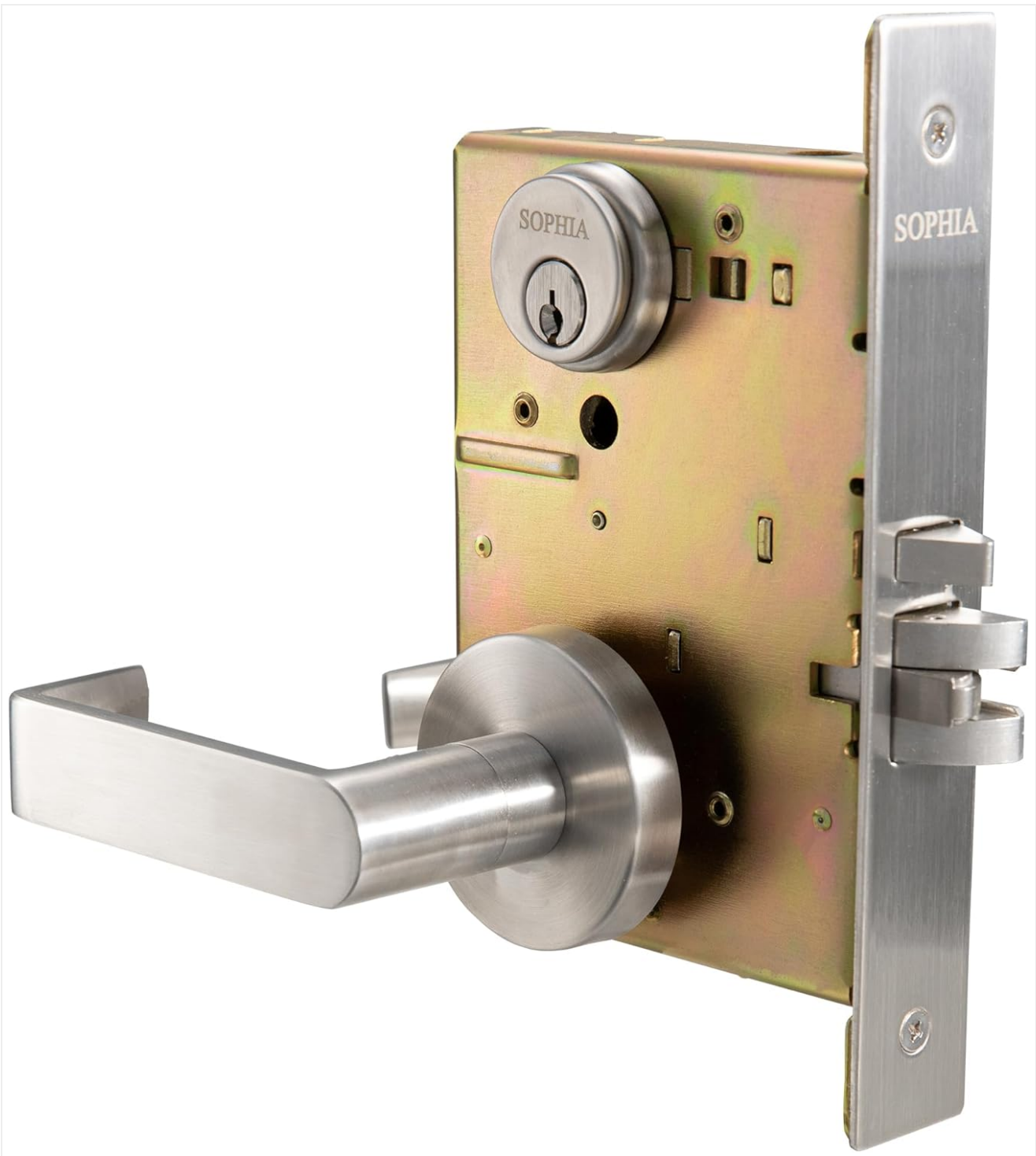
Figure 1: SOPHIA Commercial Heavy Duty Mortise Lockset (Rose/Classroom Function)