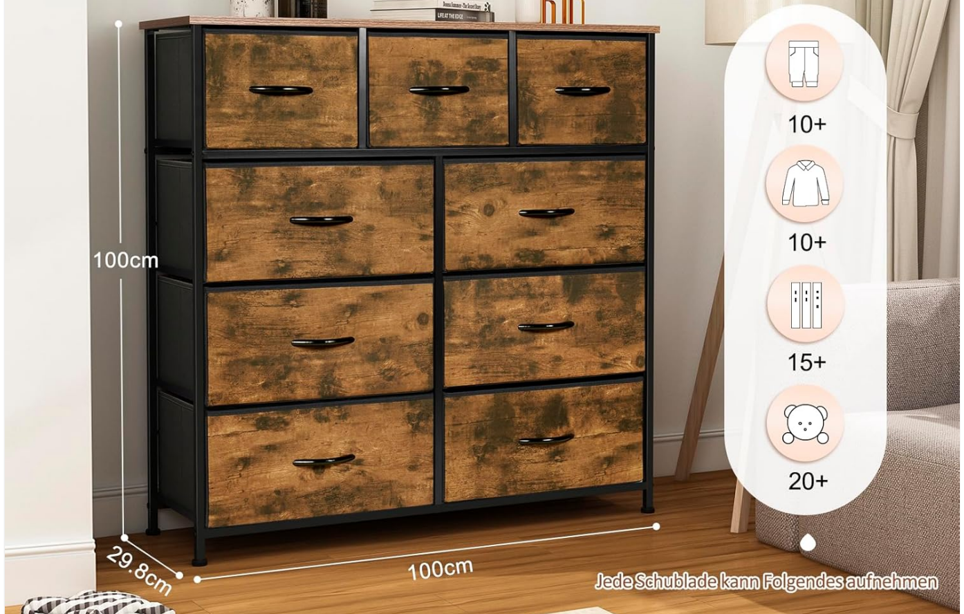
Image: Diagram illustrating the overall dimensions of the dresser: 100 cm (width) x 29.8 cm (depth) x 100 cm (height).