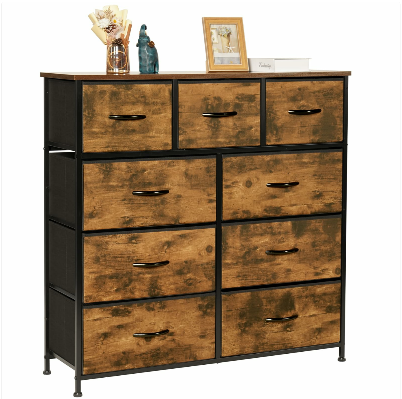
Image: The LYNCOHOME 9-Drawer Fabric Dresser in vintage brown, showcasing its design and storage capacity.