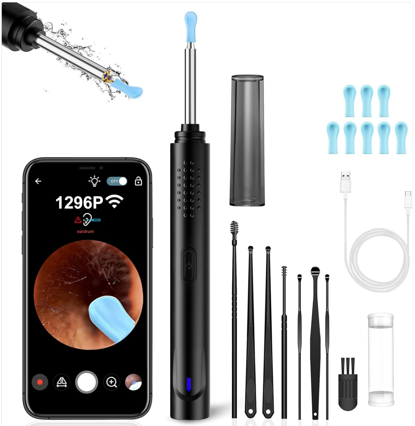
Image: All components of the vasdaren Ear Wax Removal Kit, including the camera device, silicone ear scoops, traditional tools, charging cable, and storage bottle.