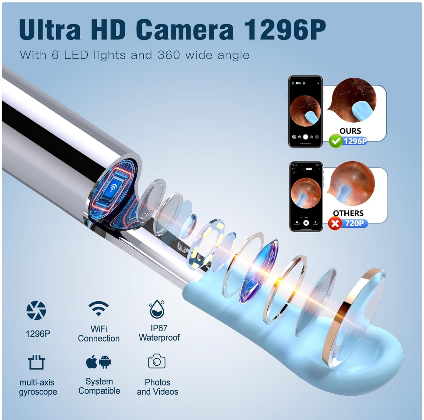
Image: Detailed view of the 1296P HD camera lens and integrated LED lights on the device tip.