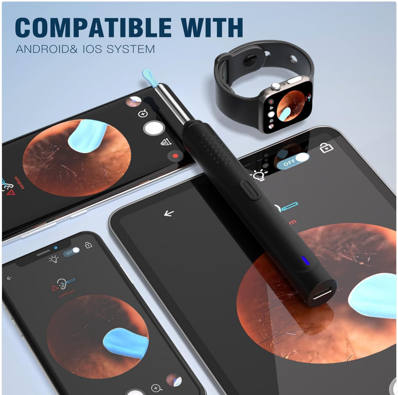
Image: A smartphone screen showing the live feed from the ear camera, demonstrating the Wi-Fi connection and app interface.

5. Launch the App: Open the "EndscopeTool" app. The device should automatically connect, and you will see a live view from the camera.