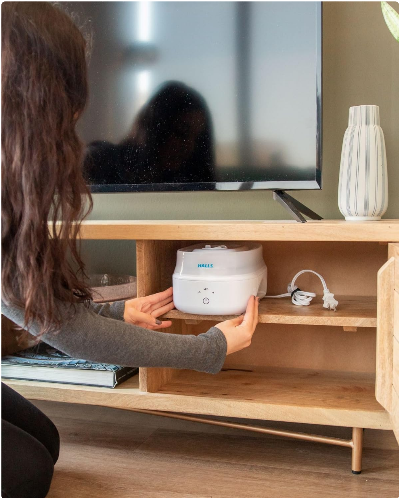
Figure 5: The compact size of the humidifier allows for convenient storage in small spaces.