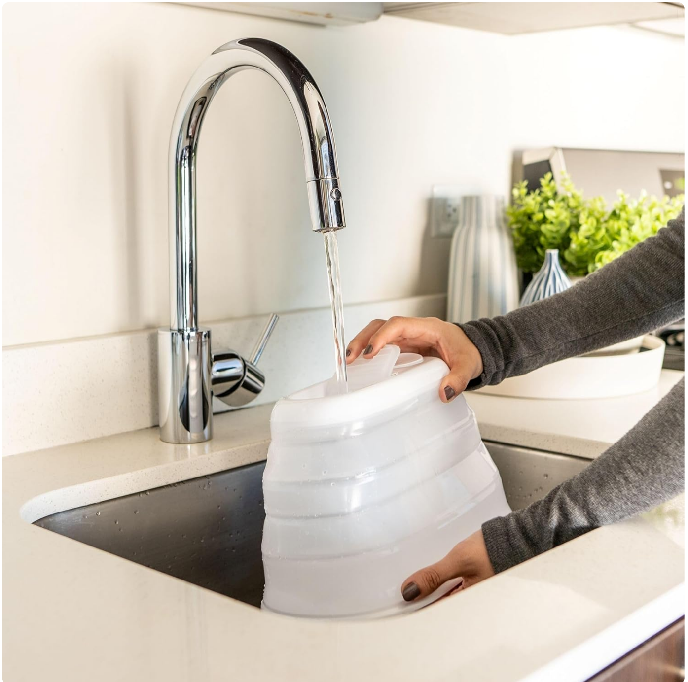
Figure 2: Demonstrating the easy top-fill design of the humidifier tank.