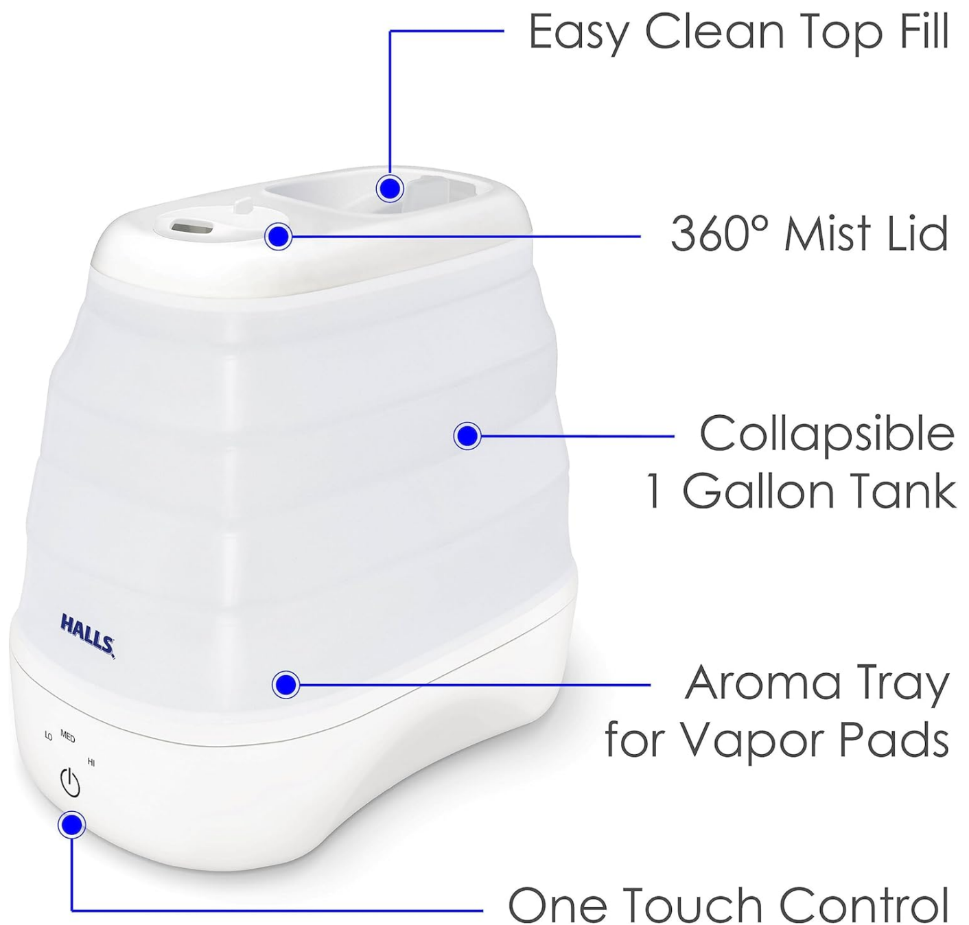
Figure 3: The intuitive one-touch control panel for power and mist intensity.