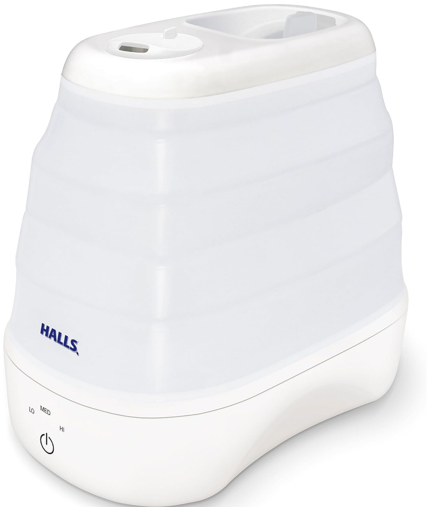
Figure 1: Crane x HALLS Humidifier in its fully expanded state, ready for use.