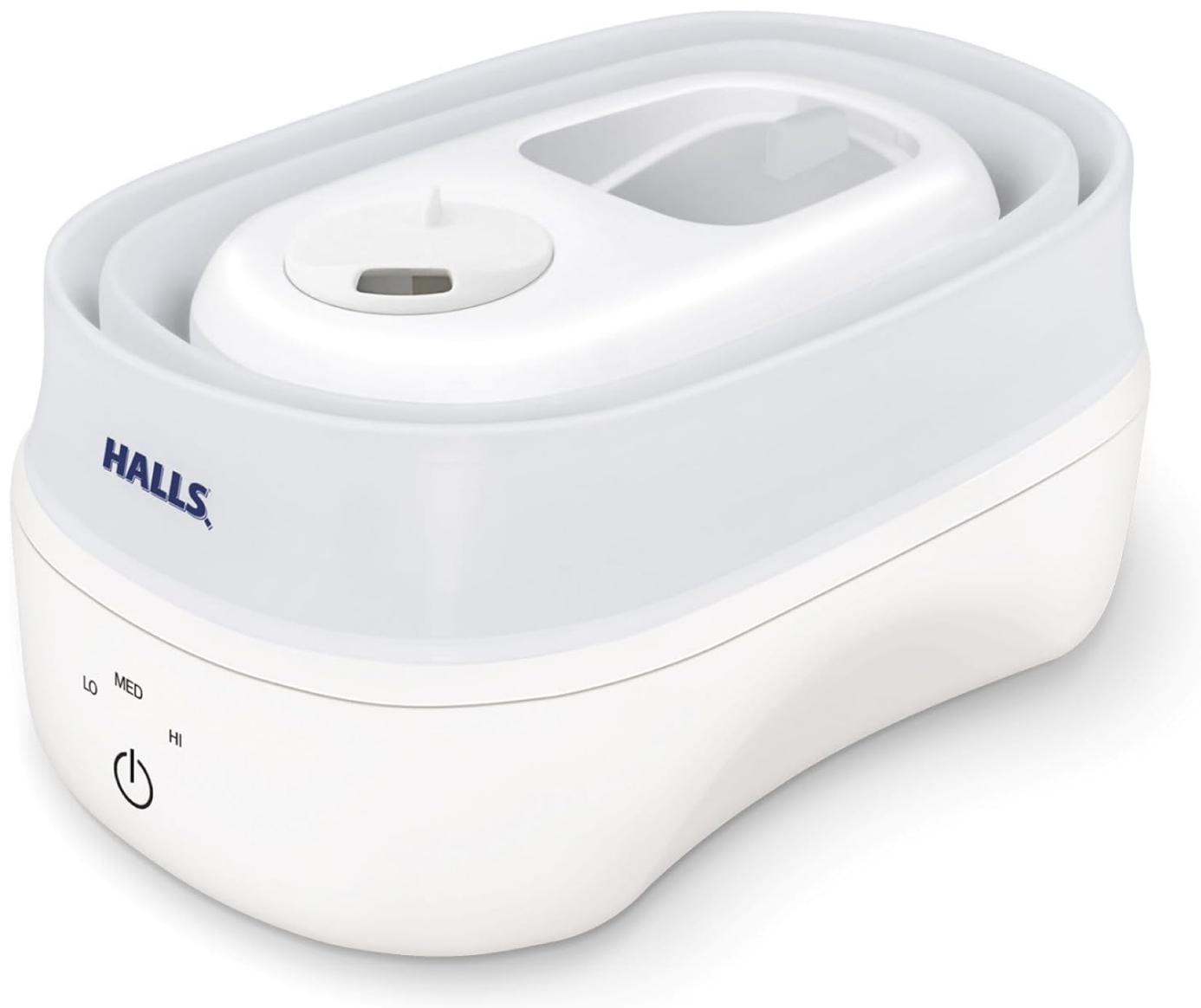
Figure 4: The humidifier in its collapsed state, demonstrating its compact form for easy storage or travel.