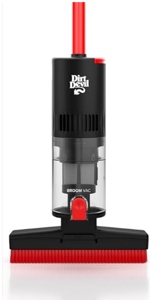
Image: The Dirt Devil Broom Vac Cordless Hard Floor Cleaner, showing the main unit with its red handle and black body, and the red and black floor head.