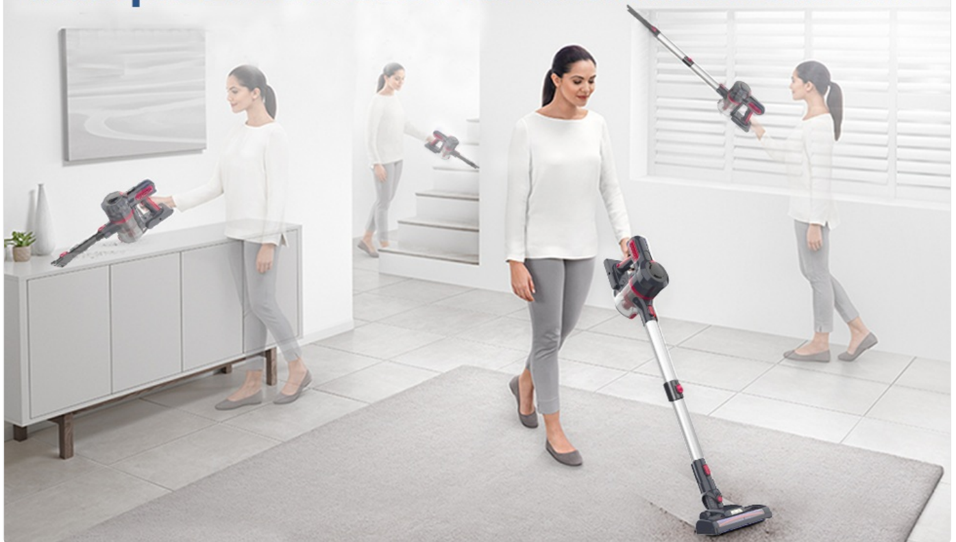
Image 4.1: The vacuum cleaner's adaptable design for various cleaning needs.

Key components include a powerful motorized brush, a multi-layer filtration system, and integrated LED headlights for improved visibility.