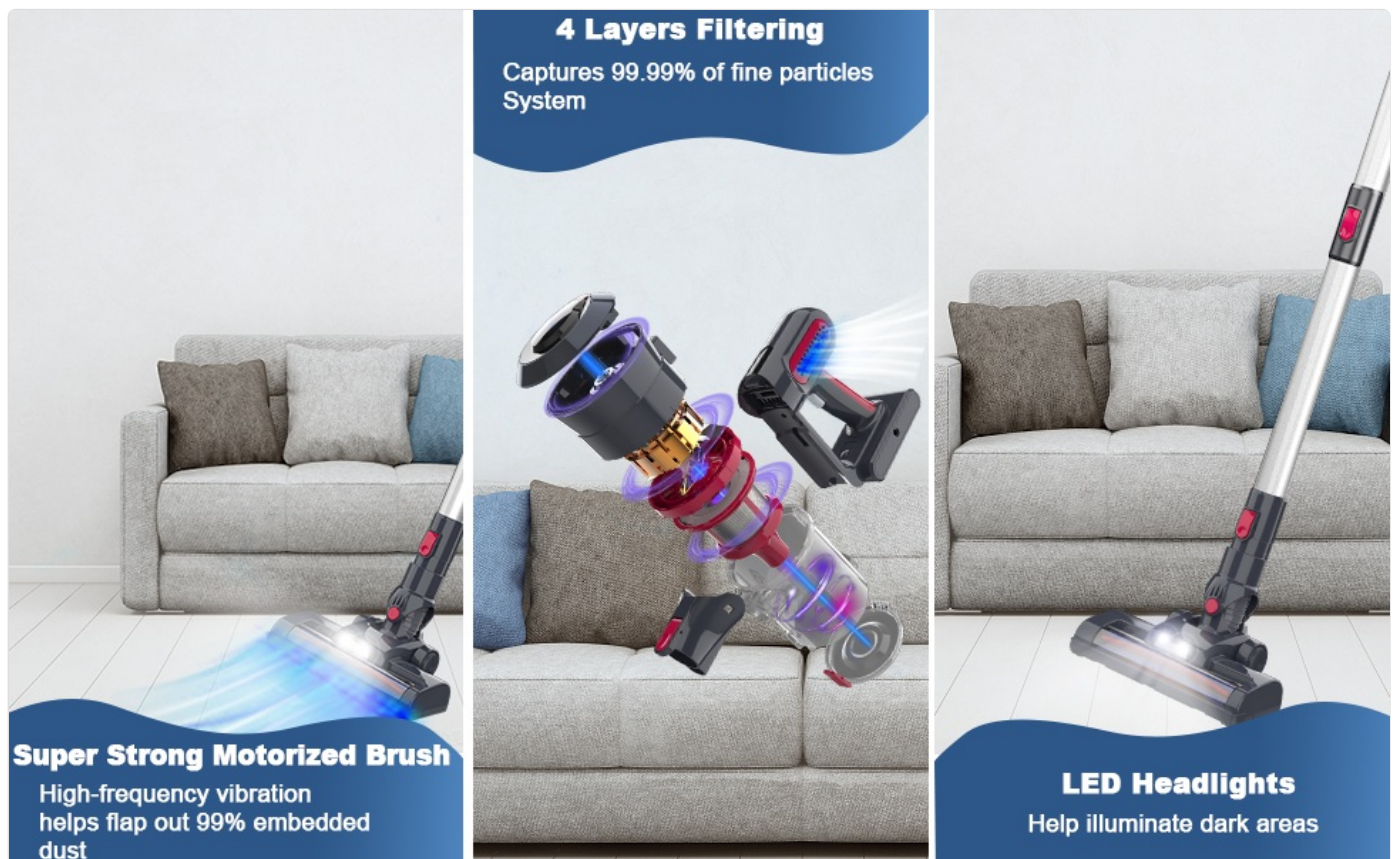
Image 4.2: Internal components and features like the motorized brush and filtration system.

Key components include a powerful motorized brush, a multi-layer filtration system, and integrated LED headlights for improved visibility.