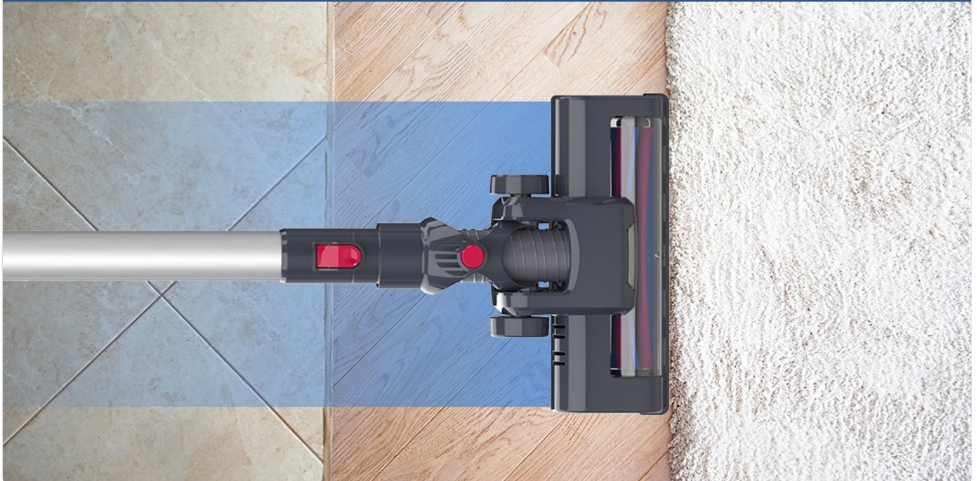
Image 6.2: The vacuum cleaner is effective on various floor materials.