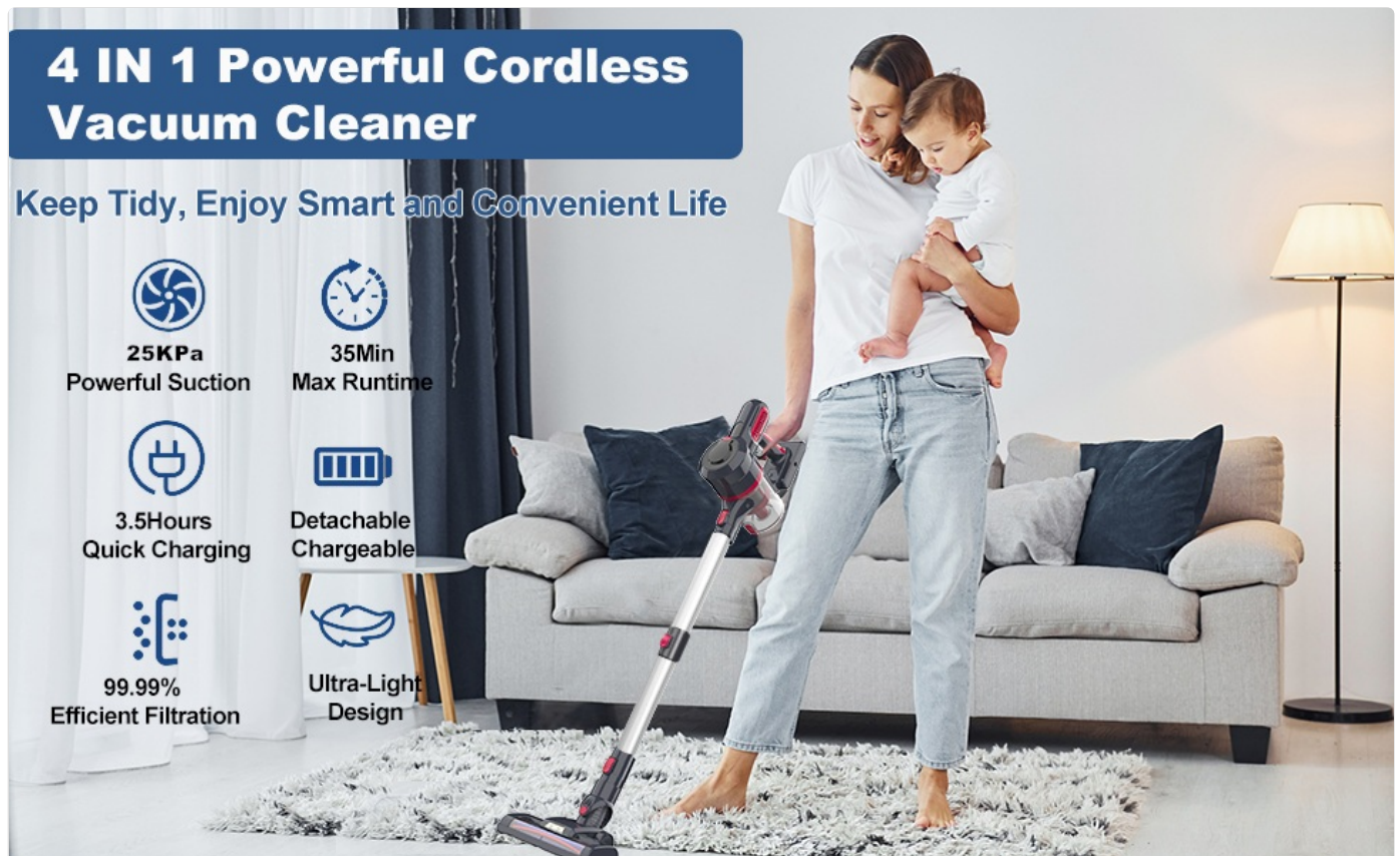
Image 1.1: Overview of the Foppapedretti Cordless Stick Vacuum Cleaner's key features.

Thank you for choosing the Foppapedretti 2023 Cordless Stick Vacuum Cleaner. This manual provides essential information for the safe and efficient operation, maintenance, and troubleshooting of your new vacuum cleaner. Please read it thoroughly before first use and retain it for future reference.