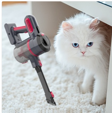
Image 6.3: Using the handheld vacuum with a crevice tool for targeted cleaning.