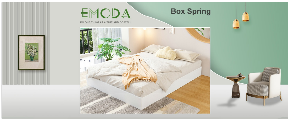
Image: A visual representation of the mattress, box spring, and bed frame working together for optimal support.