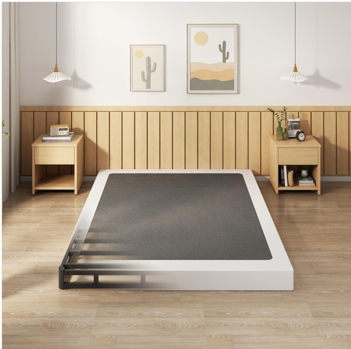
Image: The EMODA box spring with its fabric cover, supporting a mattress in a bedroom environment.