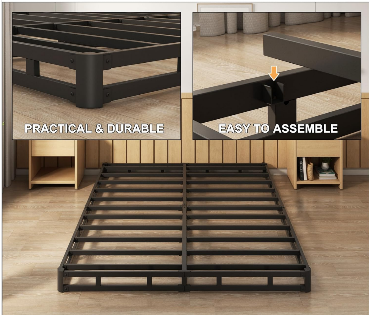
Image: The fully assembled metal box spring frame, ready for the fabric cover or mattress.