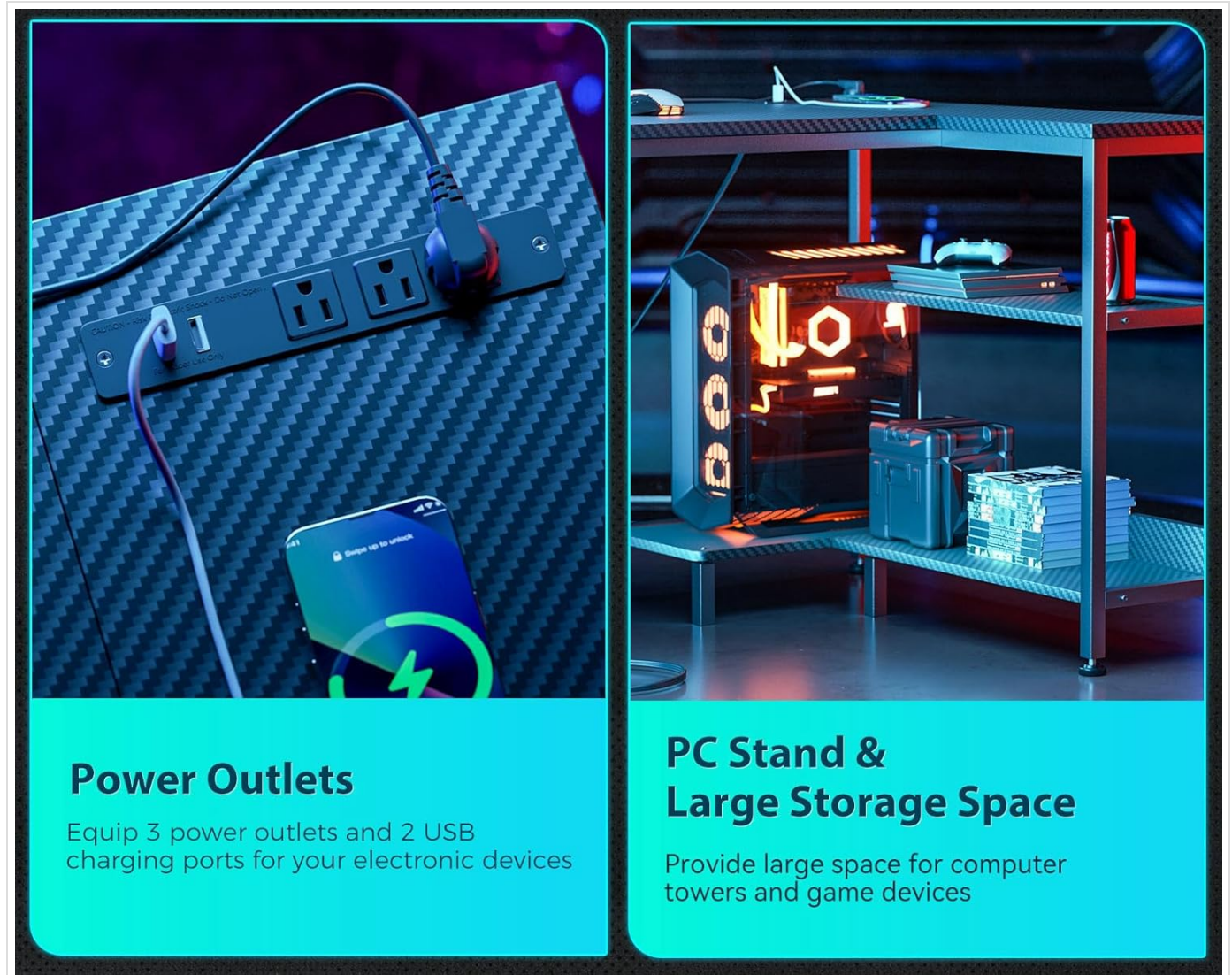
Image: Close-up view of the integrated power outlets, USB, and Type-C charging ports on the desk surface.

The integrated power strip provides easy access to power for your electronic devices. Simply plug your electronics into the 3 AC outlets, 1 USB-A port, or 1 Type-C port located on the desktop. Ensure the desk's main power cord is connected to a functional wall outlet for power delivery.