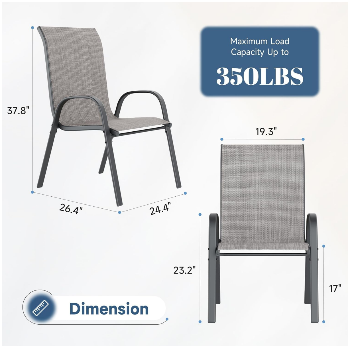
Image: Detailed dimensions of the Amopatio Patio Chair. These measurements ensure a comfortable fit and understanding of the chair's footprint.