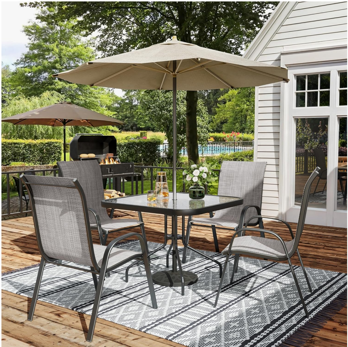
Image: Amopatio Patio Chairs in an outdoor setting. These chairs are designed for comfort and durability in various outdoor environments.