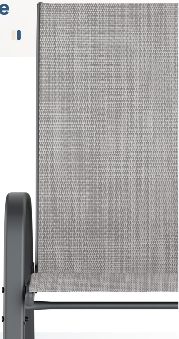
Image: Features of the breathable Textilene fabric. This material ensures durability and ease of cleaning for outdoor use.