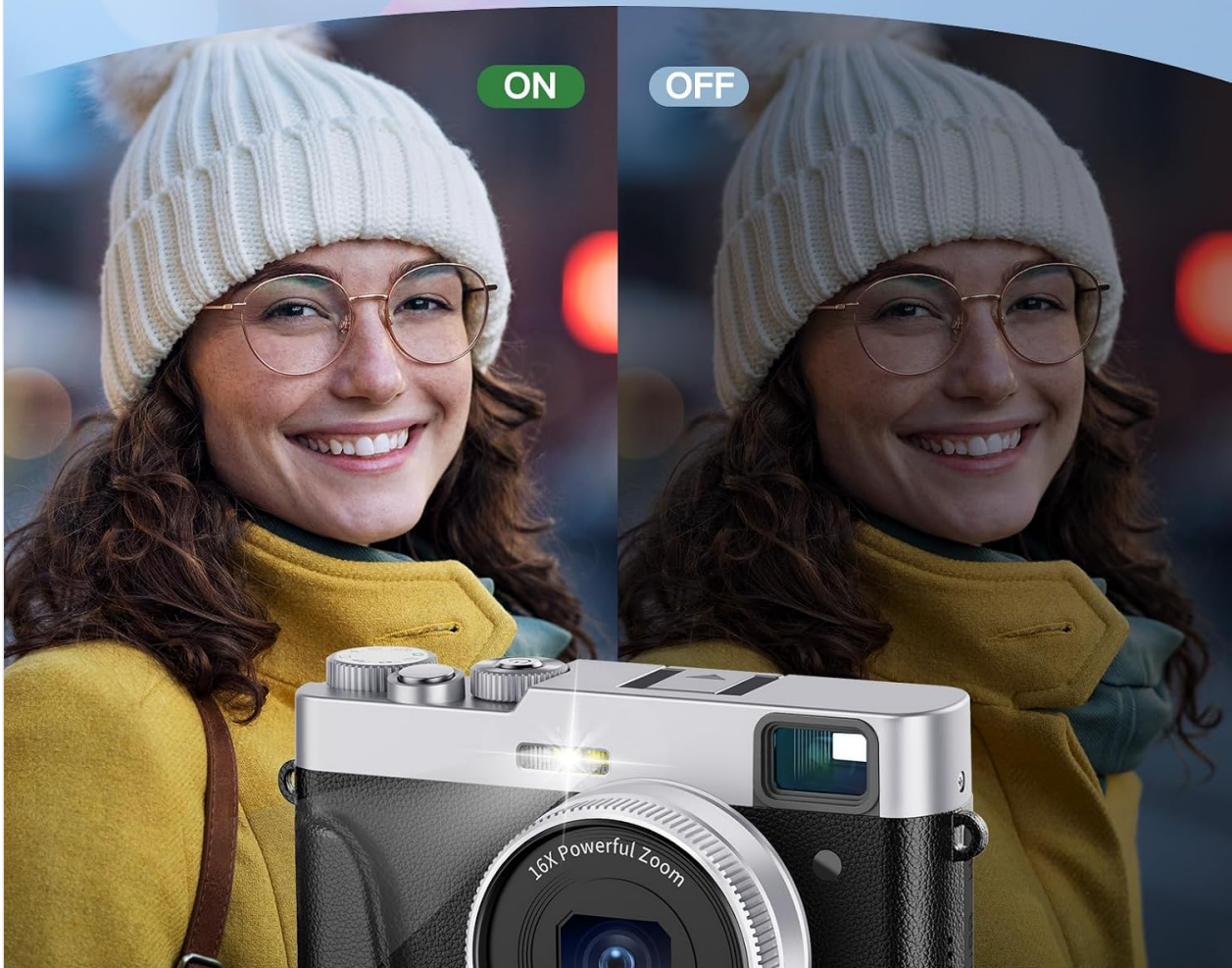
Image: A comparison showing the effect of the camera's flash in a low-light setting, with the flash off and on.

Give you plenty of light in a dark enviroment and take brilliant photos