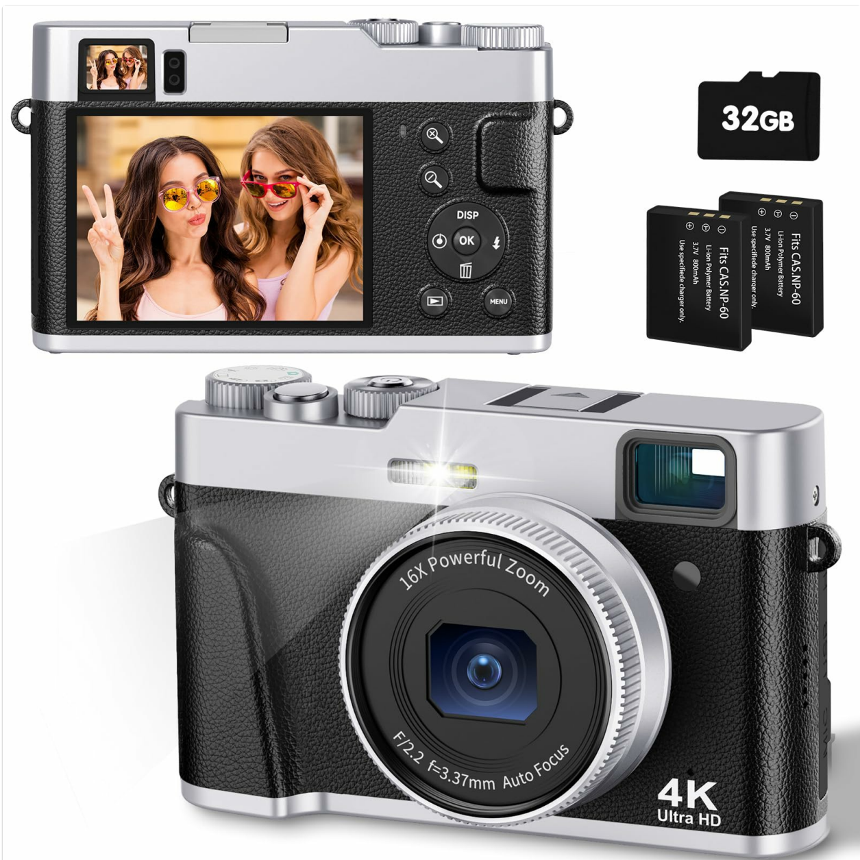
Image: The CAMKORY 4K Digital Camera, illustrating the optical viewfinder and the difference between 1080p and 4K image quality in a landscape scene.

The CAMKORY DC202 is a compact digital camera designed for ease of use, featuring 4K video recording and 48MP still image capture. It includes an optical viewfinder, autofocus, and digital image stabilization.