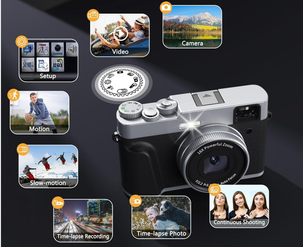
Image: Front view of the camera, showing the lens, built-in flash, and the mode dial on top.

Easily Switch And Shoot Ultra-clear Night