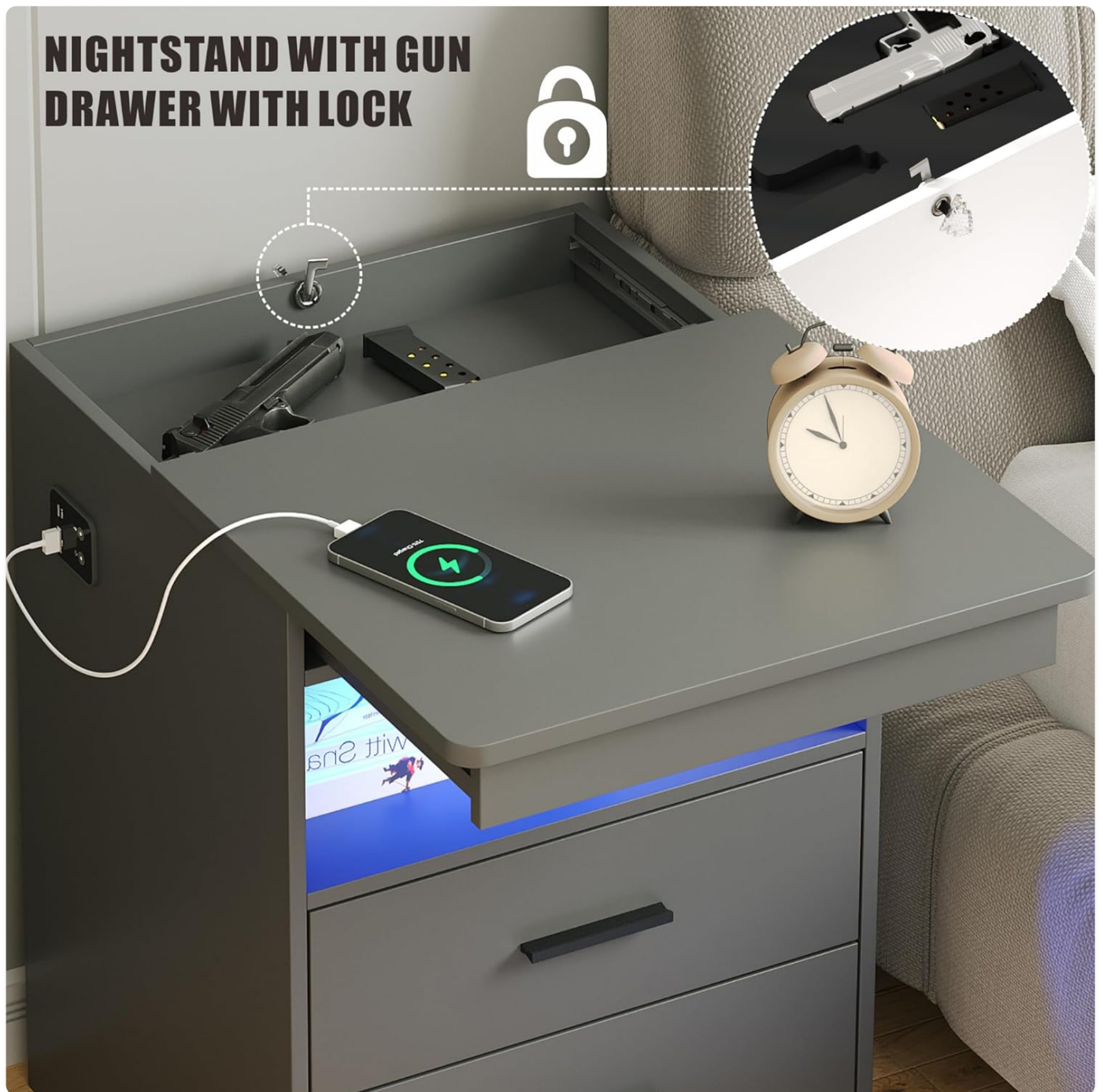
Figure 5.3: The hidden gun drawer, showing the sliding top mechanism and the integrated key lock for secure access.