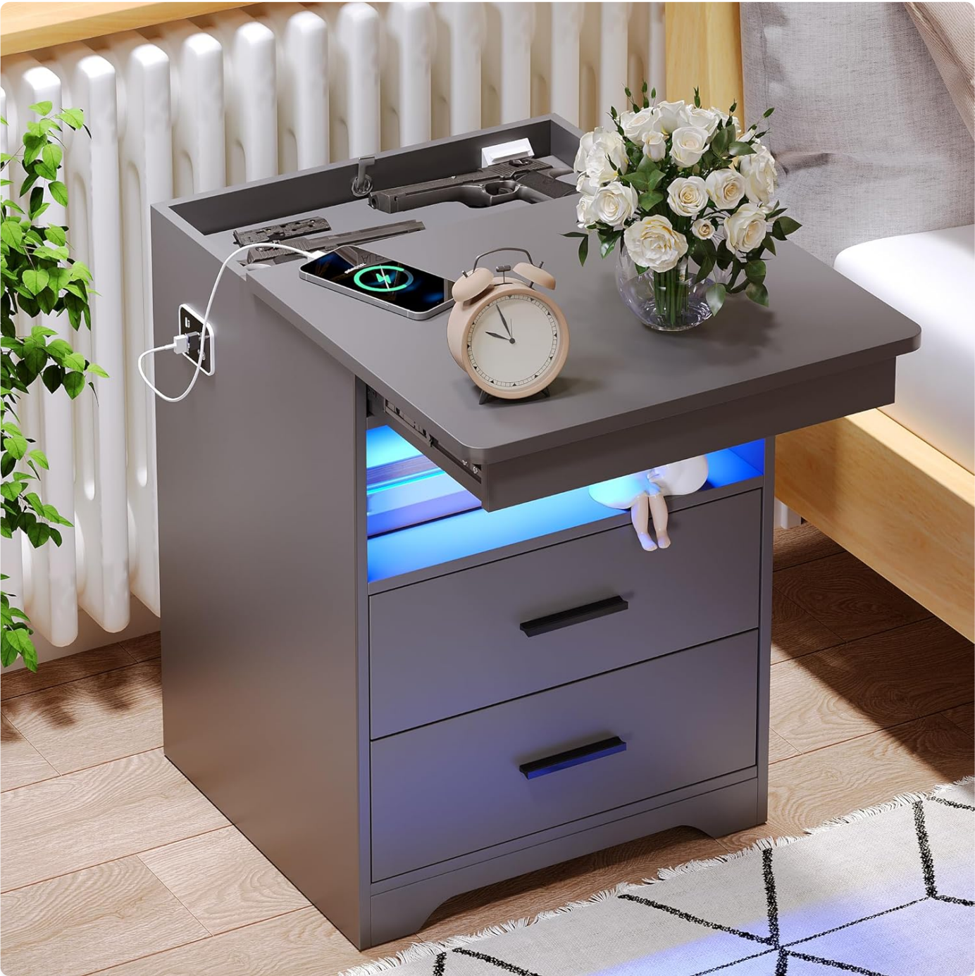
Figure 2.1: Overview of the FREDEES Nightstand, showcasing its hidden gun drawer, charging capabilities, and LED lighting.

Your browser does not support the video tag.