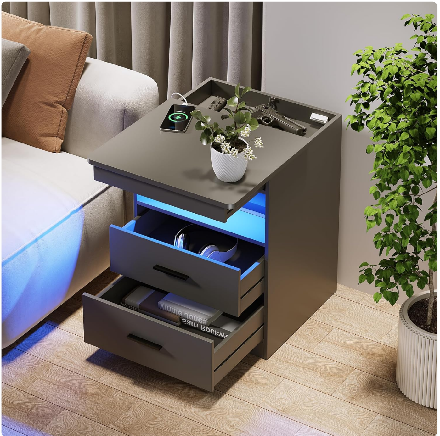
Figure 5.4: The two main storage drawers of the nightstand shown open, illustrating ample space for various items.