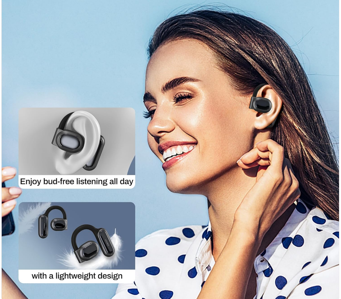
Image: The DACOM FreeBeats Open Ear Bluetooth Headphones, showing both earbuds and their charging case.

The earbuds are equipped with 16.2mm dynamic drivers for clear audio and feature a secure, comfortable fit suitable for various activities.