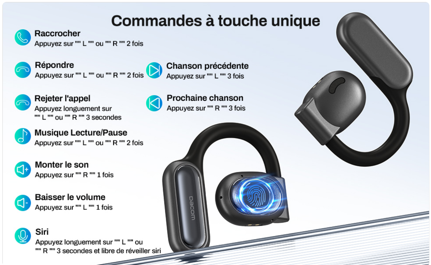
Image: Detailed diagram of single-touch controls for various functions.

The DACOM FreeBeats headphones feature intuitive touch controls on each earbud.