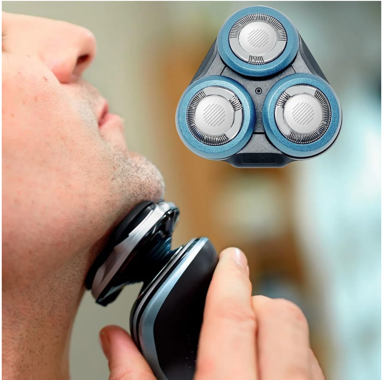
Image: A person using an electric shaver, demonstrating the product in its intended application for facial hair removal.

Once the replacement shaving head is installed, your shaver is ready for use. Refer to your original Philips Norelco shaver manual for detailed operating instructions specific to your shaver model. The replacement head functions identically to the original head, providing a close and comfortable shave.