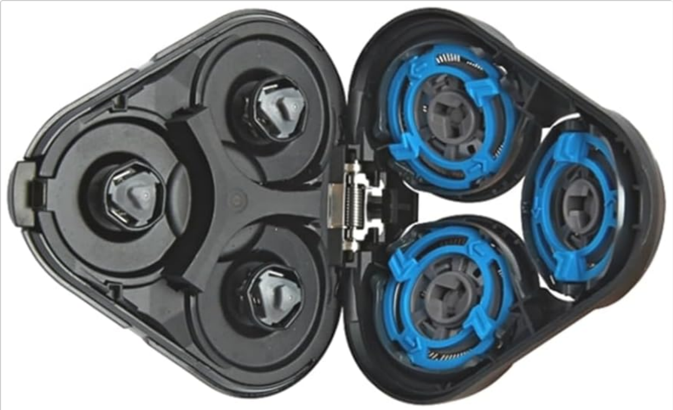
Image: Internal view of the shaver head assembly, showing the three blue rotary cutters and their housing. This illustrates the components that need to be handled during installation and cleaning.