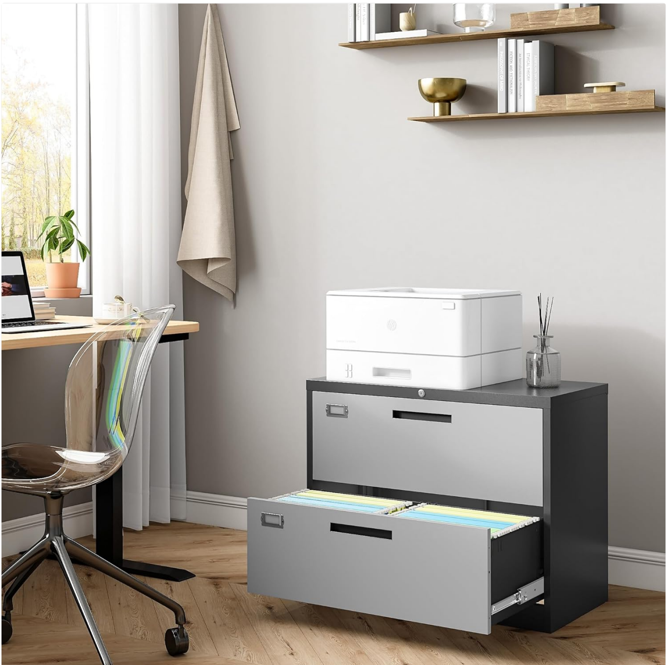
Figure 4.1: Cabinet in Use. This image shows the 2-drawer lateral file cabinet in an office environment with one drawer open, demonstrating its storage capacity.