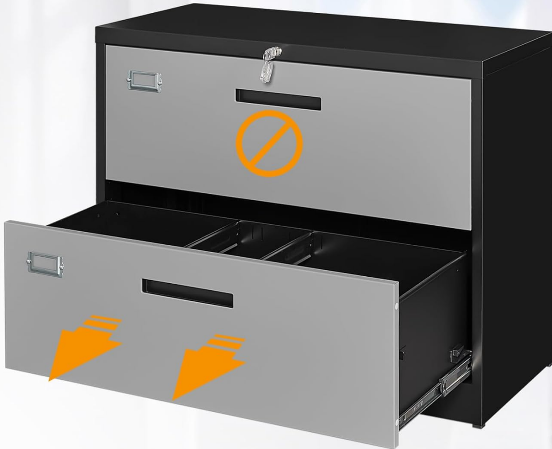
Figure 3.3: Anti-Tilt Design. This image highlights the anti-tilt mechanism, which prevents more than one drawer from opening at a time, enhancing cabinet stability.

Only one drawer can be opened at one time