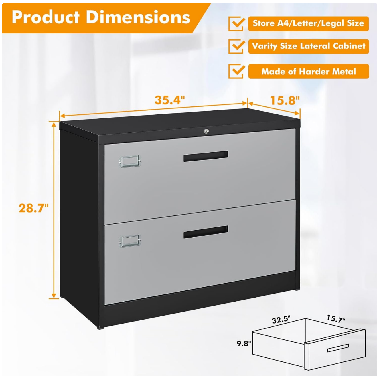
Figure 3.1: Product Dimensions. This image illustrates the overall dimensions of the 2-drawer lateral file cabinet, including width, depth, and height, along with drawer dimensions.