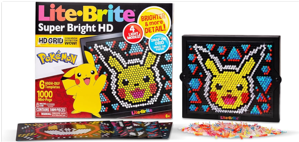
Image: The Lite Brite Super Bright HD unit displaying a Pikachu design, with a pile of colorful mini-pegs next to it. This image shows the main unit and the pegs included in the box.