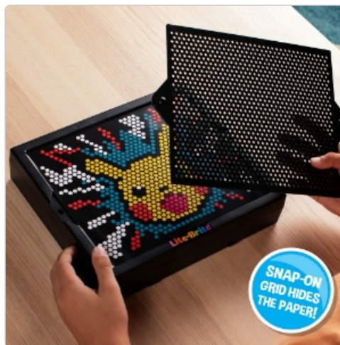
Image: A close-up view of the Lite Brite unit's snap-on grid, highlighting how it secures the template underneath. The text "SNAP-ON GRID" is visible, emphasizing this feature.