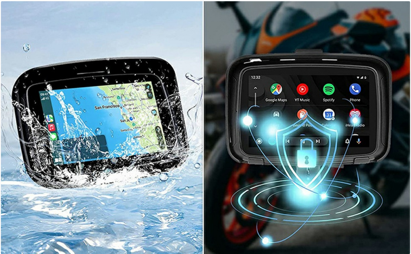
Image: A graphic depicting the Sunweyer c5 with a security shield icon, emphasizing its anti-theft features.