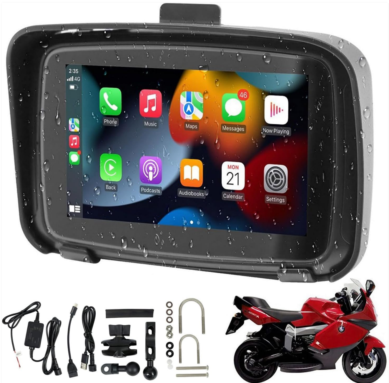
Image: The Sunweyer c5 Portable Carplay unit, showcasing its design and interface.