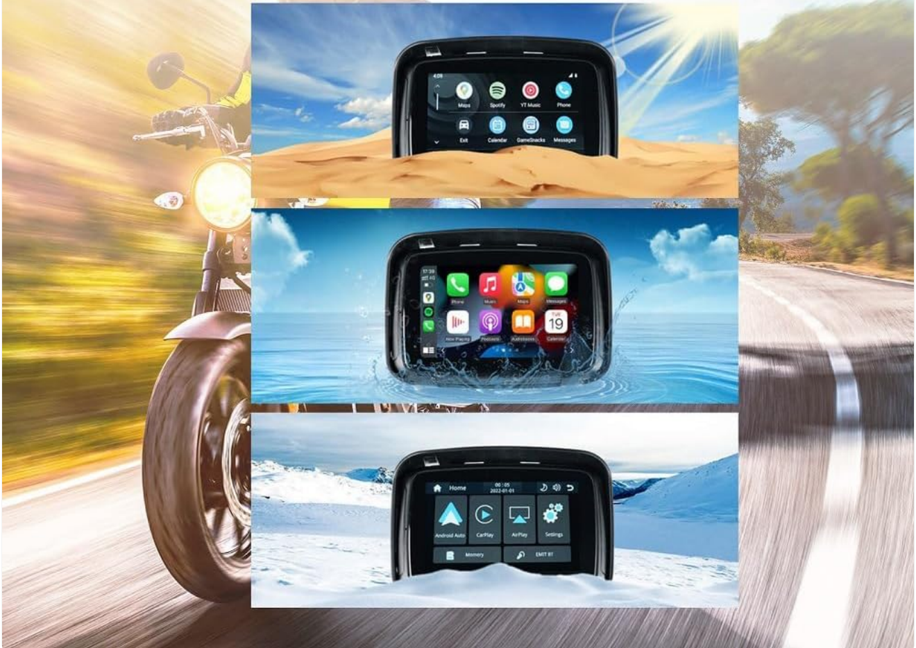
Image: The Sunweyer c5 shown in desert, rain, and snow environments, highlighting its weather resistance.

Built to withstand all kinds of weather. IPX7 waterproof and sunscreen design allows you to use it normally in heavy rain, sunny days and cold weather. Works between -20^{\circ}\text{C} and 70^{\circ}\text{C} . Anti-glare vehicle gauges screen keep you visible in any light.