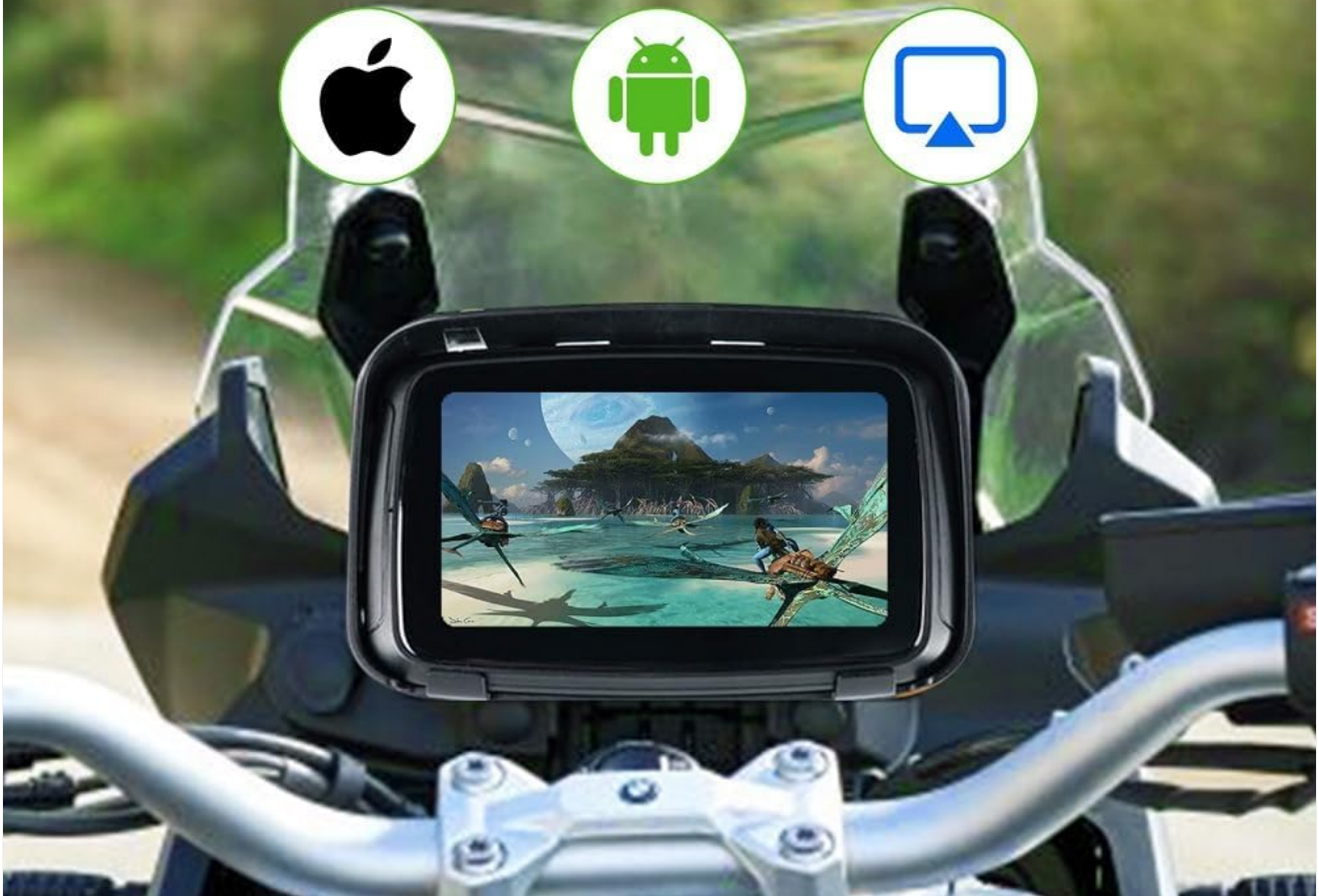
Image: The Sunweyer c5 screen displaying video content, demonstrating its mirroring capability for streaming platforms.

The module has built-in wireless video image projection function. Support iPhone AirPlay by WiFi and mirror Android phone by Autolink Application and USB cable. Let you watch anytime, anywhere.