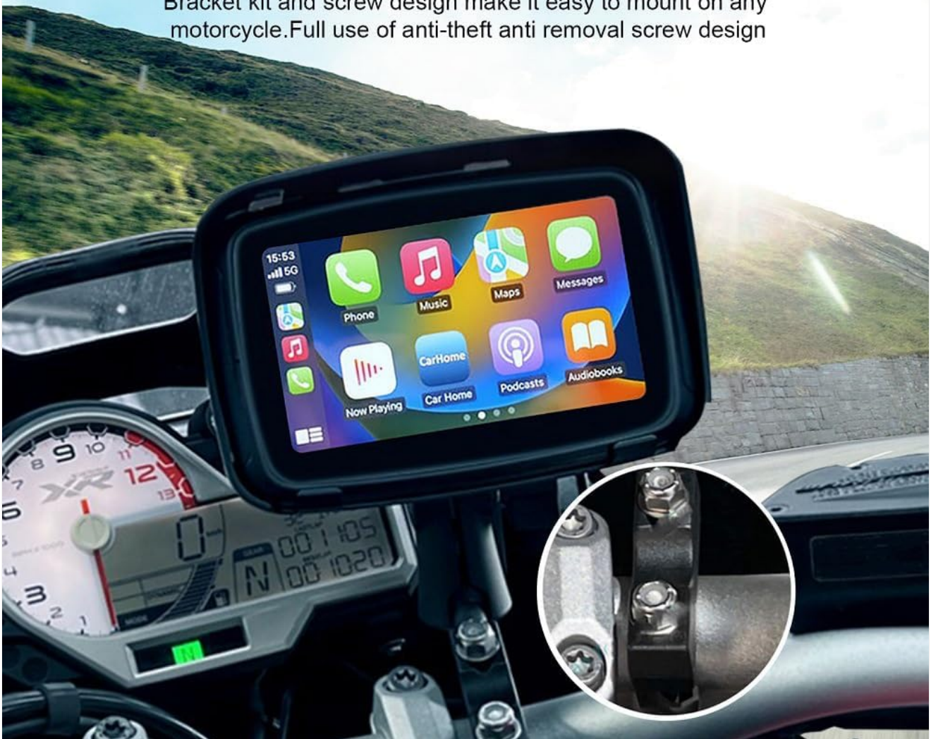
Image: The Sunweyer c5 unit installed on a motorcycle handlebar, demonstrating the mounting process.

Bracket kit and screw design make it easy to mount on any motorcycle. Full use of anti-theft anti removal screw design