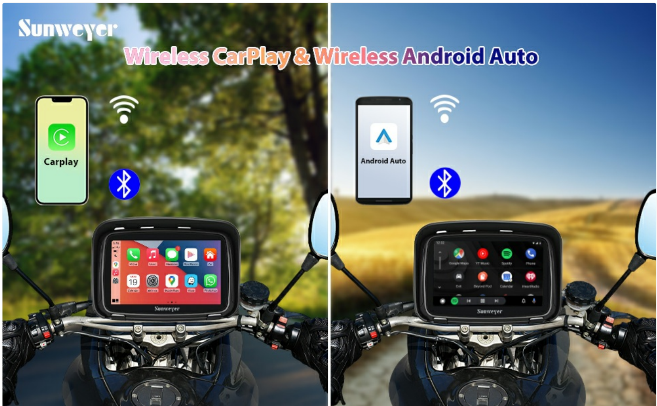
Image: A visual comparison showing both Wireless CarPlay and Wireless Android Auto interfaces on the Sunweyer c5.