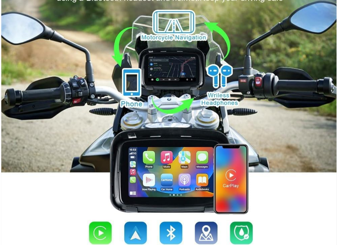
Image: Diagram illustrating the dual Bluetooth connection flow from phone to Sunweyer c5 and then to a Bluetooth helmet or wireless headphones.

Dual Bluetooth 5.0 enables you to listen to music, make phone calls using a Bluetooth headset and helmet. Keep your driving safe