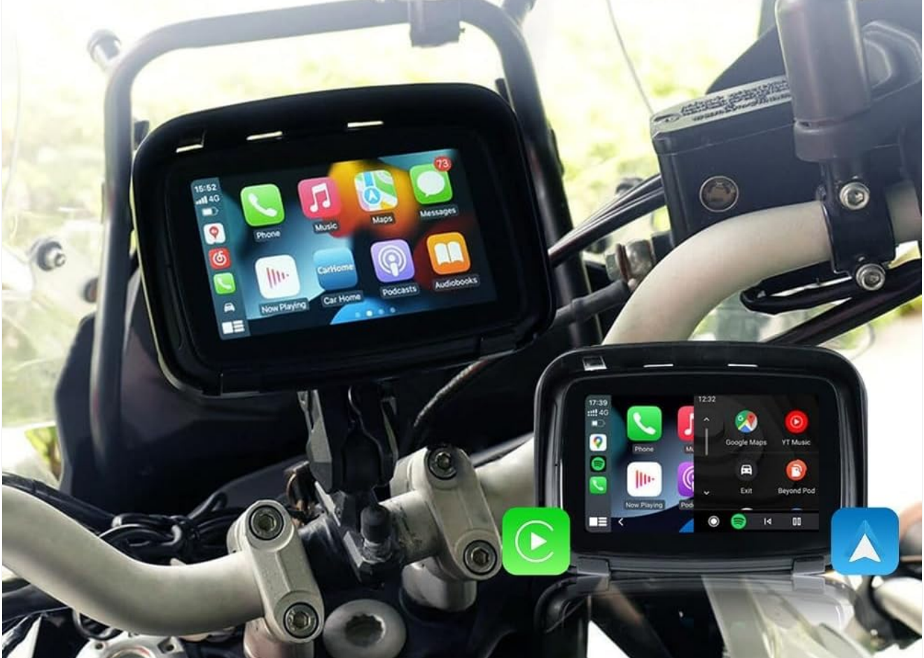
Image: The Sunweyer c5 screen displaying the Apple CarPlay interface with various app icons.

Use the CarPlay or Android Auto function to connect the mobile phone to the touch screen with bluetooth, so that you don't have to take out your mobile phone frequently while driving, ensuring driving safety