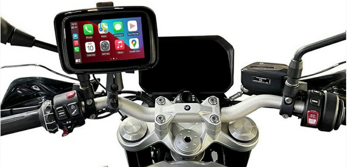
Image: Close-up of the motorcycle handlebar mount, showing the secure attachment mechanism for the device.