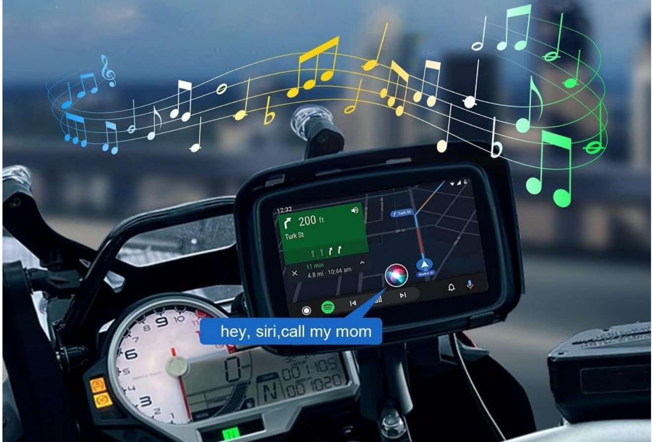
Image: The Sunweyer c5 screen showing a navigation map with a voice assistant prompt, indicating hands-free operation.

Free your hands, use google voice or siri to wake up navigation, listen to music, make calls and other functions anytime and anywhere. Navigate your motorcycle as you would your car.