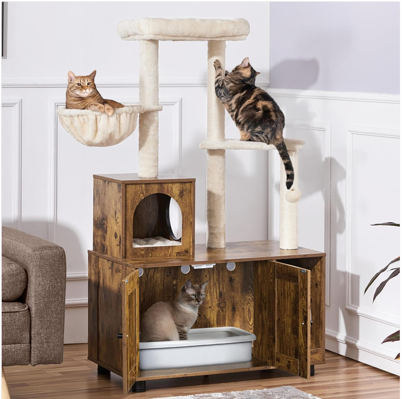
Figure 5.1: A cat utilizing the hidden litter box enclosure at the base of the unit, with another cat resting on the upper perch.