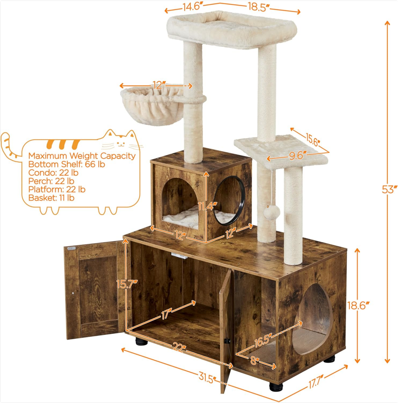
Figure 4.2: Detailed dimensions of the cat tree and litter box enclosure components, including the top perch, platform, condo, basket, and internal cabinet spaces.