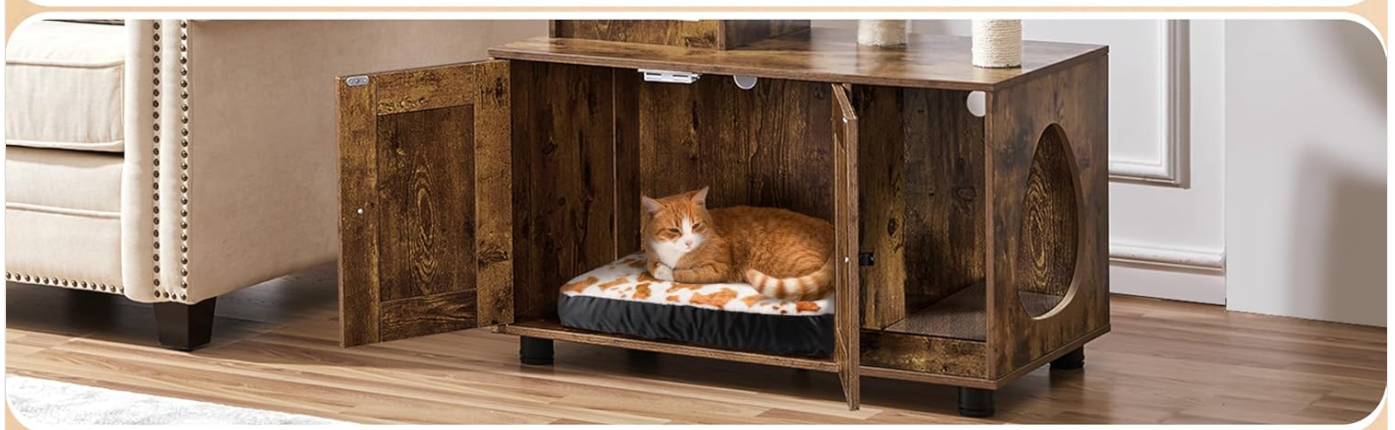
Figure 5.2: Illustration of the multiple access points for cats to enter and exit the litter box enclosure, designed for convenience and privacy.