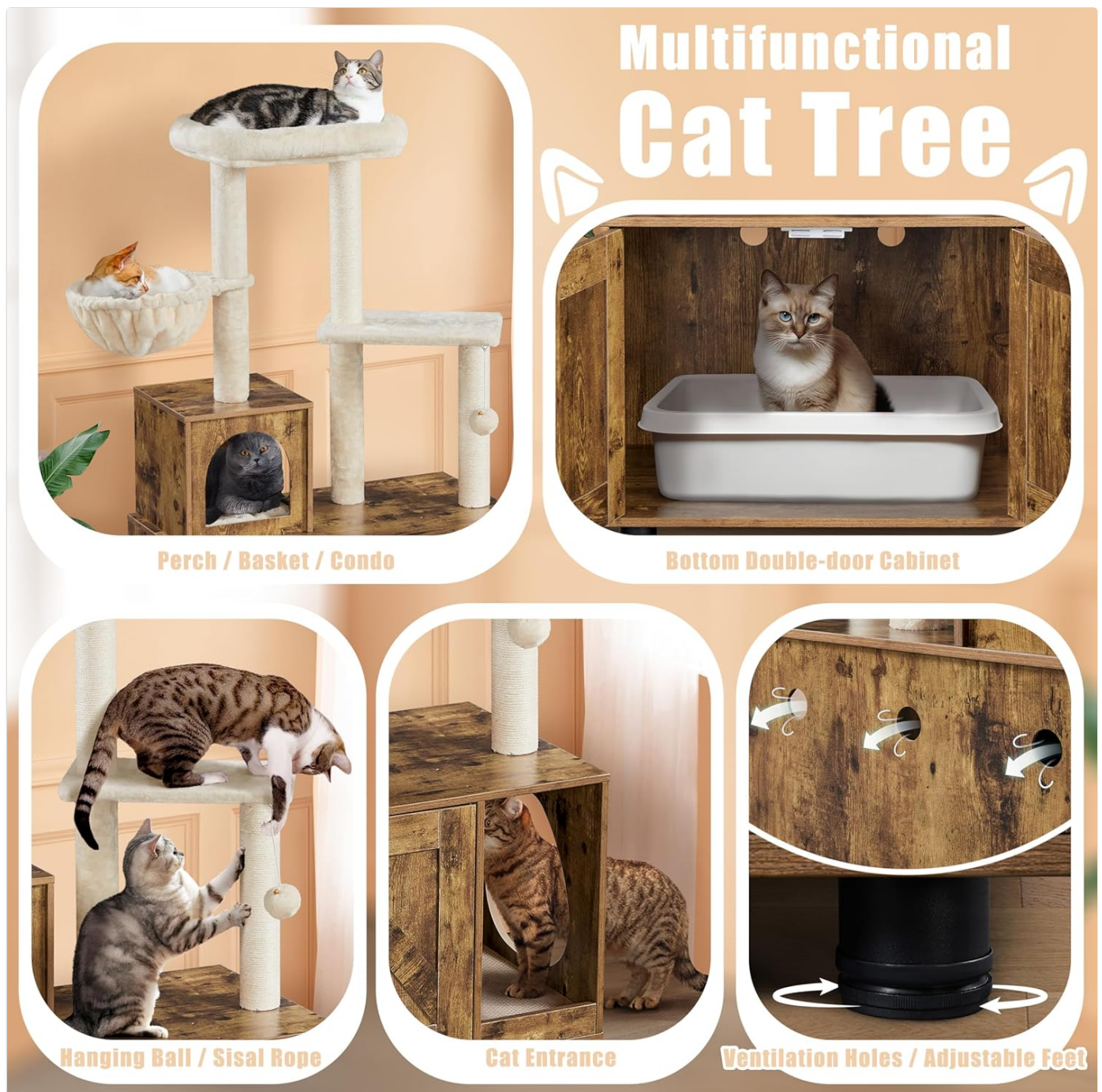
Figure 5.4: Overview of the cat tree's multifunctional design, highlighting the perches, basket, condo, hanging ball, sisal rope, and bottom cabinet.

Your browser does not support the video tag.