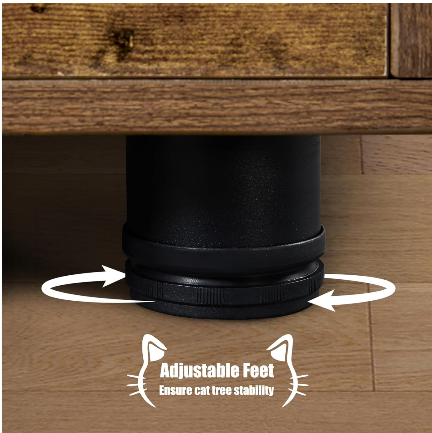
Figure 4.3: Close-up of the adjustable feet, which can be rotated to ensure the cat tree remains stable on various floor surfaces.