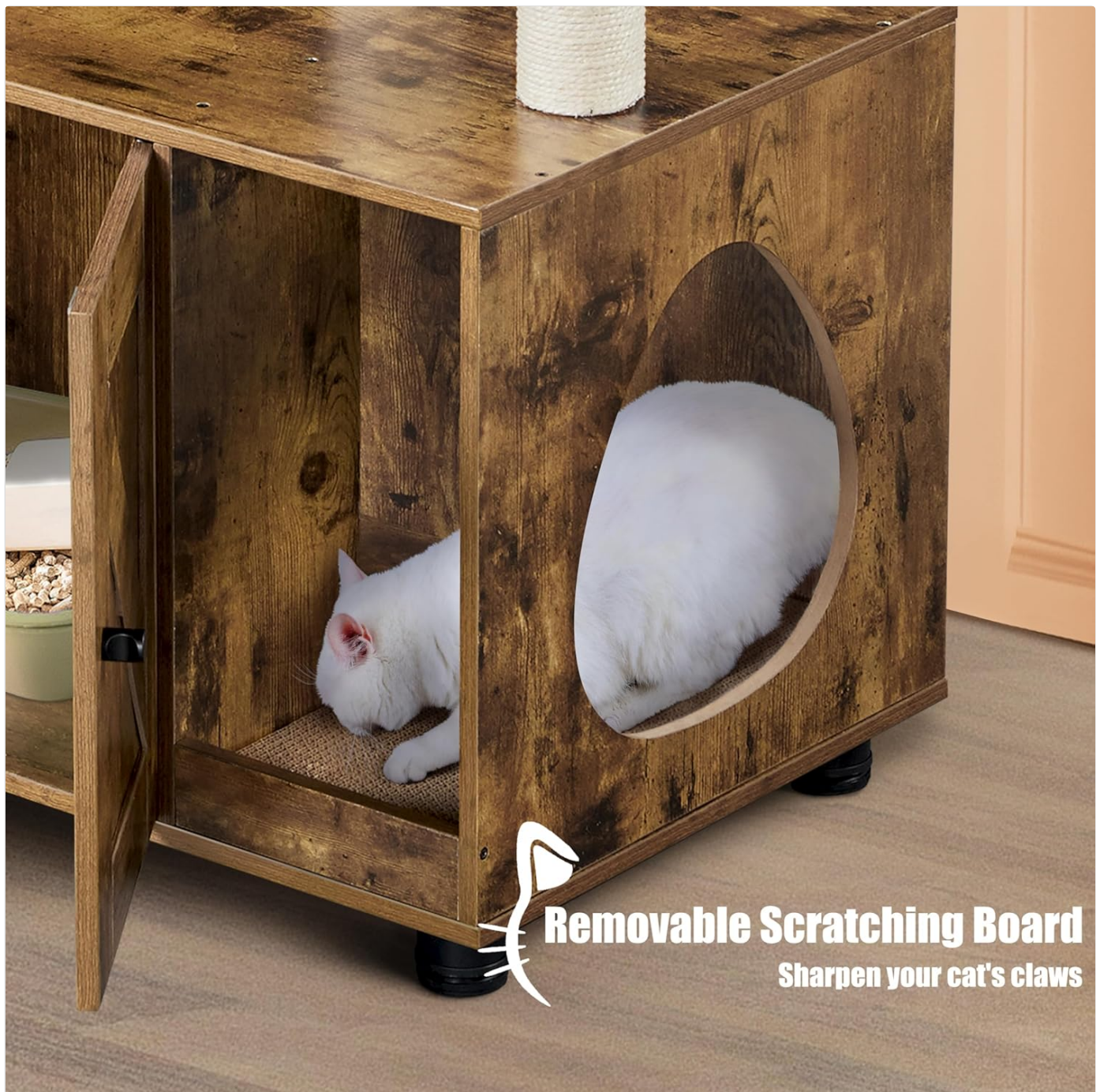
Figure 5.3: A removable scratching board located within the open compartment of the litter box enclosure, providing an additional scratching surface for cats.