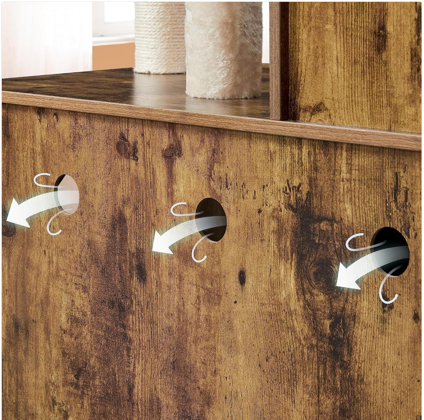
Figure 6.2: Illustration of the ventilation holes integrated into the litter box enclosure, designed to promote air circulation and reduce odor buildup.