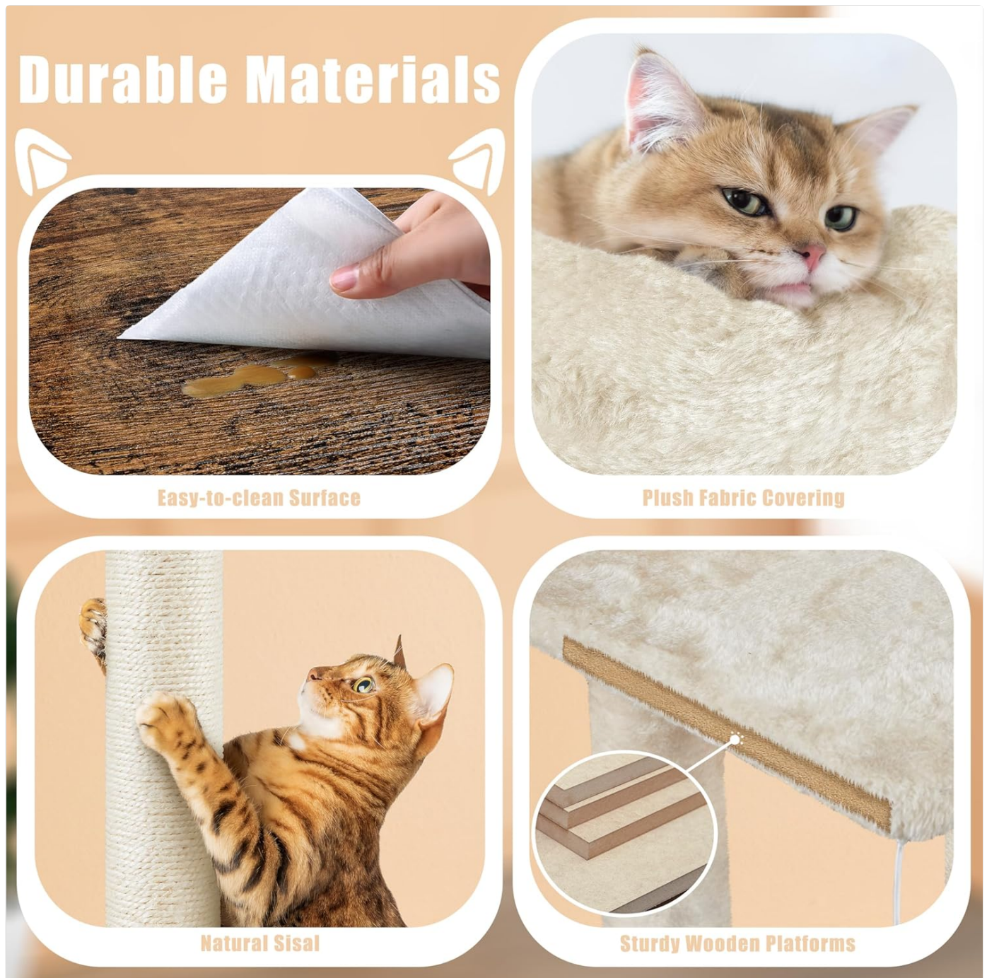
Figure 6.1: Close-up showing the easy-to-clean wooden surface, plush fabric covering, and natural sisal rope, highlighting the durable materials used in construction.