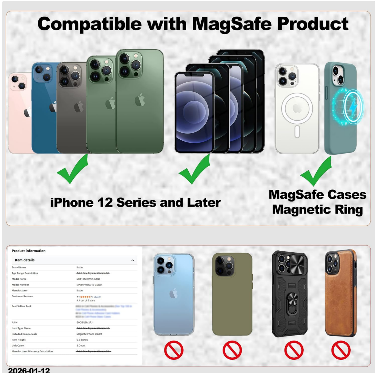
Figure 1: Compatibility overview for iLodn Magnetic Wallet, showing various iPhone models and MagSafe cases.