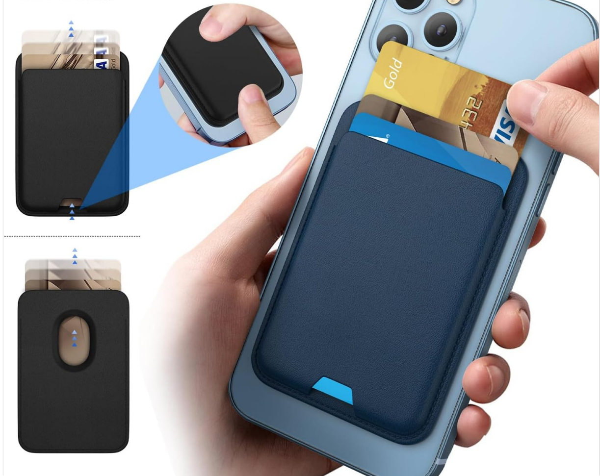
Figure 4: Cards can be easily accessed by pushing from the bottom cutout or the back opening.

Simply access your card from the top, bottom and the back.