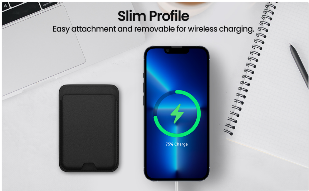
Figure 6: The slim profile allows for easy removal for wireless charging.