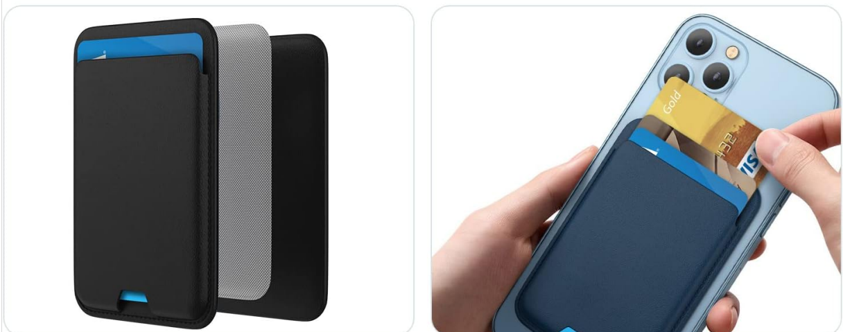
Figure 5: Metallic shielding protects cards from demagnetization.

Metallic shielding provides degauss protection for your cards to prevent demagnetization