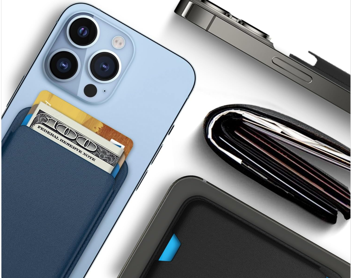
Figure 3: The wallet can comfortably hold 1 to 3 cards, maintaining a slim profile.