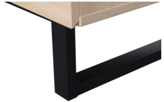
Strengthened Metal Base

Image: Detailed views showing the circular cutouts for cable management, the robust premium door hinges, the texture of the durable wood material, and the strengthened metal base.