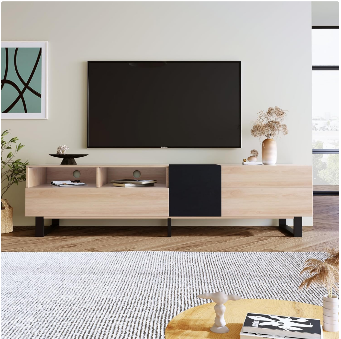
Image: The fully assembled Virubi Modern TV Stand, showcasing its minimalist design and wood finish, positioned in a contemporary living room.