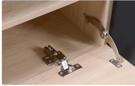
Premium Door Hinge