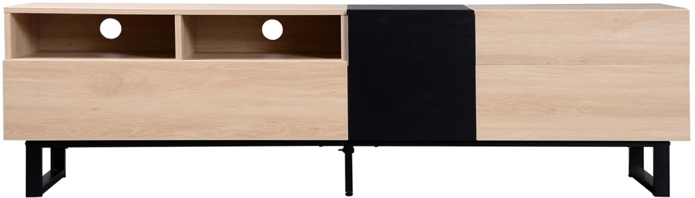
Image: A visual representation of the TV stand's storage capabilities, highlighting both the open shelves for media devices and the closed cabinets for concealed storage.