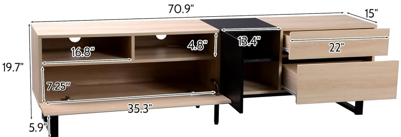
Image: A technical diagram illustrating the precise dimensions of the TV stand, including overall length, height, depth, and internal compartment measurements.