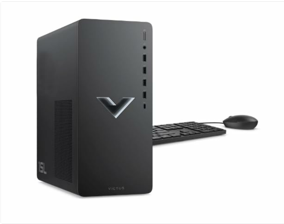
Image: Front view of the HP Victus 15L Gaming Desktop PC, showing its compact design and dimensions (13.27" H, 6.10" W, 11.71" D). An HP black wired keyboard and mouse are also visible.