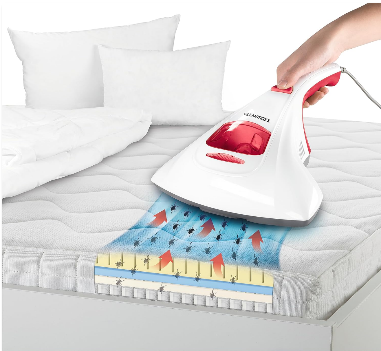
Image 6.2: A visual representation of how the vacuum cleaner's suction and UV-C light work together to remove mites from deep within mattress layers.