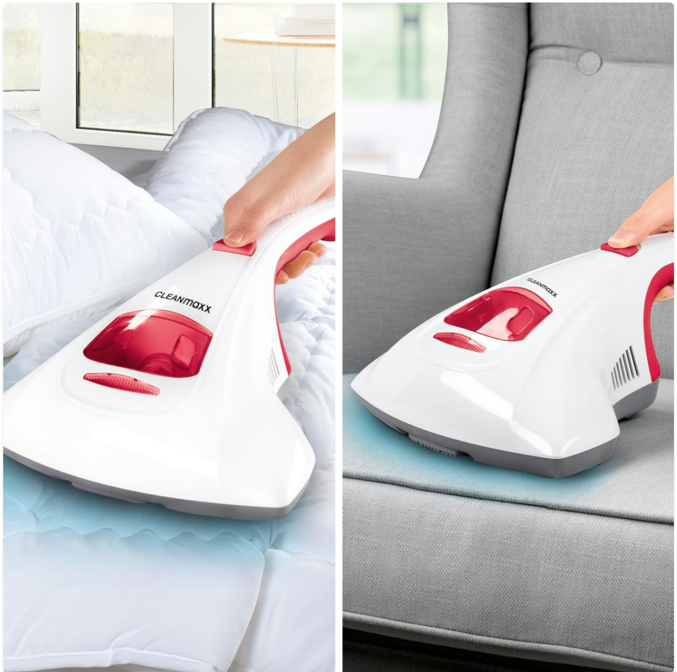
Image 6.1: The vacuum cleaner being used on a mattress (left) and upholstered sofa (right), demonstrating its versatility.