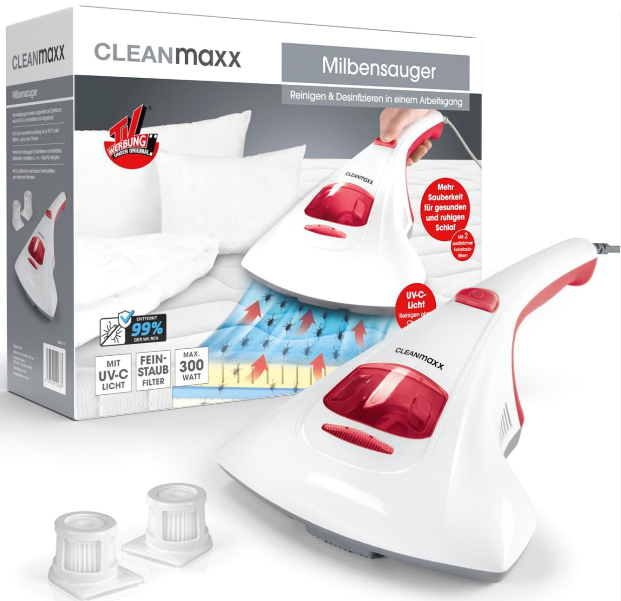
Image 1.1: The CLEANmaxx Anti-Mite Vacuum Cleaner, showing the main unit, its packaging, and the included fine dust filters.