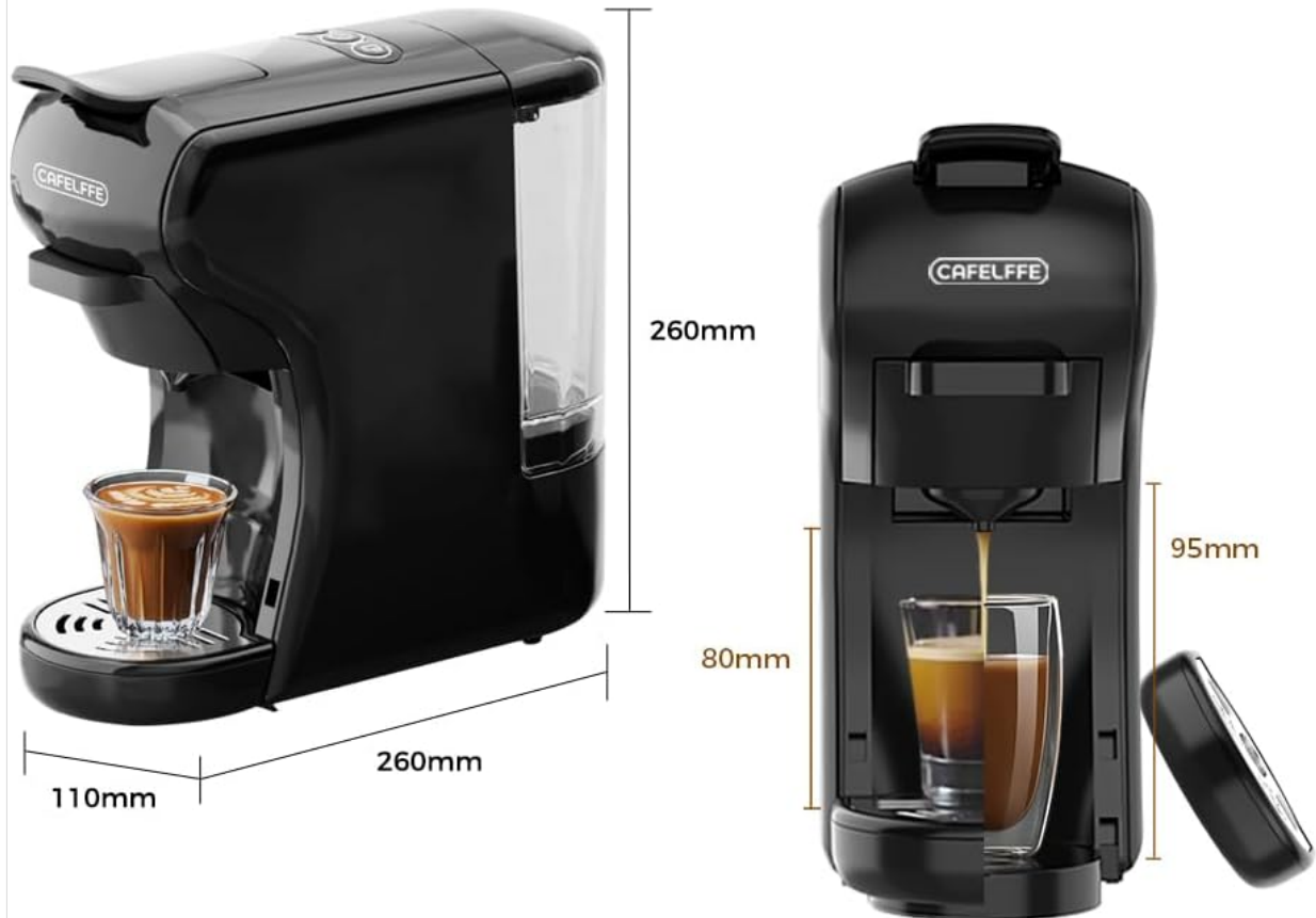
Image: Illustration of the machine's compact design, dimensions, and the feature for personalized coffee volume adjustment.

*The coffee size maybe variable depending on different capsules Program the coffee volume as you like