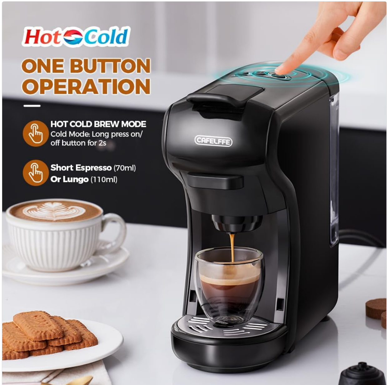
Image: The coffee machine highlighting its one-button operation for hot and cold brew modes.