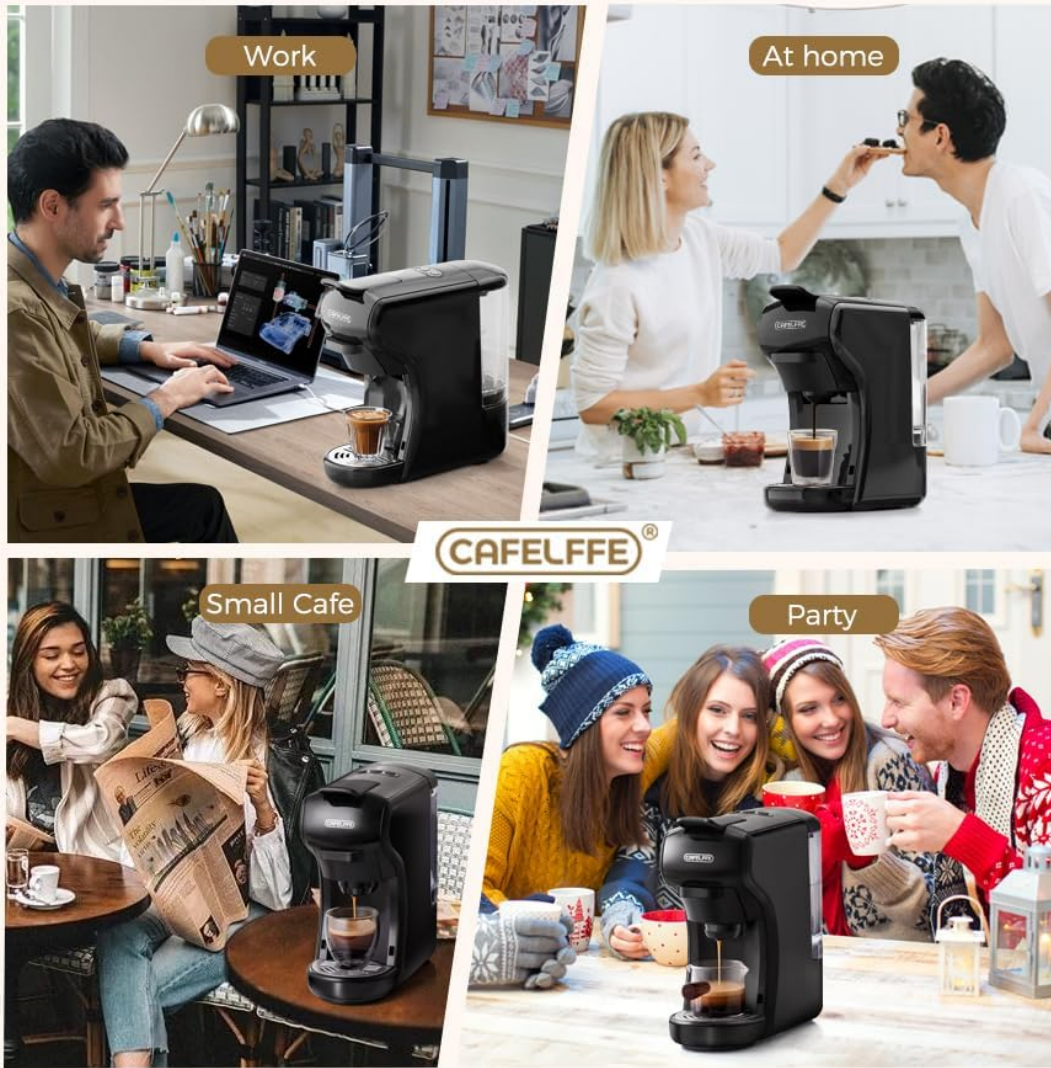
Image: The CAFELFFE coffee machine is suitable for various environments, including work, home, small cafes, and parties, demonstrating its versatility.