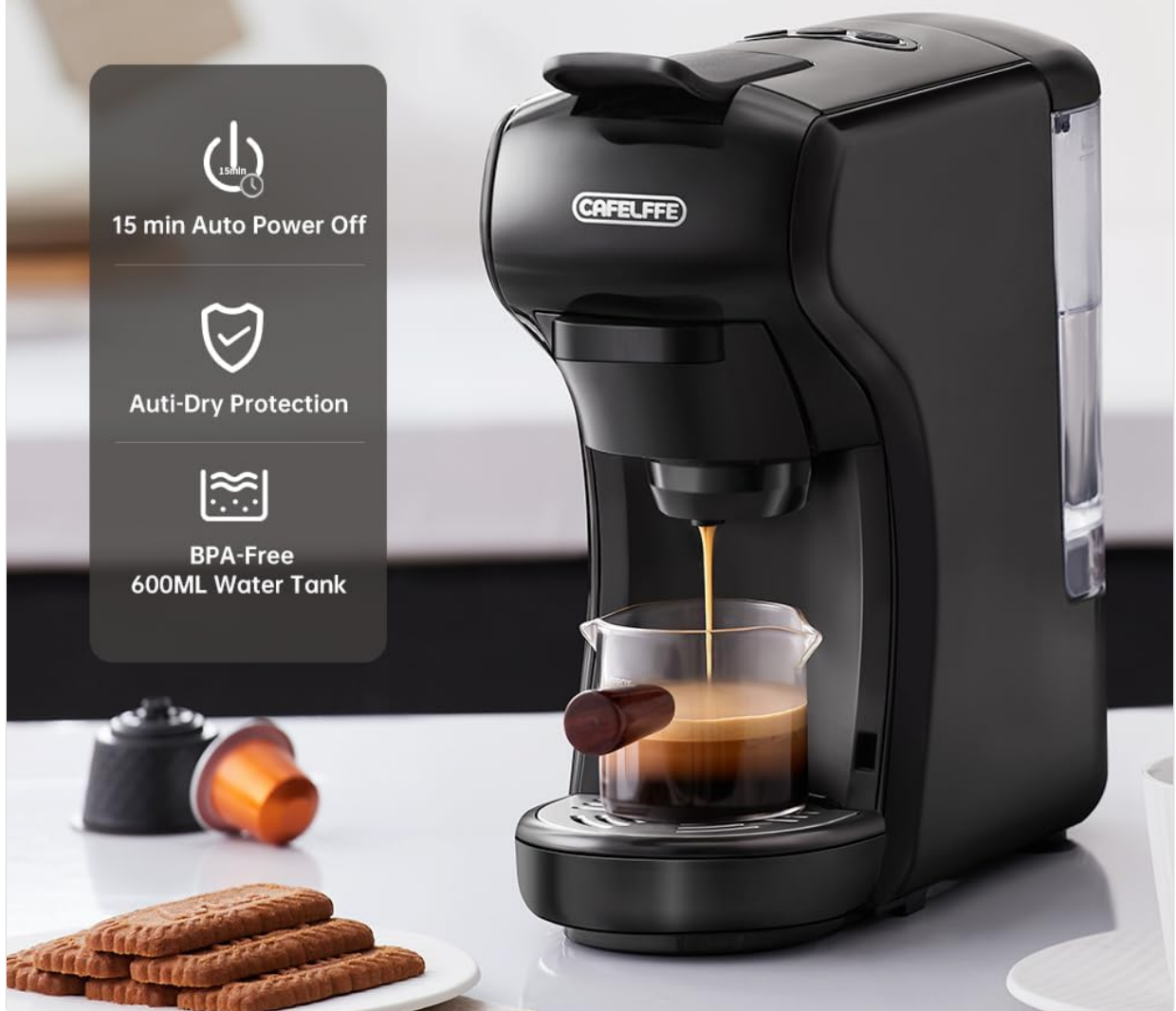
Image: Features of the machine's triple protection: 15-minute auto power off, anti-dry protection, and BPA-free 600ml water tank.