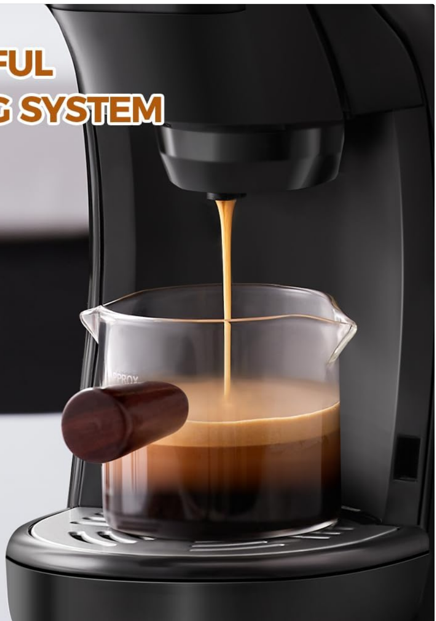
Image: Visual representation of the machine's powerful heating system, 20-second rapid brew, 92°F constant temperature extraction, 19 bar pressure pump, and 1450W power.