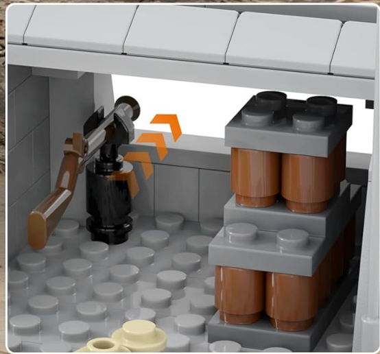
Image: A close-up collage showing various interactive features of the fort, including a rotating weapon display, interior weapon storage, and a movable cannon.

Video: A detailed demonstration of the assembled MOOXI WW2 Military Battle Fort, showcasing its various features, movable parts, and overall design from multiple angles.