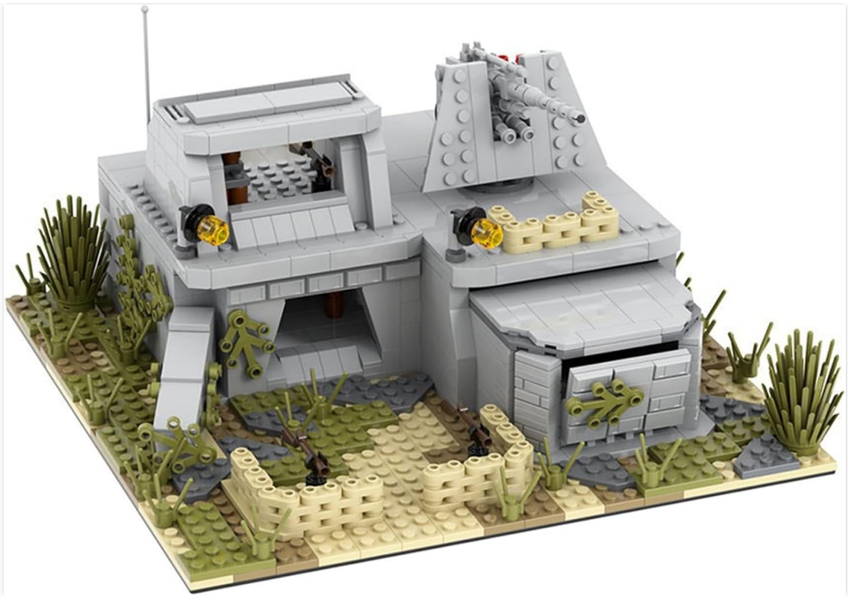
Image: The fully assembled MOOXI WW2 Military Battle Fort, showcasing its detailed exterior from a front-side perspective.