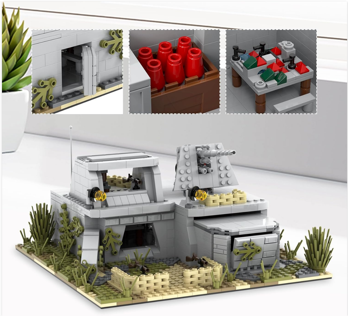
Image: An interior view of the MOOXI WW2 Military Battle Fort, highlighting the detailed rooms, weapon racks, and command center within the structure.