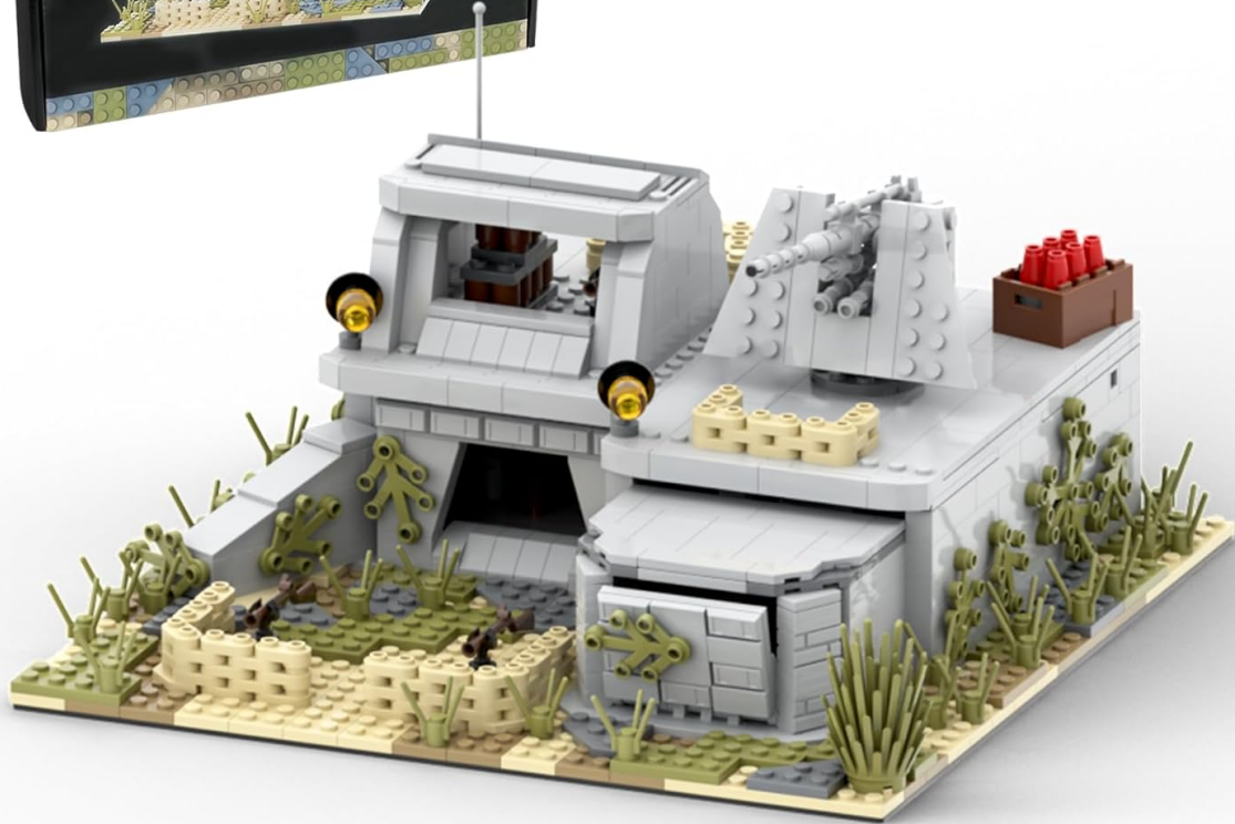
Image: The MOOXI WW2 Military Battle Fort Building Block Set, showing the product box and the fully assembled fort model.