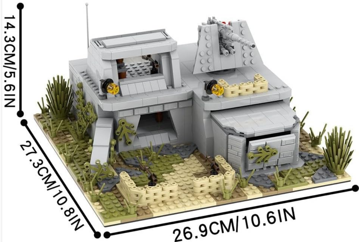
Image: A diagram illustrating the dimensions of the assembled MOOXI WW2 Military Battle Fort, providing measurements in both centimeters and inches.