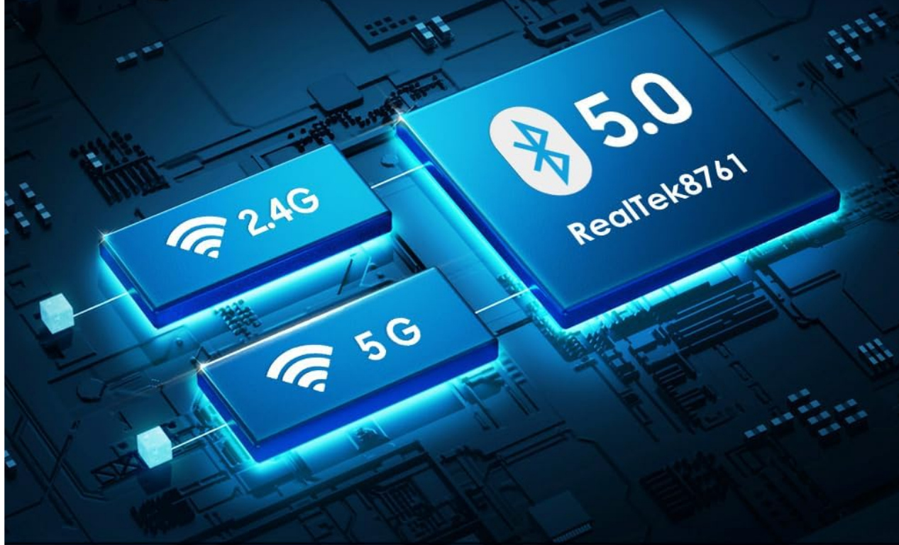
Image: Diagram illustrating Bluetooth 5.0 dual channel technology.

Stable and long distance WiFi connection