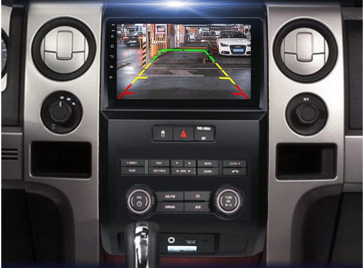
Image: Rear view camera display with dynamic parking guidelines.

A car video system that supports a backup camera up to 1920*1080 pixels display trouble some blind spots on the screen, allowing driver to see hazards such as pets, children playing, or mailboxes, as they backup. When you engage reverse gear, the device will automatically switch to reverse mode after a backup camera is correctly installed.