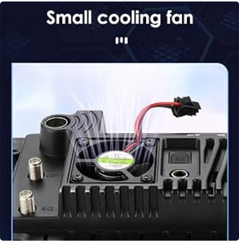
Image: Close-up view of the internal cooling fan.