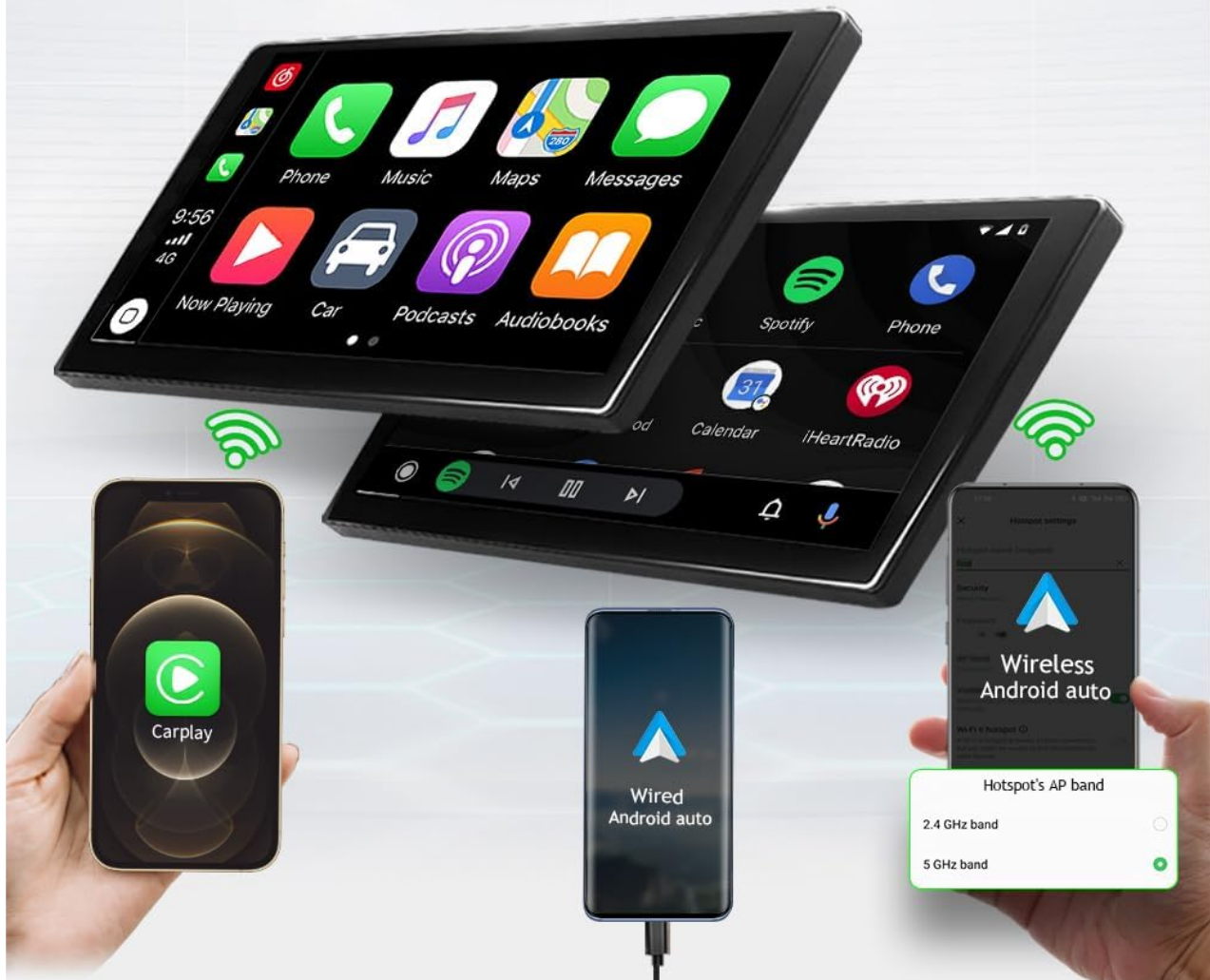
Image: Illustration of connecting smartphones for CarPlay and Android Auto.

Phone | Music | Maps | Podcasts Make your journey easier and more fun