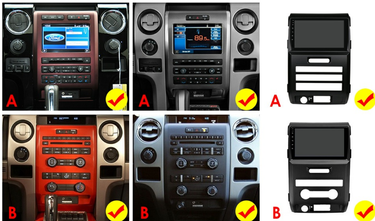
Image: Comparison of Ford F150 center consoles, highlighting compatible and incompatible designs for the stereo unit.