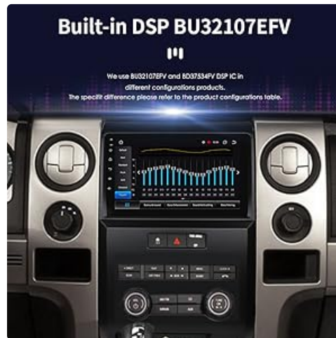
Image: DSP interface showing various audio adjustment options.

The built-in Digital Sound Processor (DSP) allows for precise audio customization. Access the DSP settings to adjust equalizer bands, surround sound, bass enhancement, and sound field settings to optimize your listening experience.