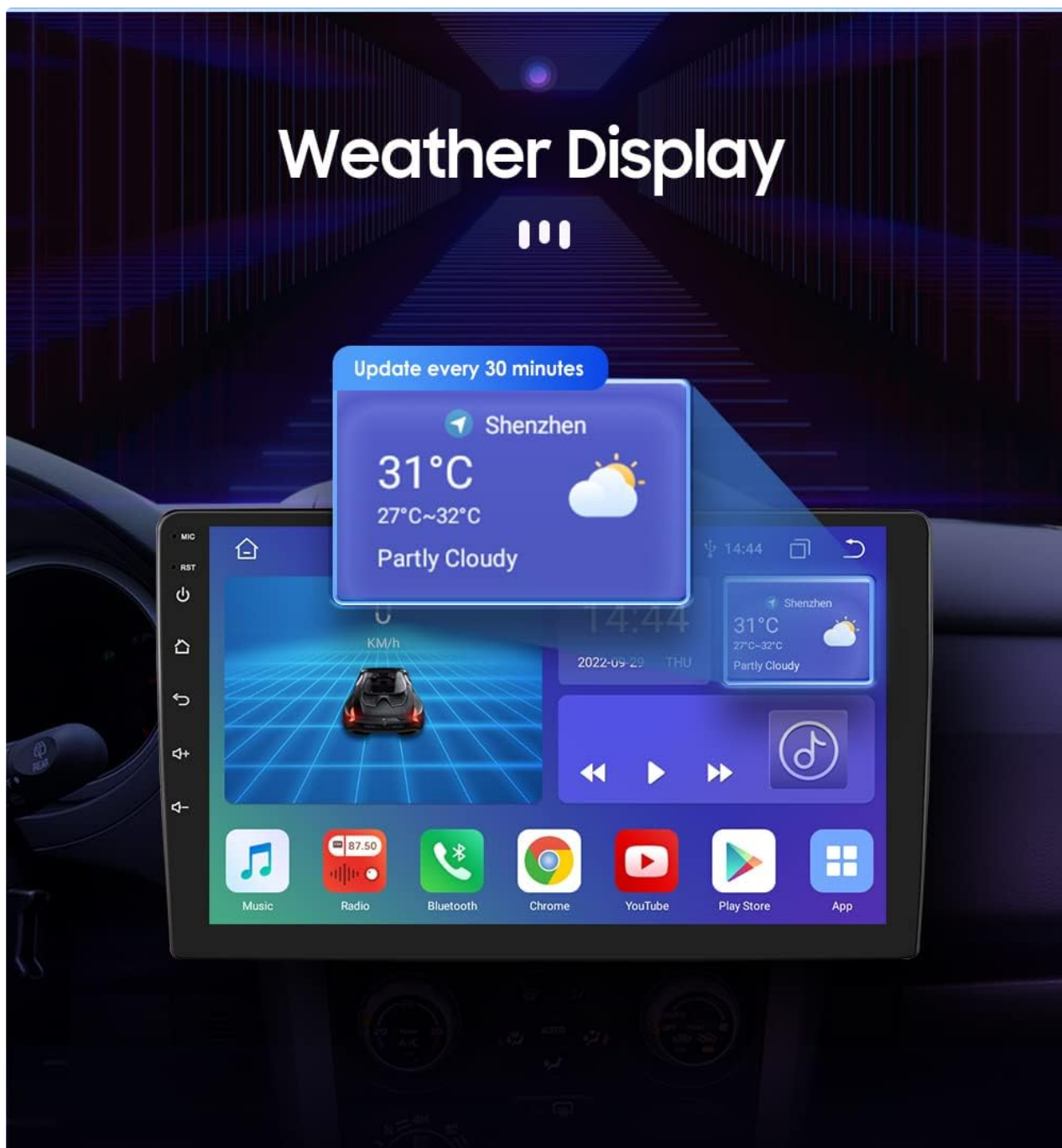
Image: Home screen displaying the weather widget.