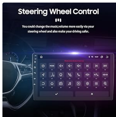
Image: Interface for setting up steering wheel controls.

To configure steering wheel controls, navigate to the 'Steering Wheel Study' option in the settings menu. Follow the on-screen prompts to assign functions to your vehicle's steering wheel buttons. This allows for easier control of music and volume, enhancing driving safety.