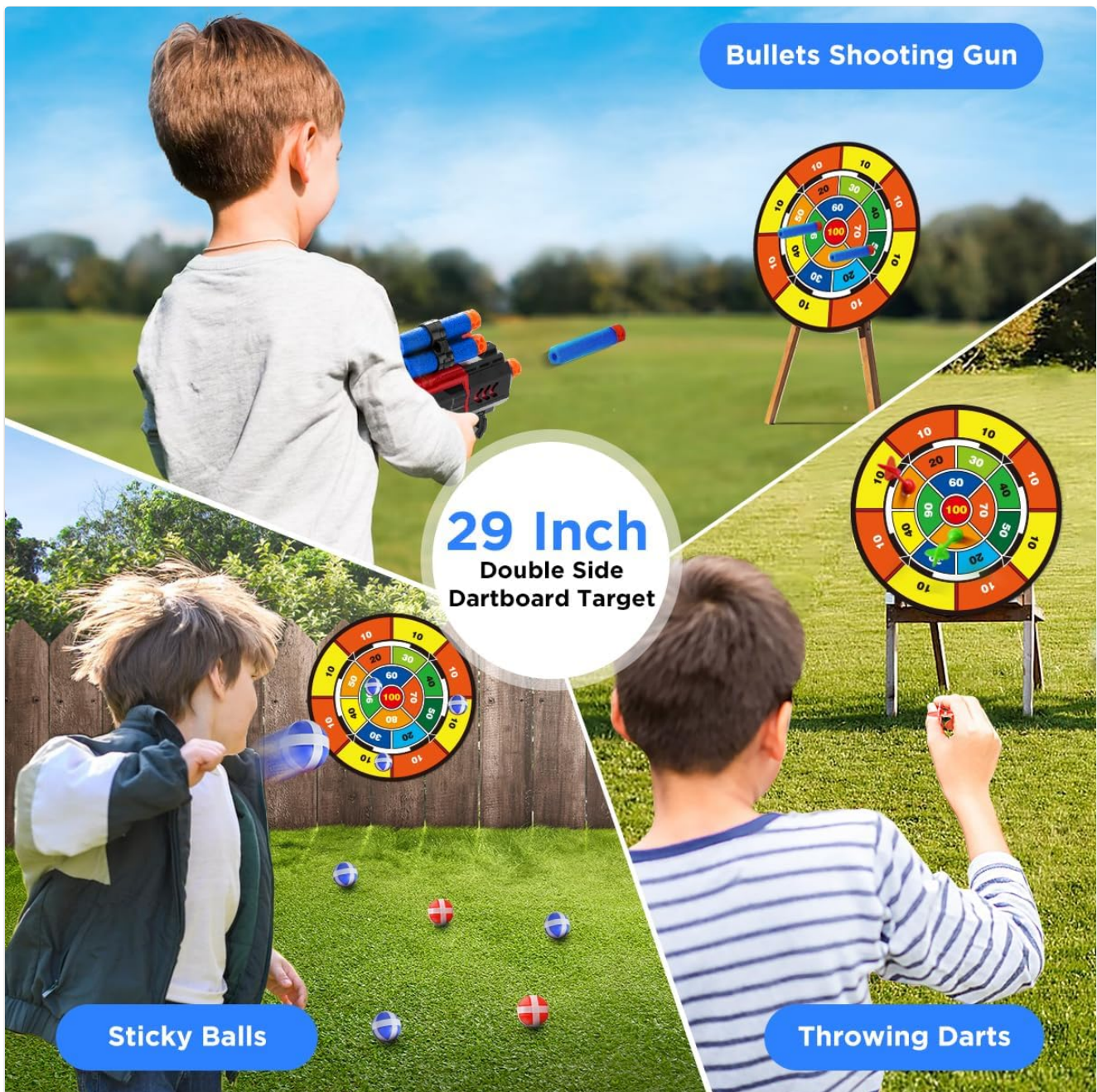
Image: Demonstrates various ways to use the dartboard, including with sticky balls and foam darts from the shooting gun.