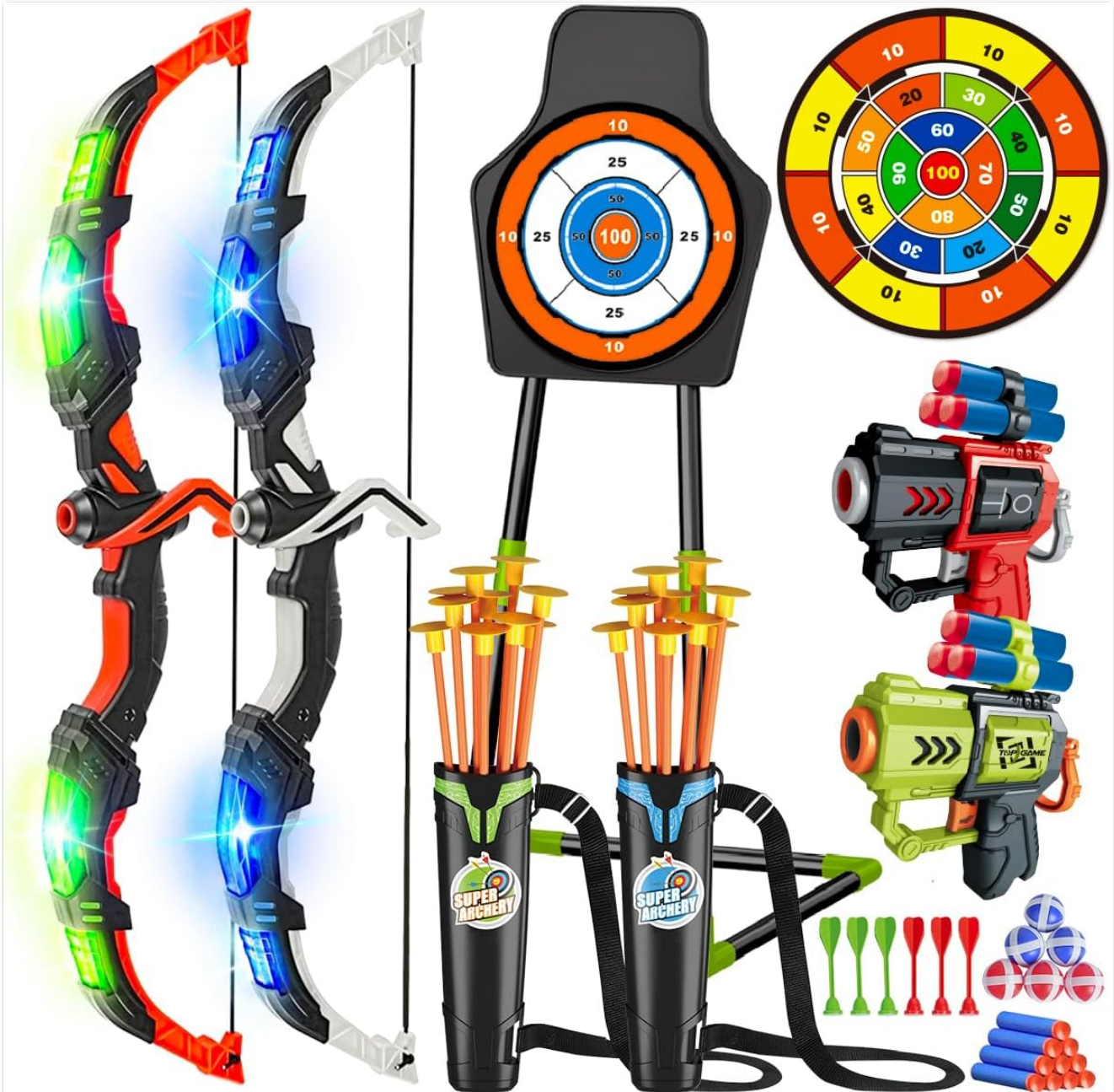
Image: Overview of all included components in the VATOS 2 Pack Bow and Arrow Toy set.