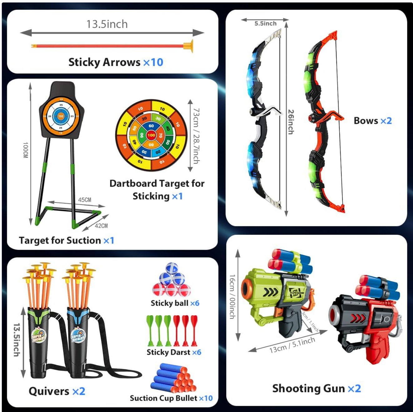
Image: Detailed dimensions of the toy components.