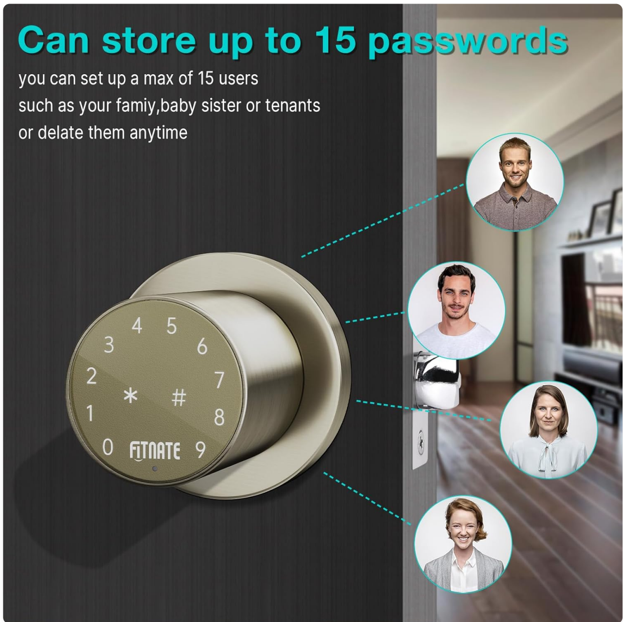
Image: The ability to store up to 15 user passcodes for various users.

you can set up a max of 15 users such as your family, baby sister or tenants or delete them anytime