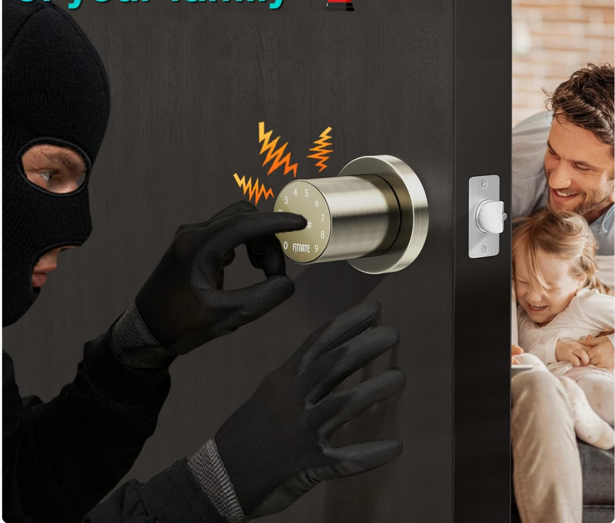
Image: Security features like anti-peeking password and an alarm to safeguard your family.