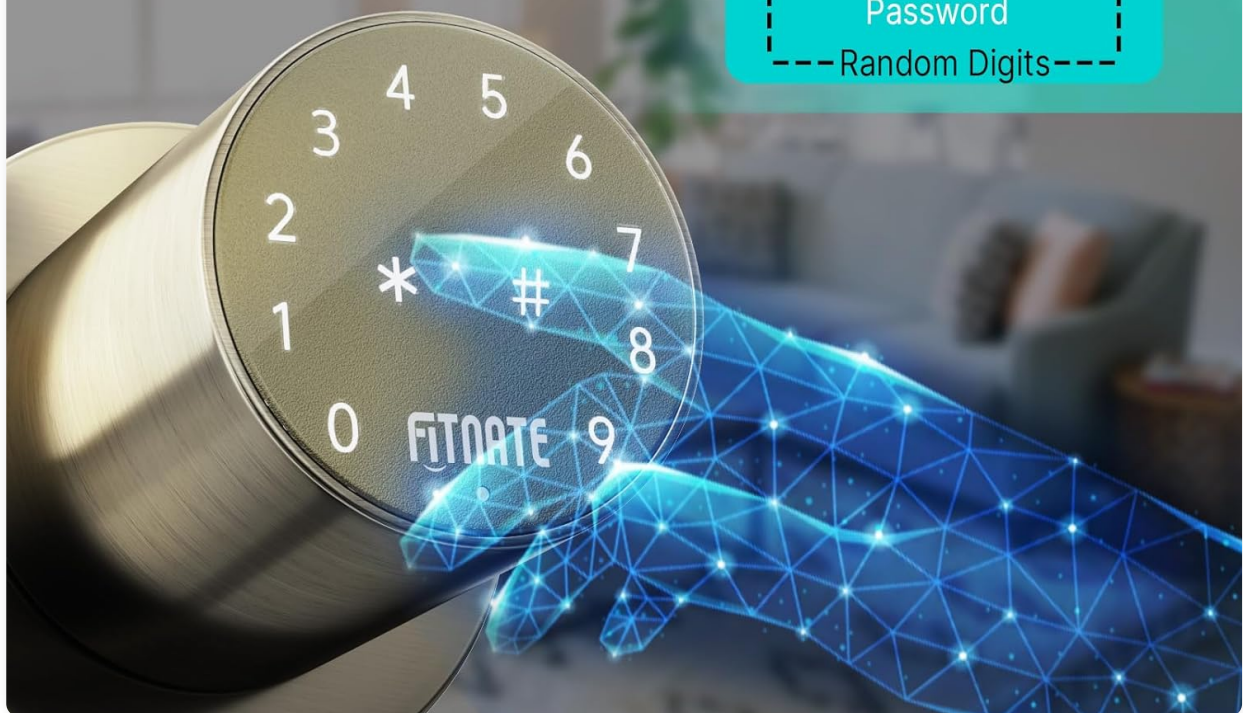
Image: The sensitive touchscreen keypad with anti-peeping code functionality.