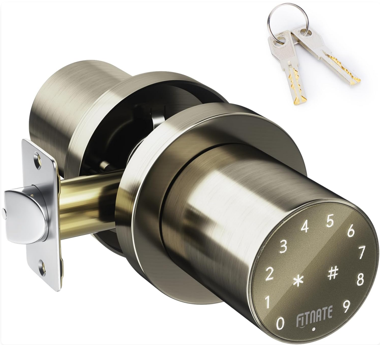
Image: The FITNATE Keyless Digital Door Knob, showcasing the keypad and included spare keys.