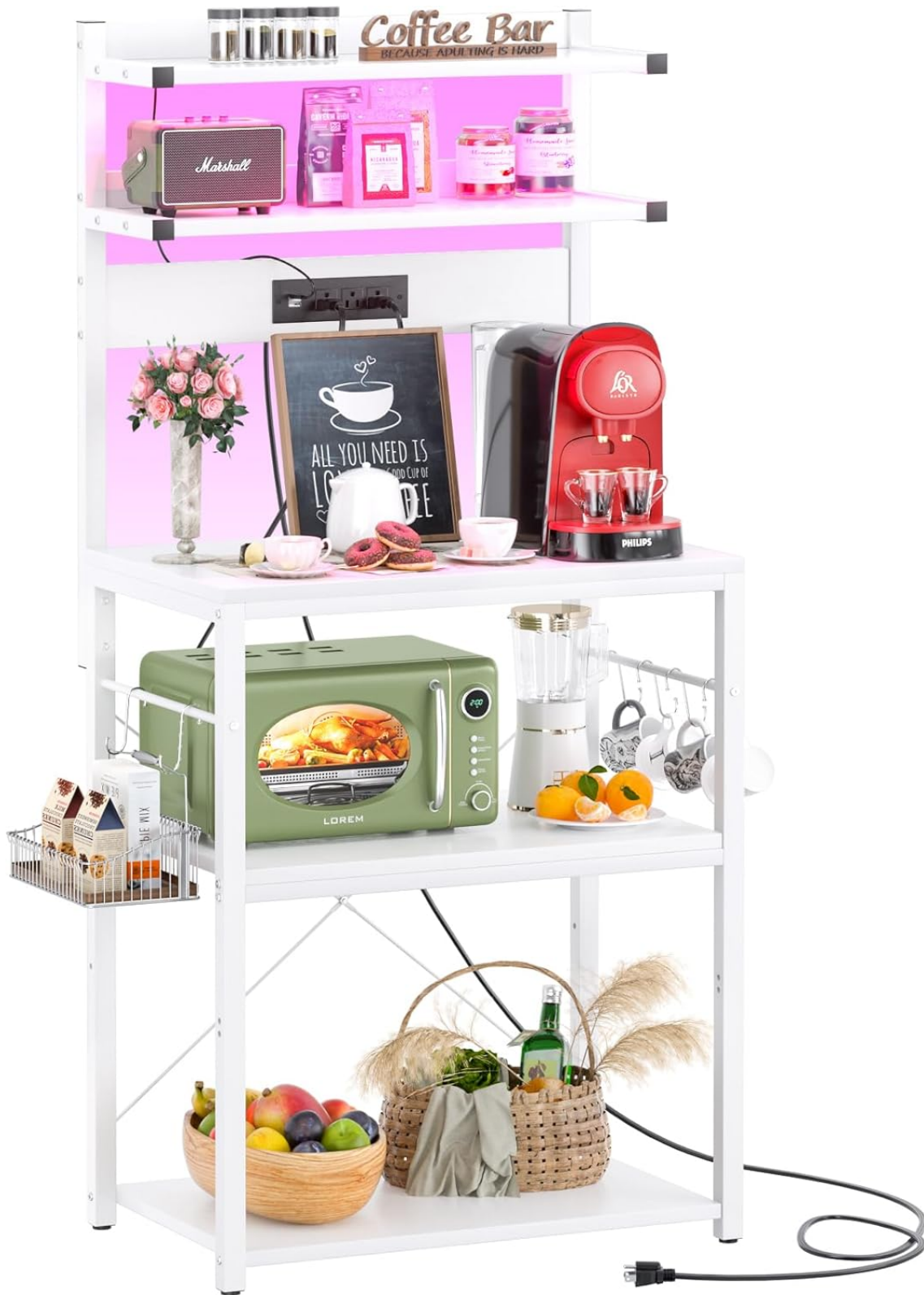
Image: The Aheaplus Bakers Rack, showcasing its five tiers, integrated power strip, and LED lighting, holding various kitchen appliances and decor.