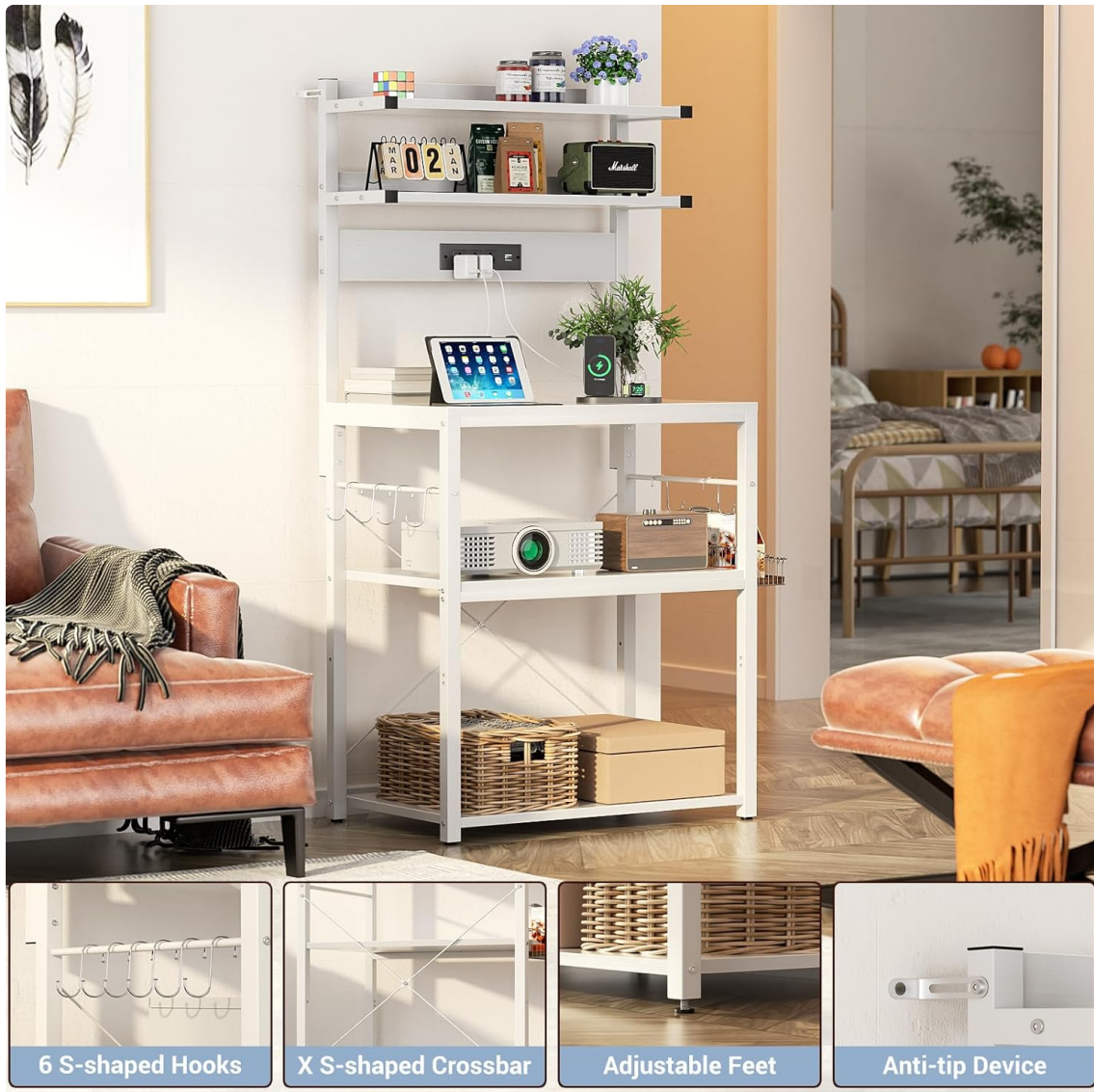
Image: Close-up showing key structural and accessory features: S-shaped hooks for hanging, an X-shaped crossbar for stability, adjustable feet for leveling, and an anti-tip device for safety.