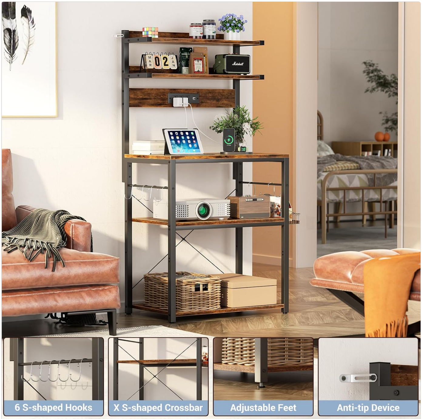
Figure 2: Key structural and safety features (S-shaped hooks, X-shaped crossbar, adjustable feet, anti-tip device)