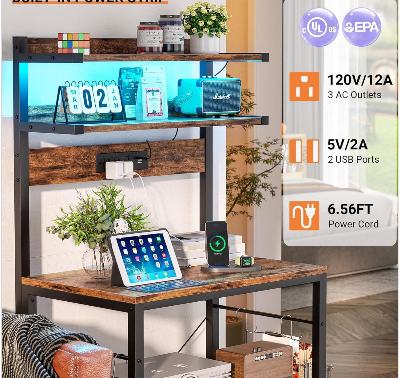
Figure 4: Integrated Power Outlet for convenient appliance use.