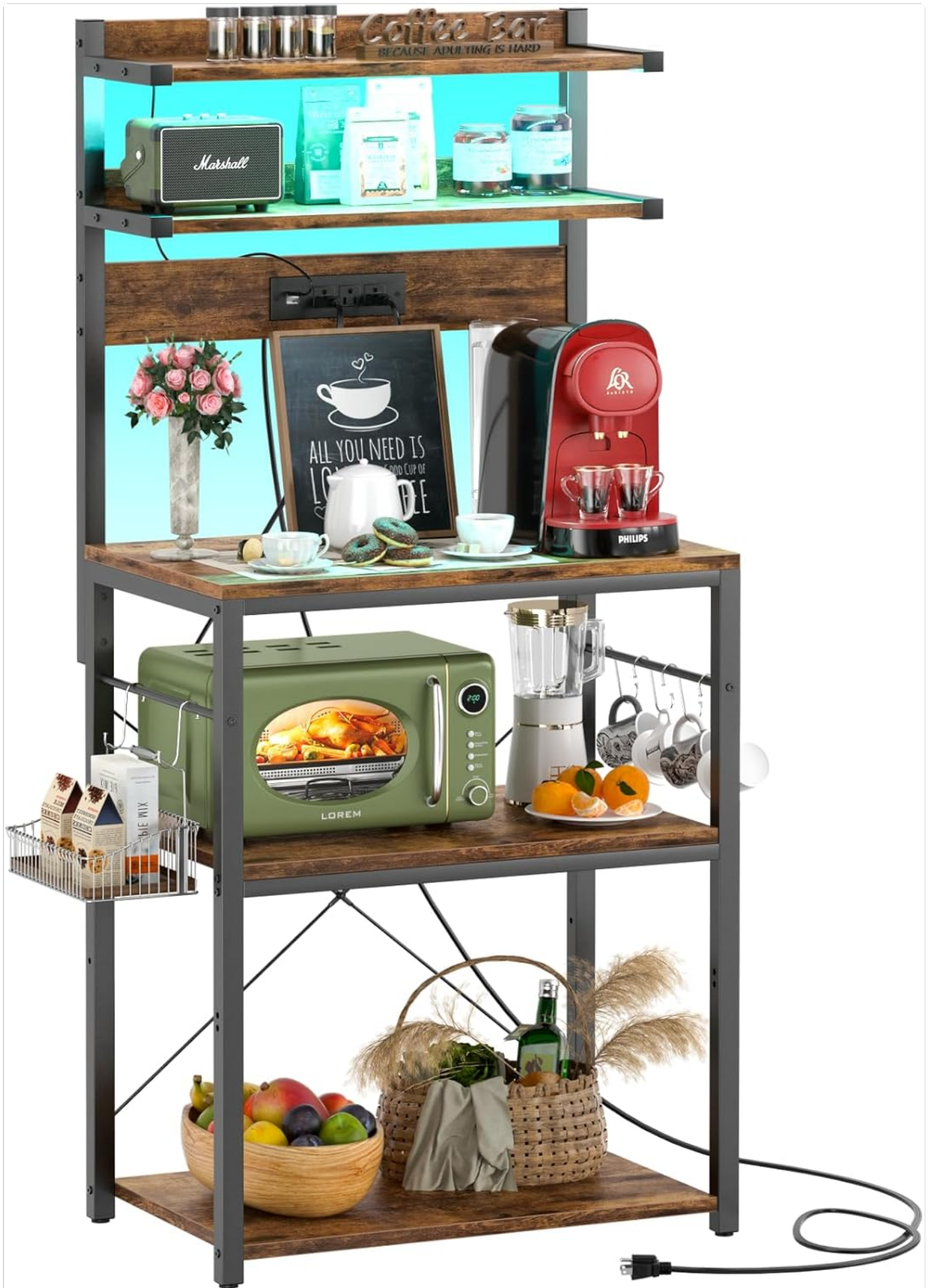
Figure 1: Aheplus 5-Tier Bakers Rack (Rustic Brown)