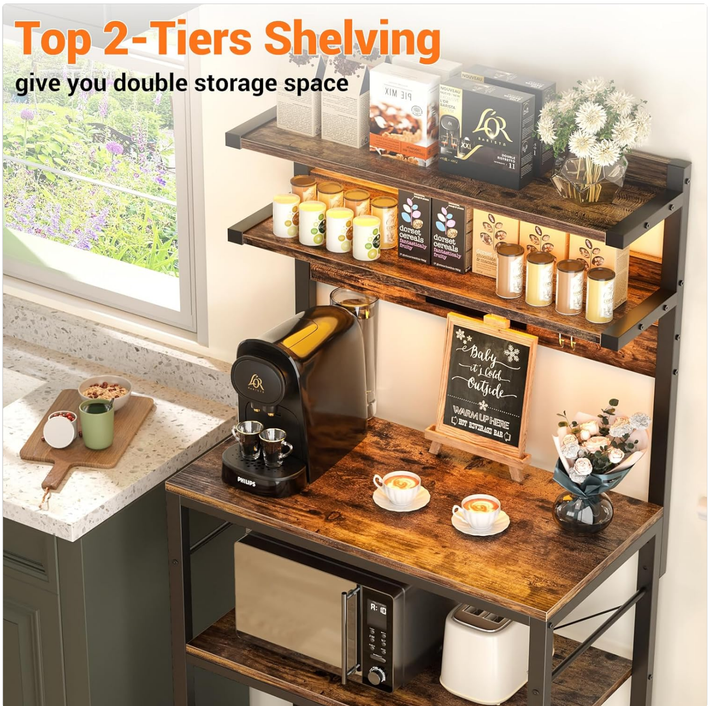
Figure 3: Assembled rack in a home environment.