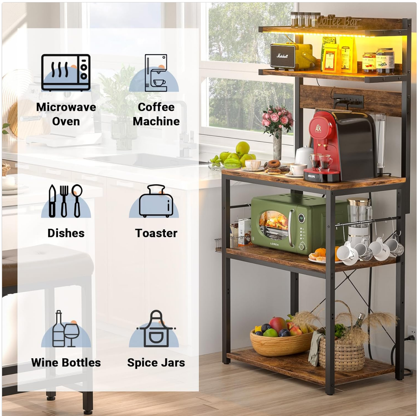
Figure 6: Examples of storage capacity and organization.