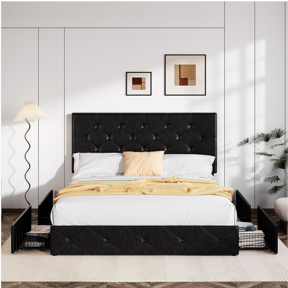
Figure 5: Adjustable headboard height options.