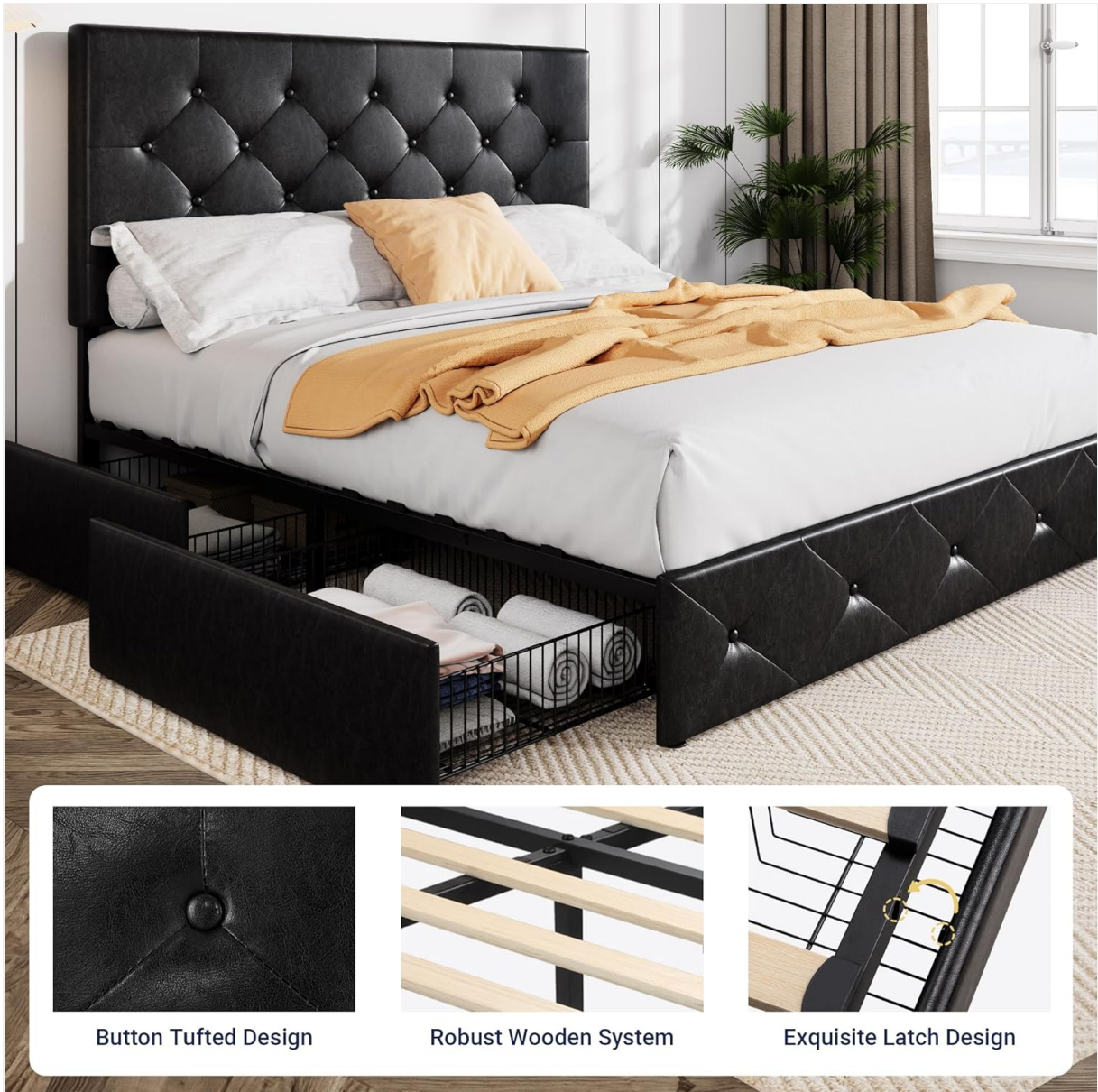
Button Tufted Design